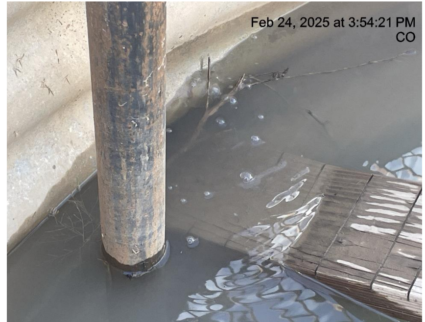
Photo # 8805 Mechanical Condition - Possible leak/gas bubbling up through water in cellar near bradenhead line (HANGS A2 well)