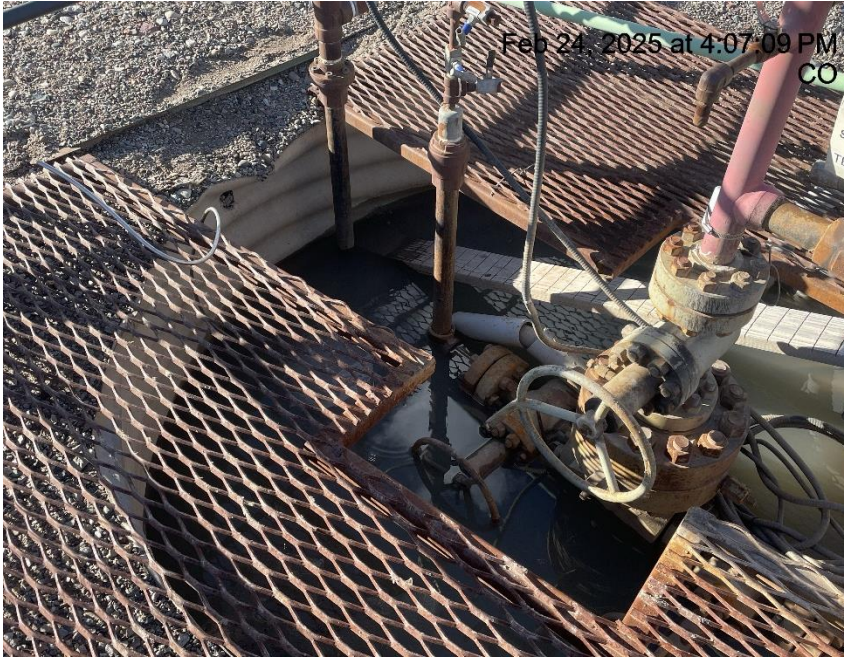
Photo # 8810 Cellar not properly covered/wildlife & personnel hazard