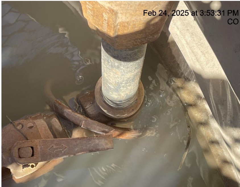
Photo # 8800 Mechanical Condition - Possible wellhead leak /gas bubbling up through water in cellar near casing valve (HANGS A2 wellhead)