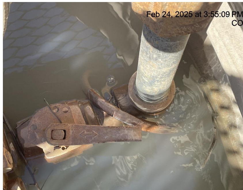
Photo # 8803 Mechanical Condition - Possible wellhead leak /gas bubbling up through water in cellar near casing valve (HANGS A2 wellhead)