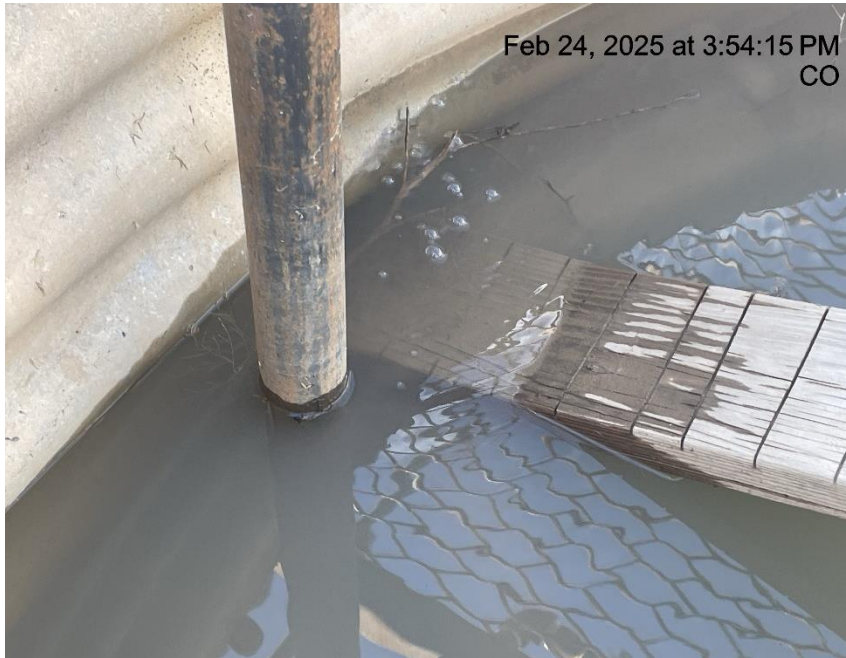
Photo # 8804 Mechanical Condition - Possible leak/gas bubbling up through water in cellar near bradenhead line (HANGS A2 well)