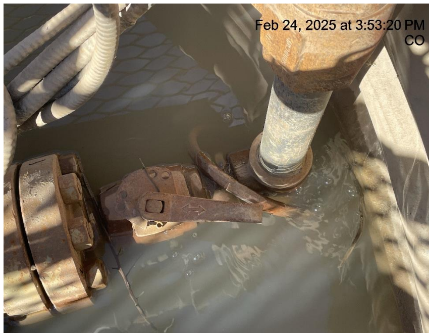
Photo # 8802 Mechanical Condition - Possible wellhead leak /gas bubbling up through water in cellar near casing valve (HANGS A2 wellhead)