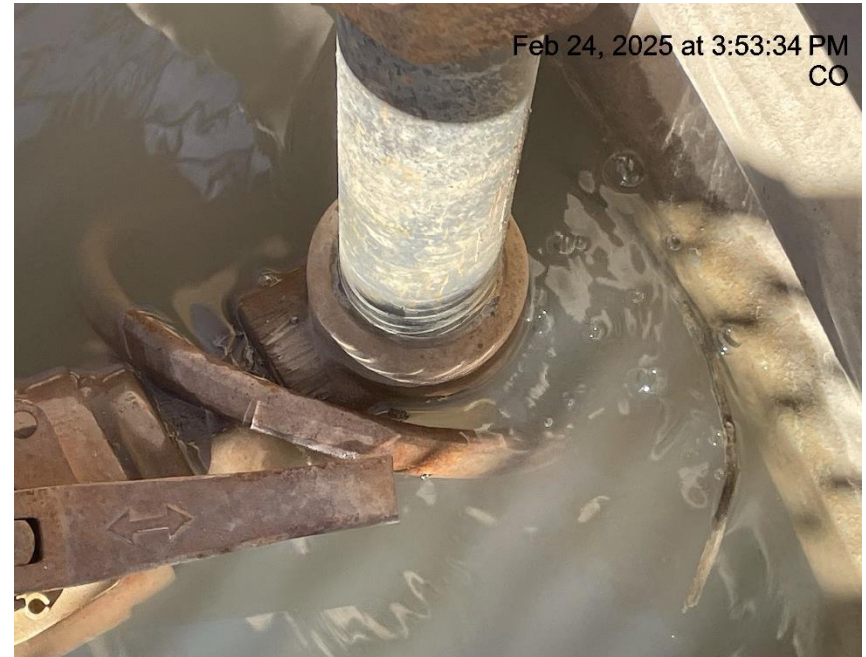
Photo # 8801 Mechanical Condition - Possible wellhead leak /gas bubbling up through water in cellar near casing valve (HANGS A2 wellhead)