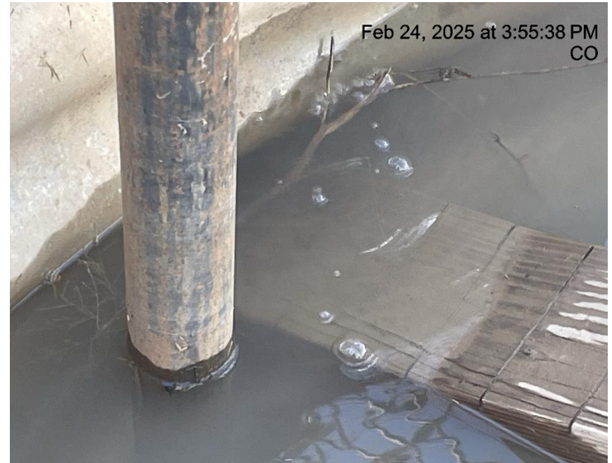
Photo # 8806 Mechanical Condition - Possible leak/gas bubbling up through water in cellar near bradenhead line (HANGS A2 well)