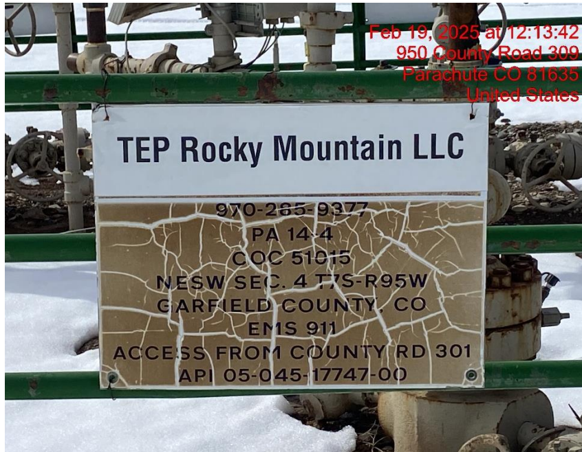
Weathered Wellhead Sign – Photo #06738