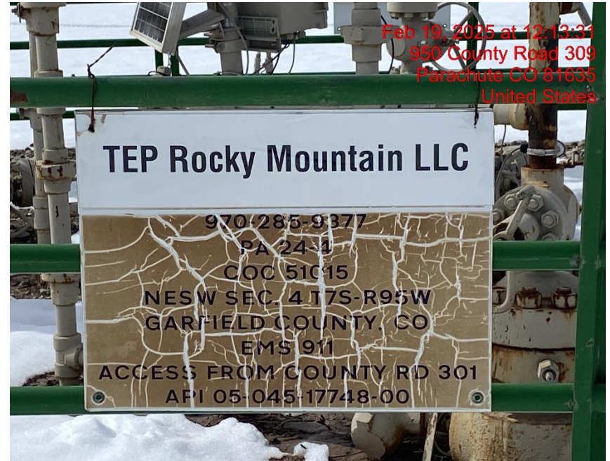
Weathered Wellhead Sign – Photo #06737