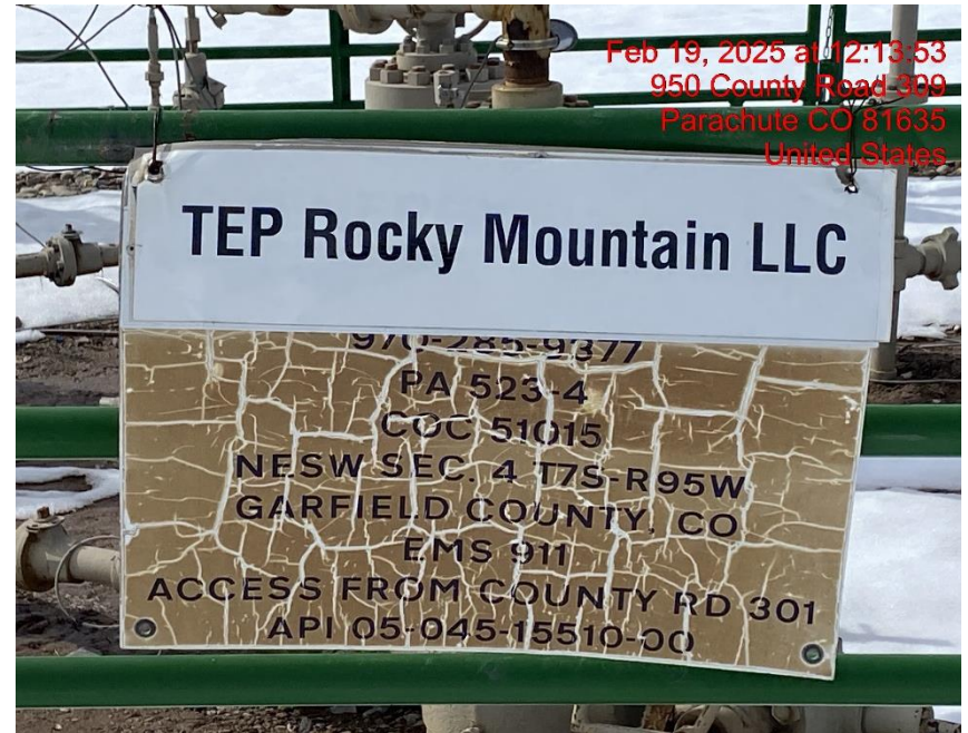
Weathered Wellhead Sign – Photo #06739