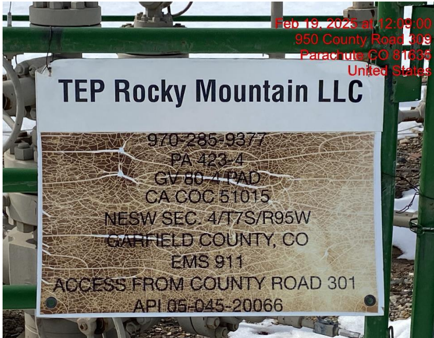
Weathered Wellhead Sign – Photo #06736