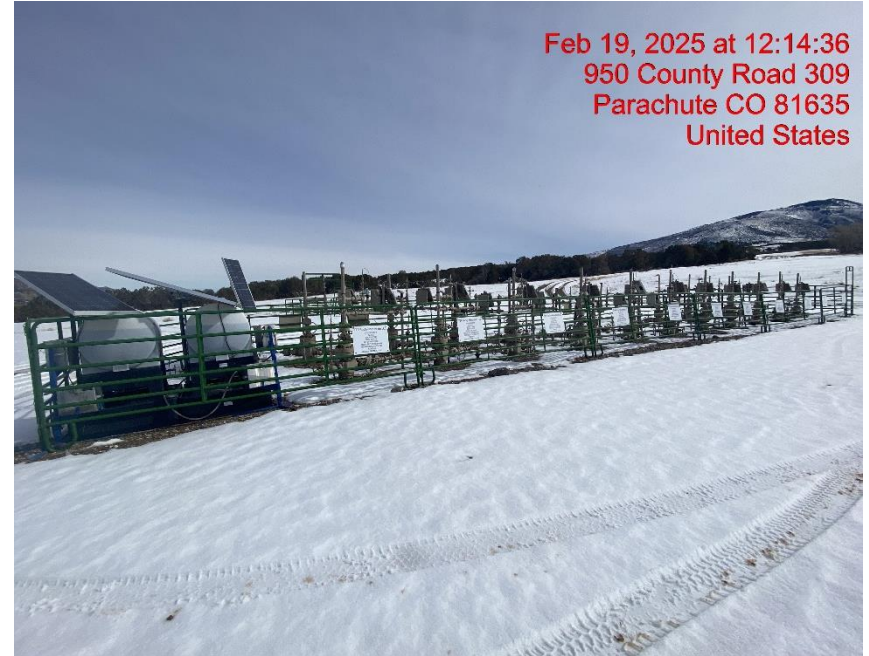
Location – Photo #06742