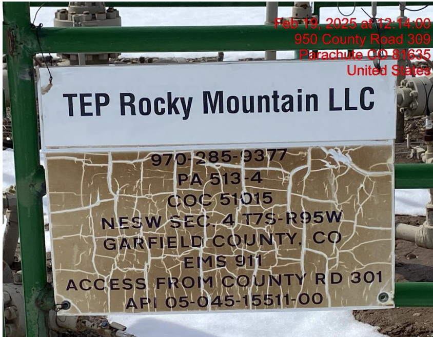
Weathered Wellhead Sign – Photo #06740