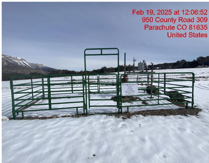
Location – Photo #06734