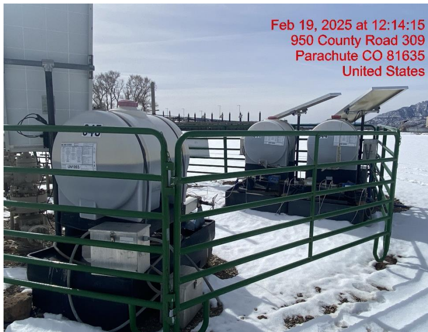
Location – Photo #06741