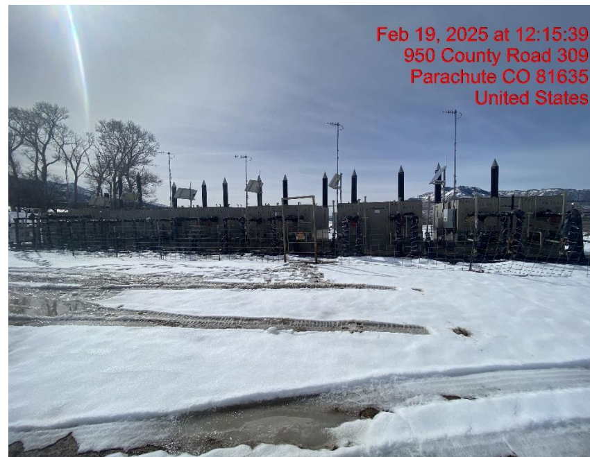
Location – Photo #06743