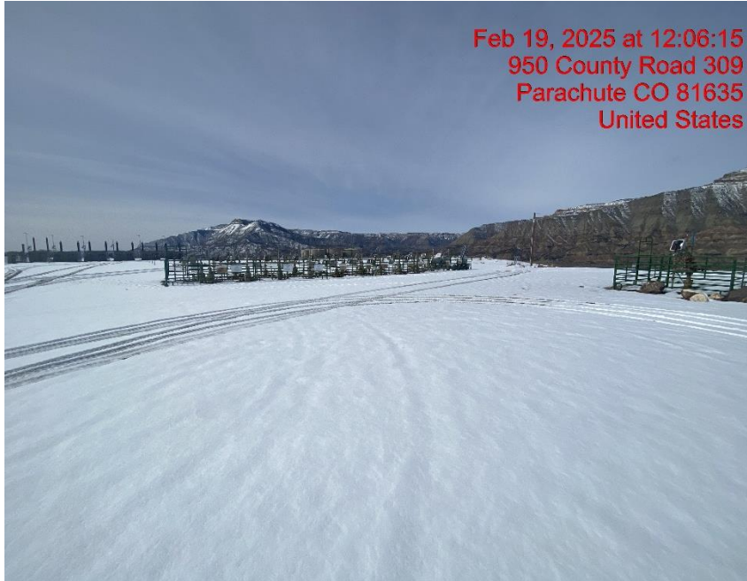
Location Overview – Photo #06733