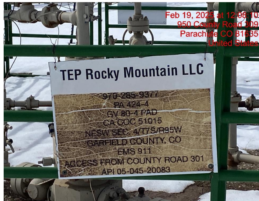
Weathered Wellhead Sign – Photo #06735