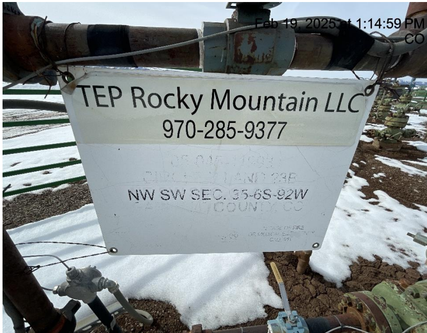
Photo # 7203 Wellhead sign weathered/faded & required info is becoming illegible