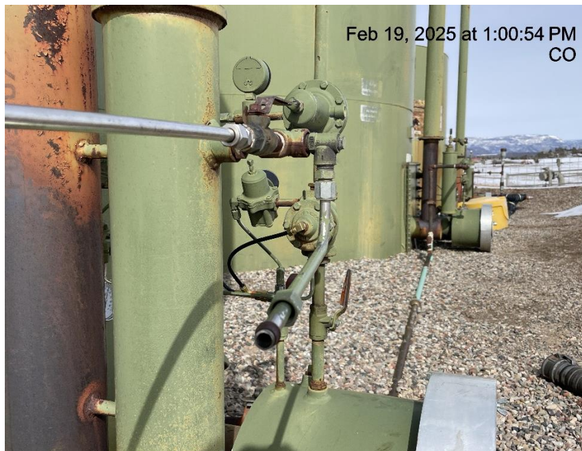
Photo # 7207 PRV vent line does not comply with CECMC pressure safety device rules & general safety rules