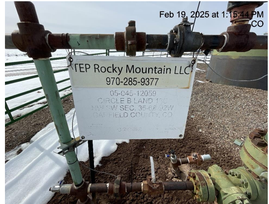
Photo # 7204 Wellhead sign weathered/faded & required info is becoming illegible