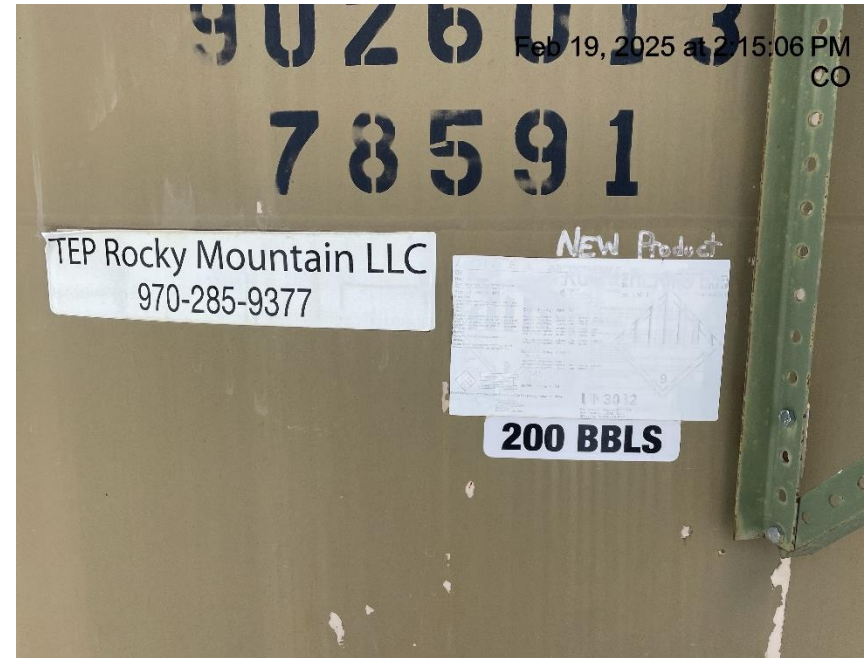
Photo # 7540 Tank label faded & some required information is illegible