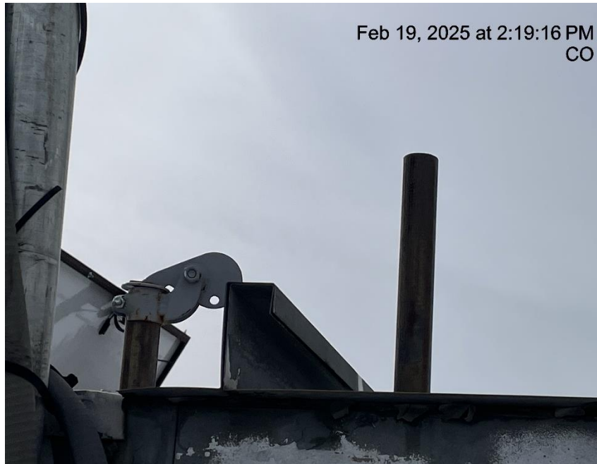
Photo # 7537 Rupture disc vent line does not comply with CECMC pressure safety device rules