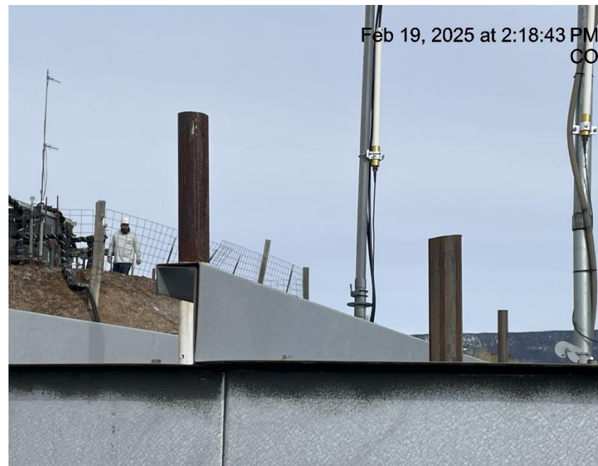
Photo # 7536 Rupture disc & PRV vent lines do not comply with CECMC pressure safety device rules