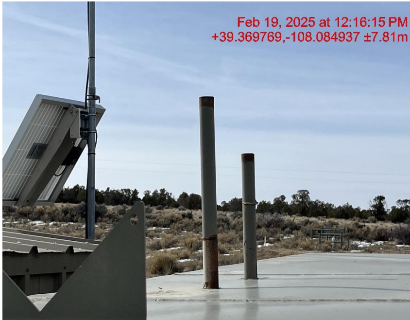
Photo # 5363 PRV vent line & rupture disc vent line does not comply with CECMC pressure safety device rules