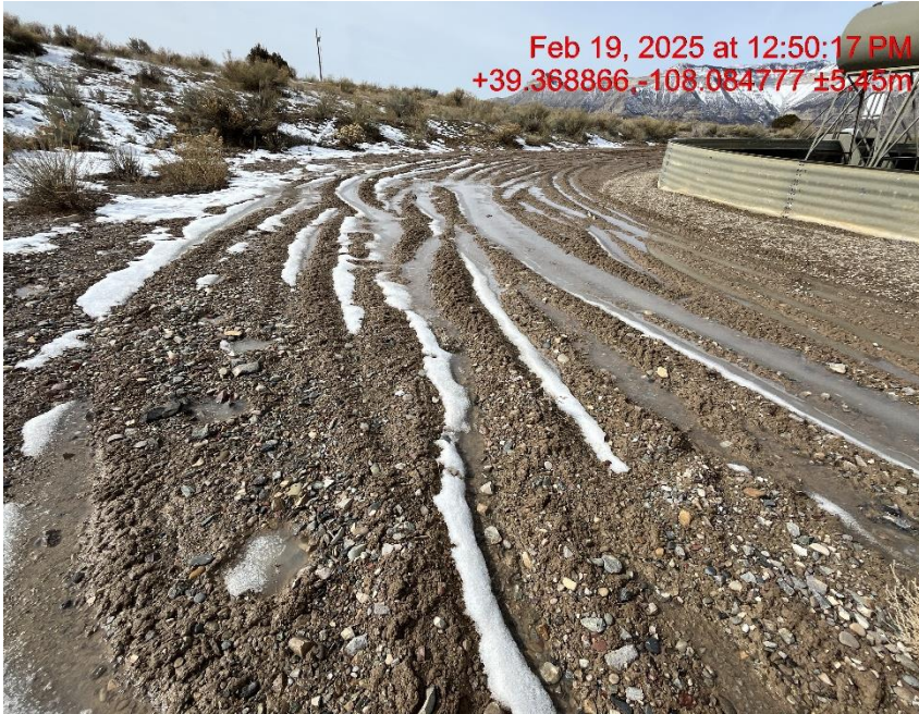
Photo # 5399 Lack of stabilization/compaction on location/insufficient tracking BMP's