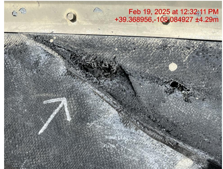
Photo # 5380 Holes in secondary containment liner/liner needs maintenance