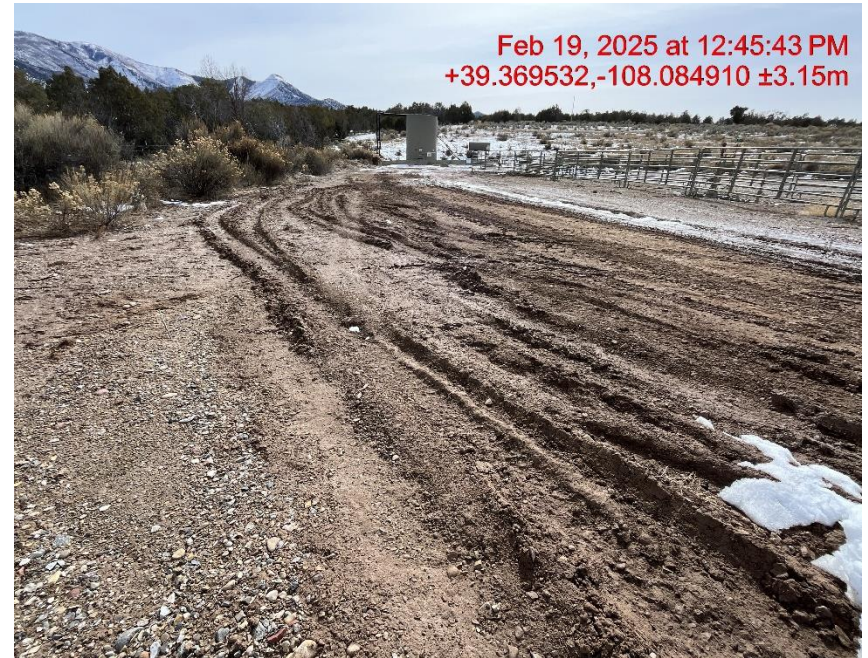
Photo # 5394 Lack of stabilization/compaction on location/insufficient tracking BMP's