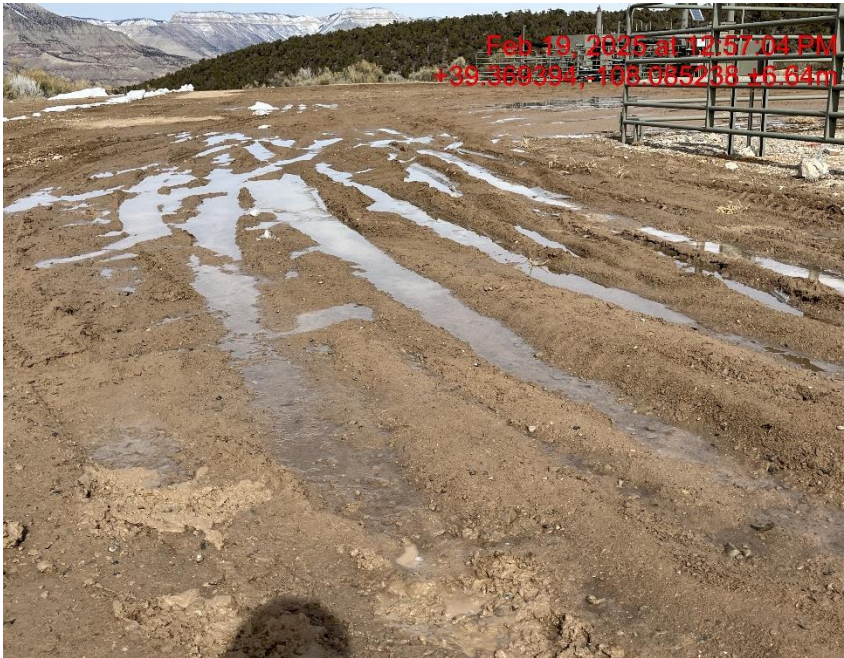
Photo # 5411 Lack of stabilization/compaction on location/insufficient tracking BMP's