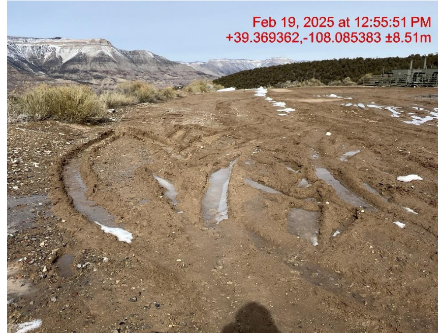
Photo # 5408 Lack of stabilization/compaction on location/insufficient tracking BMP's