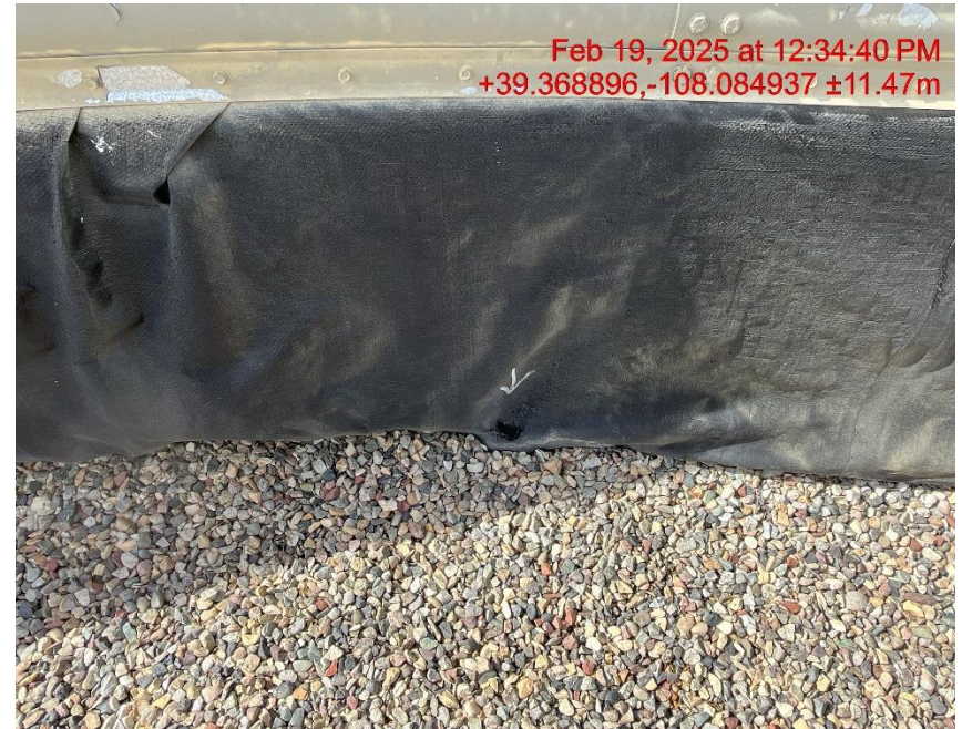
Photo # 5385 Holes in secondary containment liner/liner needs maintenance