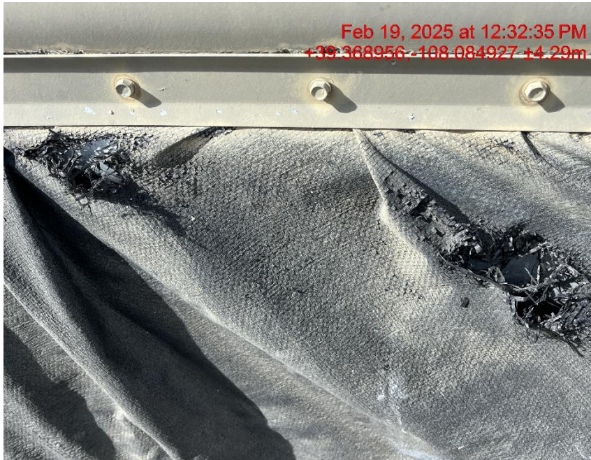
Photo # 5382 Holes in secondary containment liner/liner needs maintenance