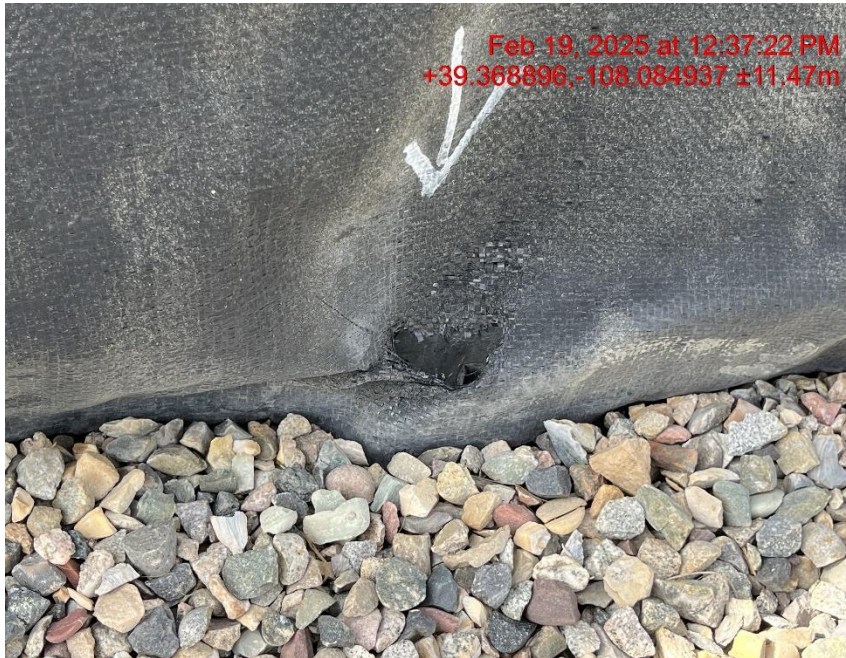
Photo # 5389 Holes in secondary containment liner/liner needs maintenance