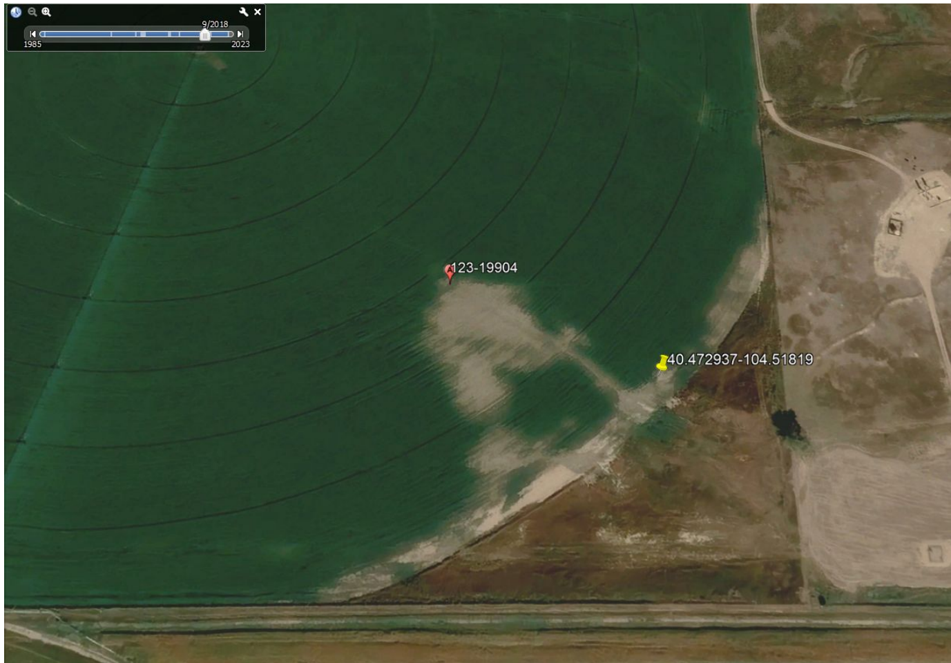
Photo 2. Google Earth aerial imagery (circa 09/2018), approximately 6 months after P&A activities (03/06/2018), illustrating a disturbance around the former well location. (Lat/Long southeast of well location is from Operator supplied drone aerial imagery; Photo 3).