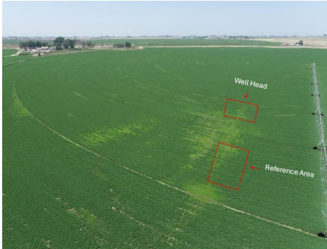
Figure 6: Looking West towards well and reference area, 100 feet in height, Lat/Long: 40.472937/-104.51819.