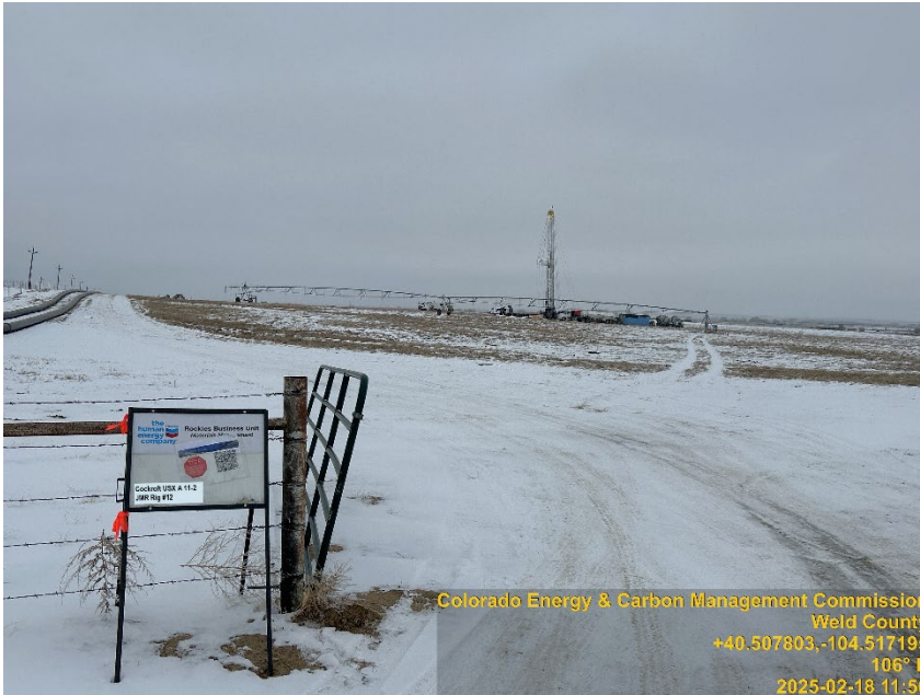
Colorado Energy & Carbon Management Commission Weld County +40.507803,-104.517195 106° E 2025-02-18 11:56