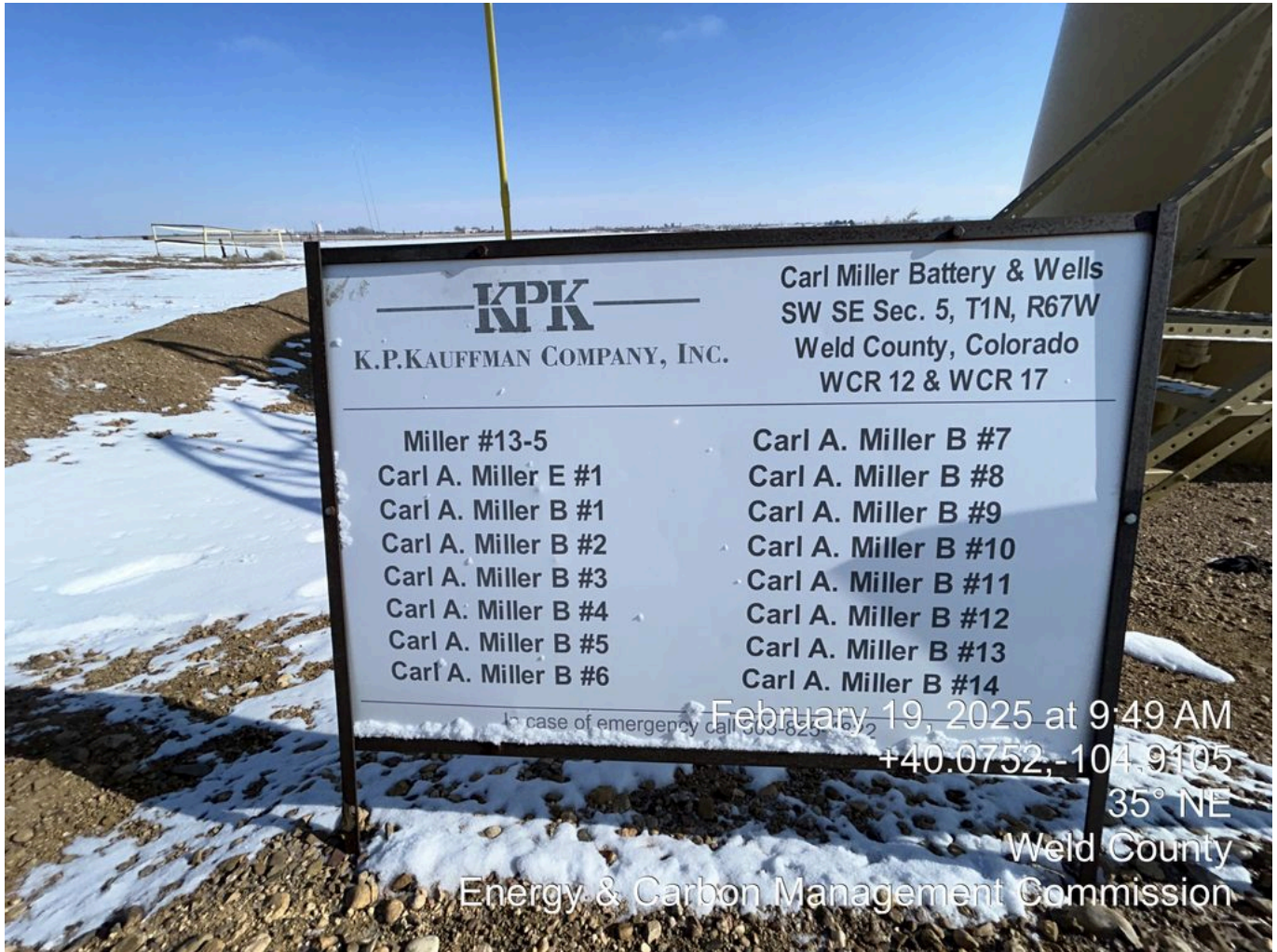
Wells associated with the Tank Battery