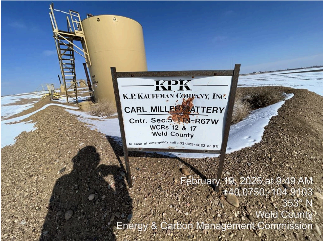
Sign/ Tank Battery