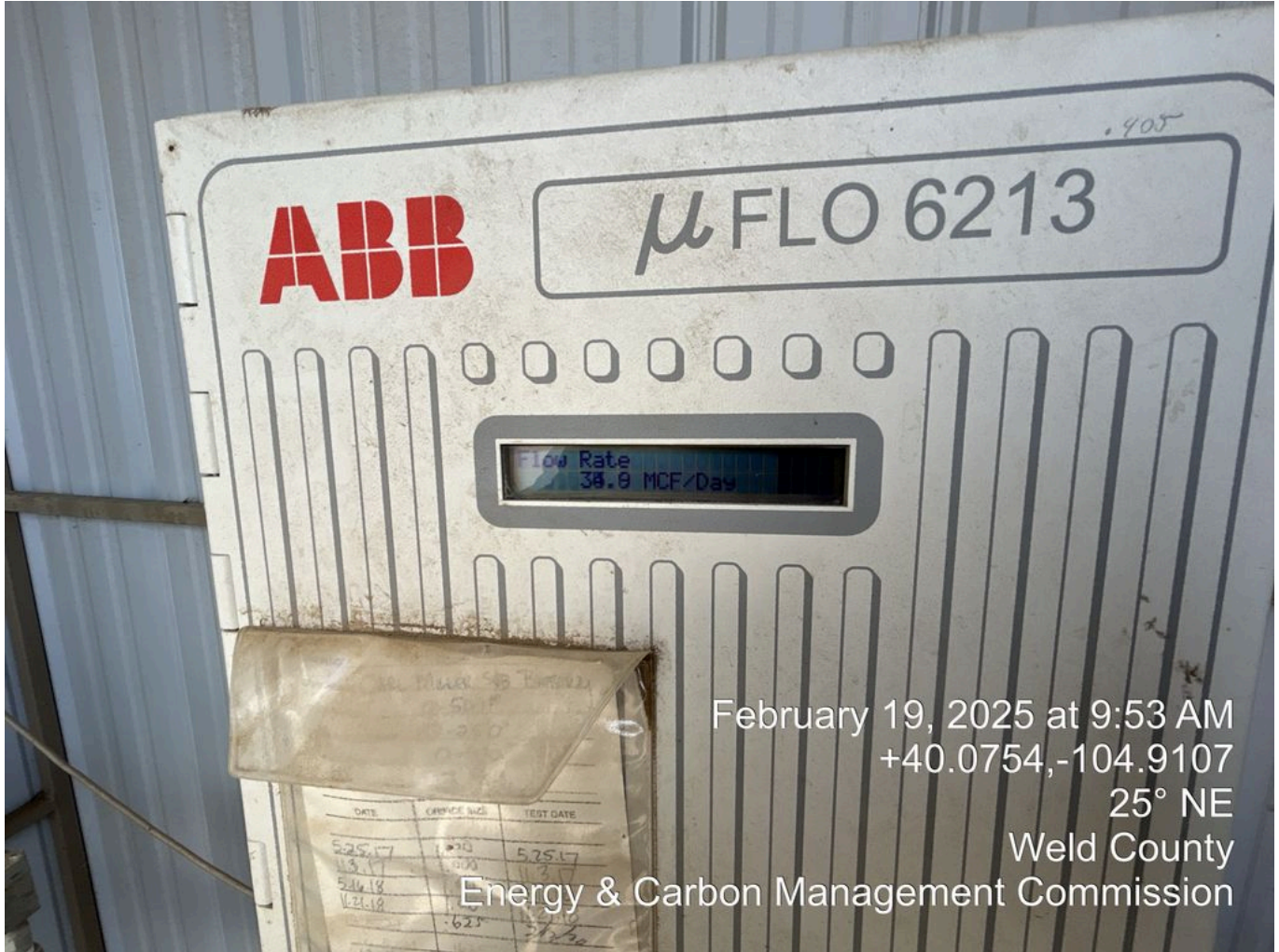
Gas Meter "Showing Flow Rate"