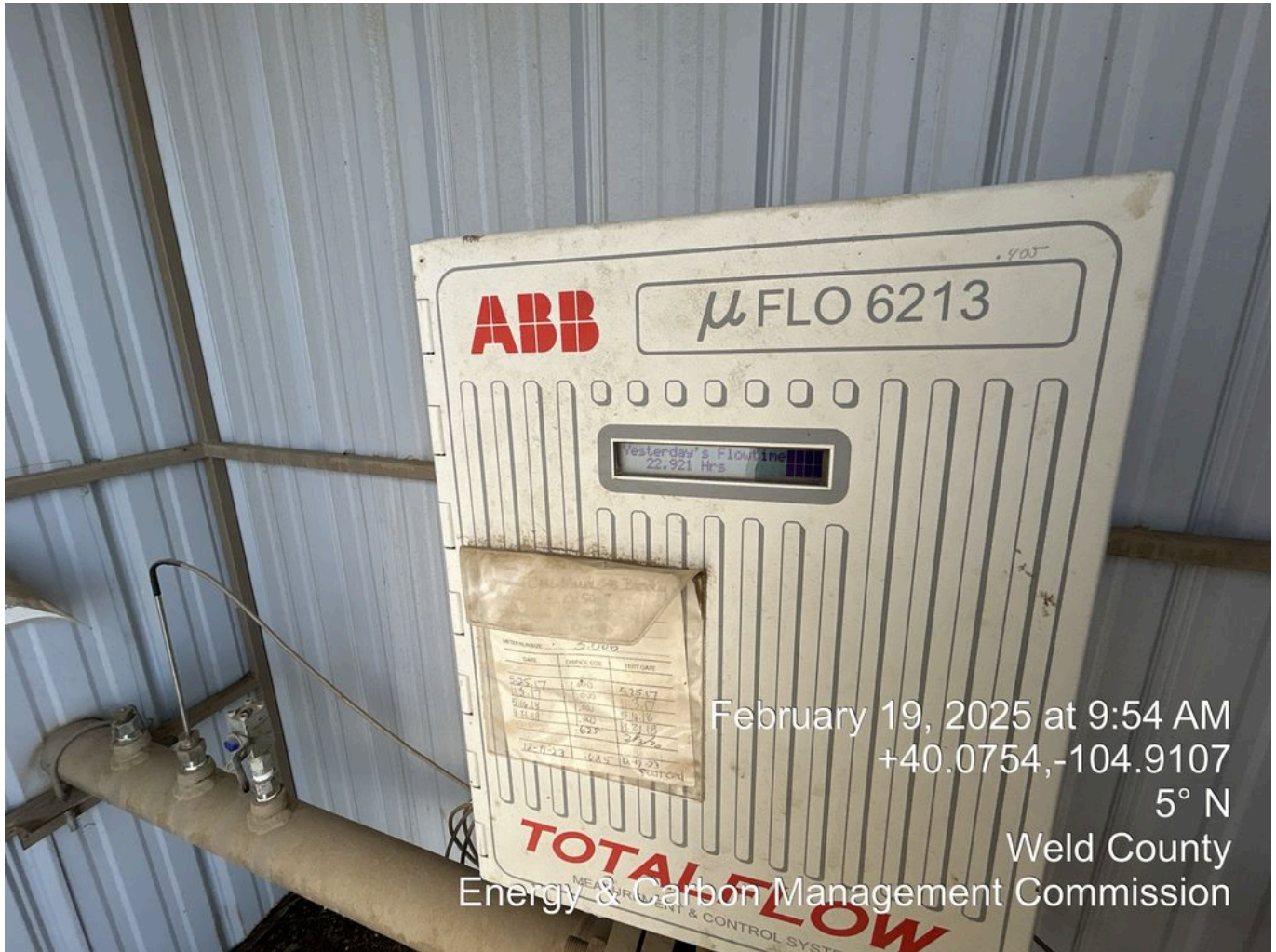
Gas Meter Run Showing 2-18-25 Flow-Time