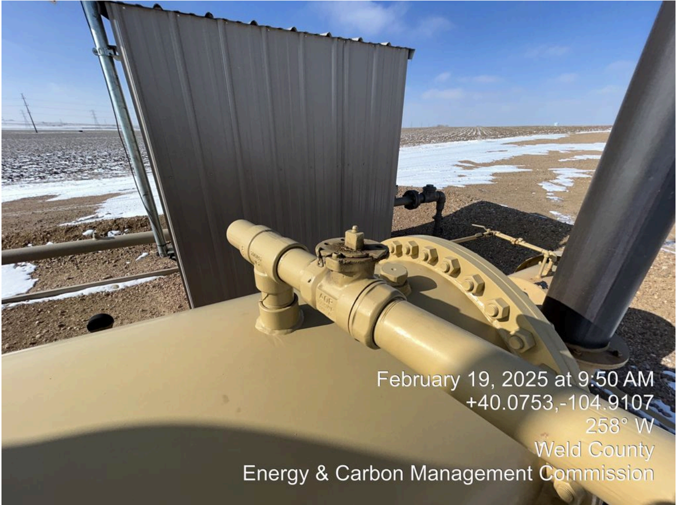
Top Side Flow-line valve at separator appears open