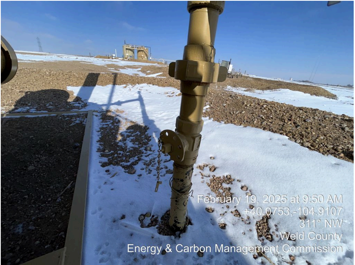
Ground Flow-line valve at separator appears open