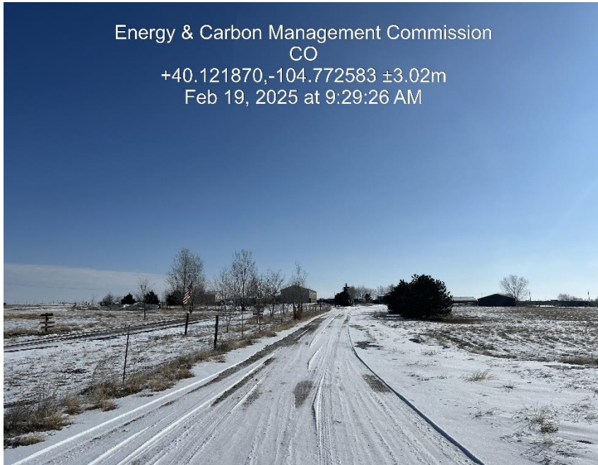
Photo 1 Entrance to location