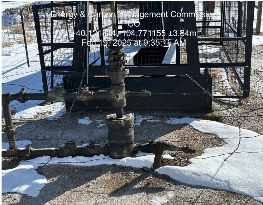
Photo 3 Wellhead & valves