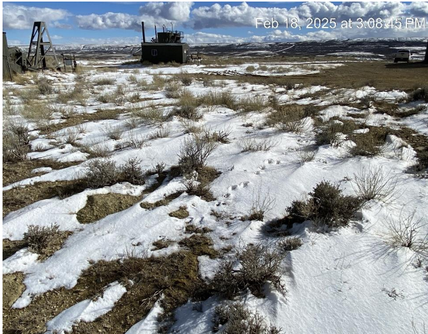
Location from Northwest corner