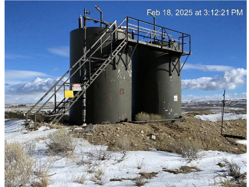
No sign at tank battery