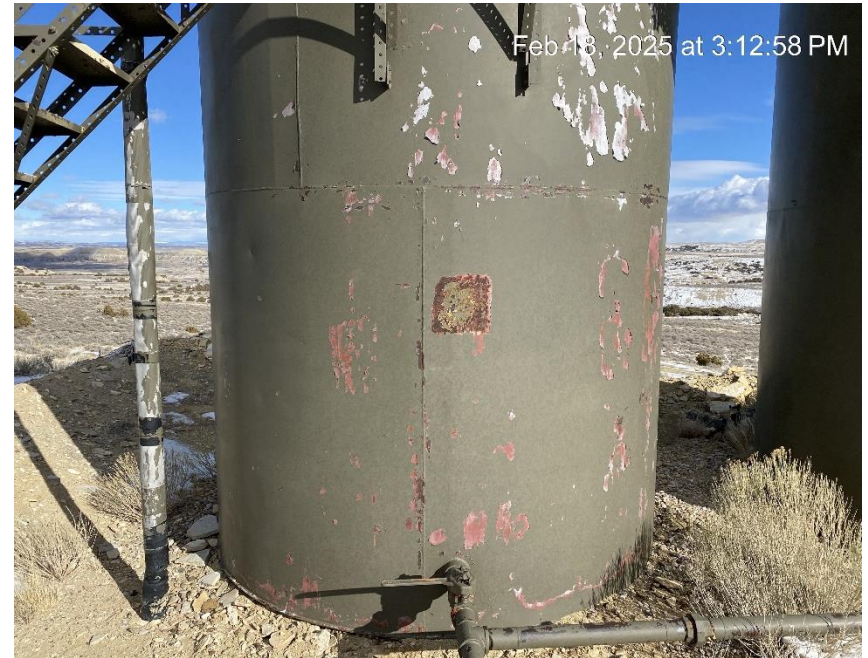
No tank label