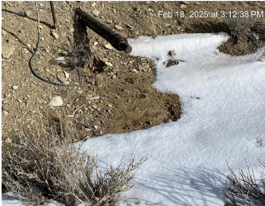
Oily waste and staining