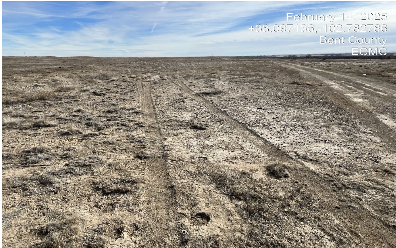
Photo 1. Facing southeast toward the location. The location and access road has not been reclaimed.