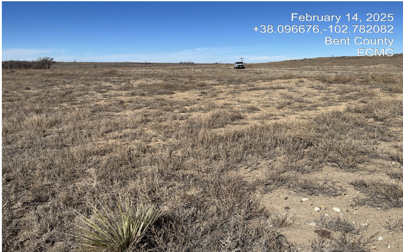
Photo 4. Southeast side of the location facing northwest. This area consist of undesirable weeds and bare soils. Reclamation has not been performed.