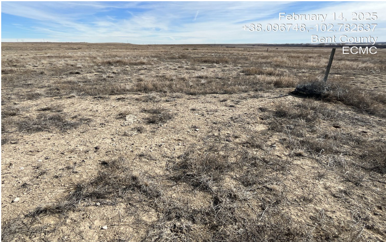
Photo 2. Southwest side of the location facing northeast. This area consist of undesirable weeds and bare soils. Reclamation has not been performed.