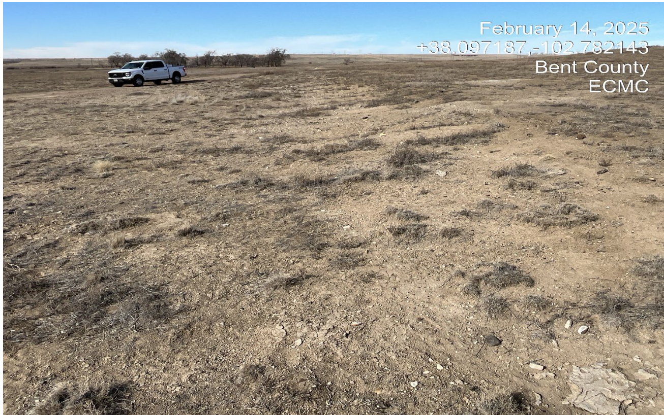
Photo 6. Facing west along the north side of the location. There are bare soils that need to be revegetated.