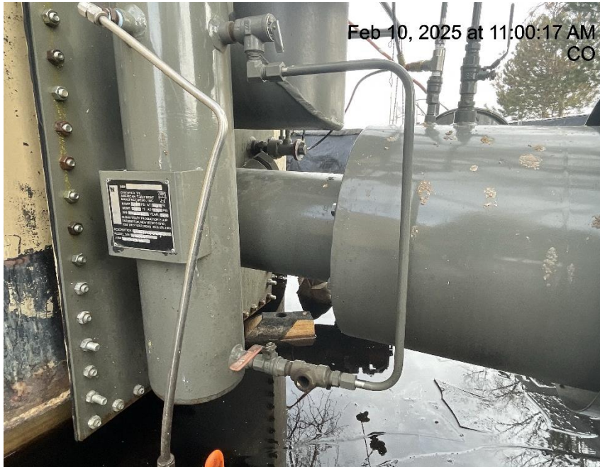
Photo # 4460 PRV vent line does not comply with CECMC pressure safety device rules