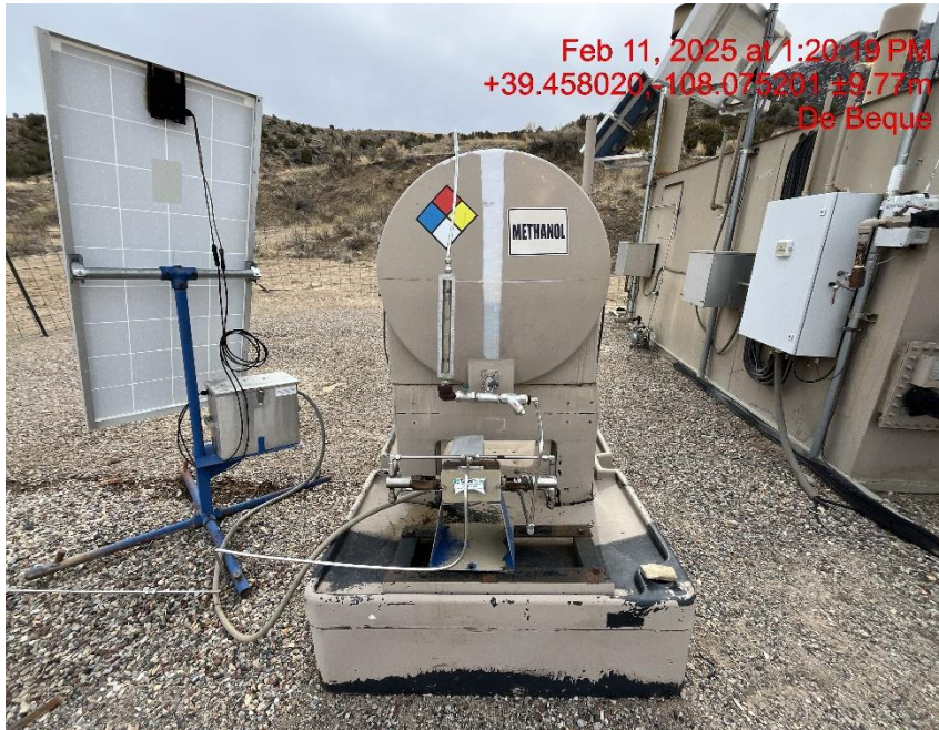
Photo # 4778 Lacks required labeling/does not comply with CECMC rules