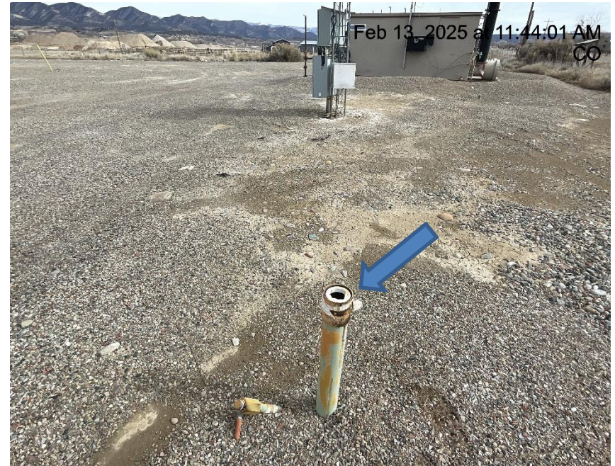
Photo # 5461 Open ended piping/available for entry by wildlife/wildlife hazard