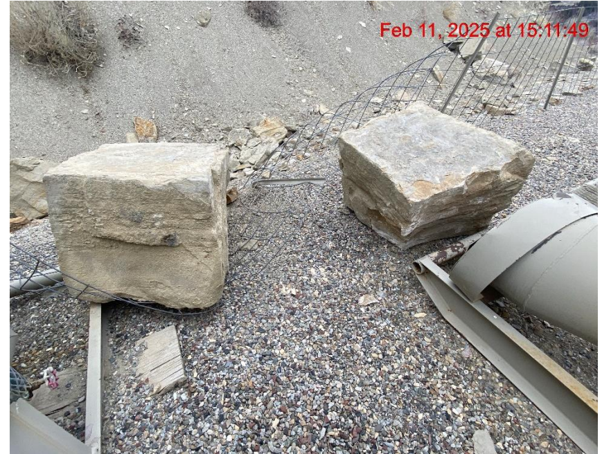
Insufficient Erosion Controls/Site Degradation – Photo #06604