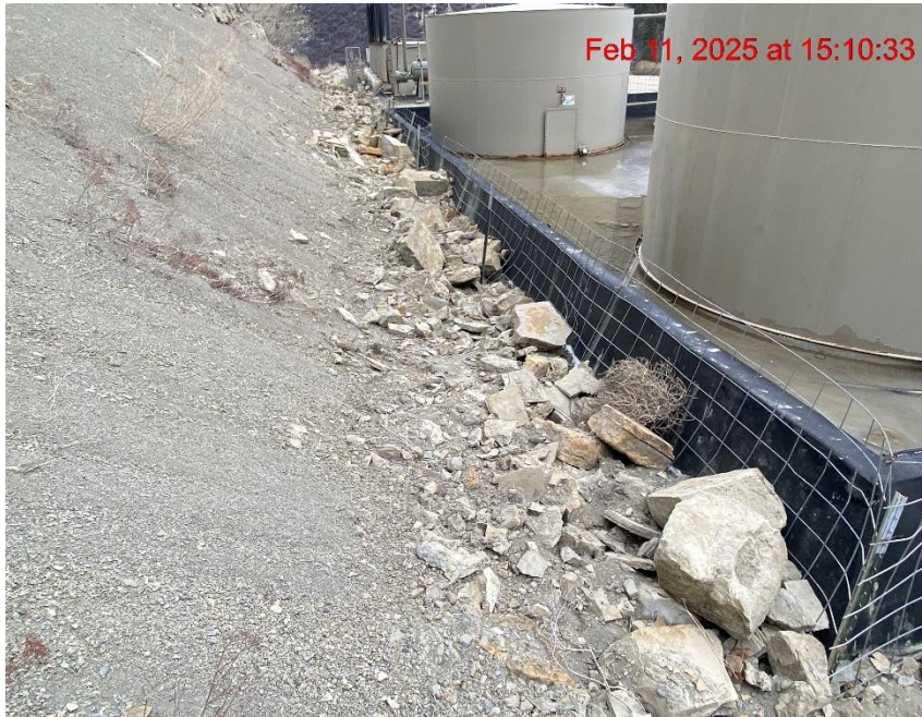
Insufficient Erosion Controls/Site Degradation – Photo #06599