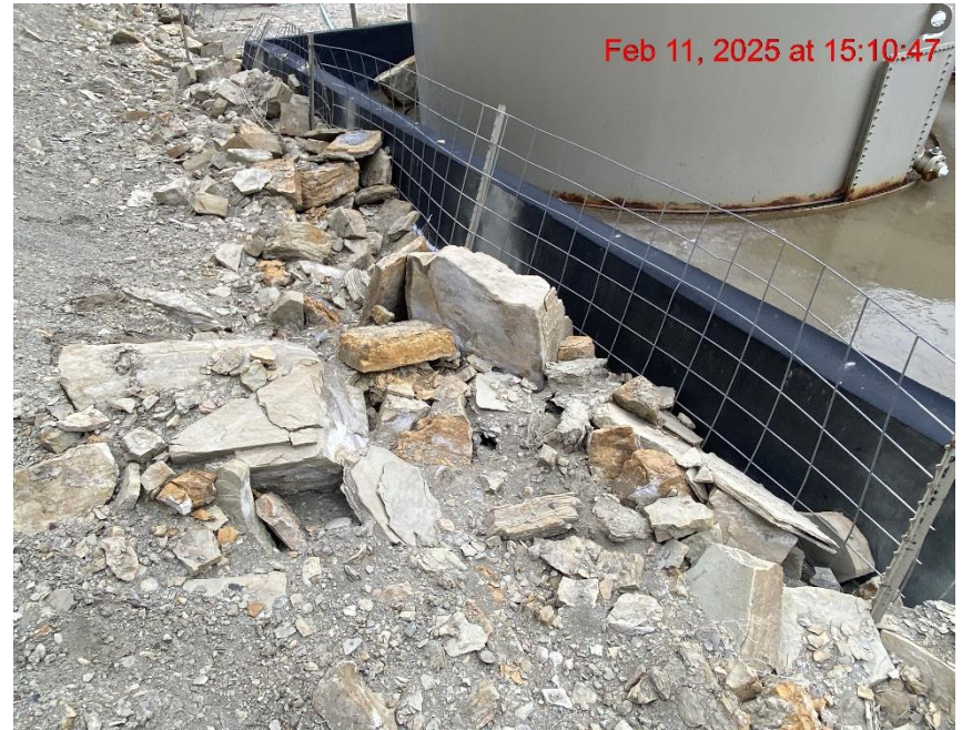
Insufficient Erosion Controls/Site Degradation – Photo #06600