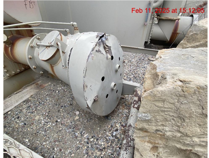
Insufficient Erosion Controls/Site Degradation – Photo #06606