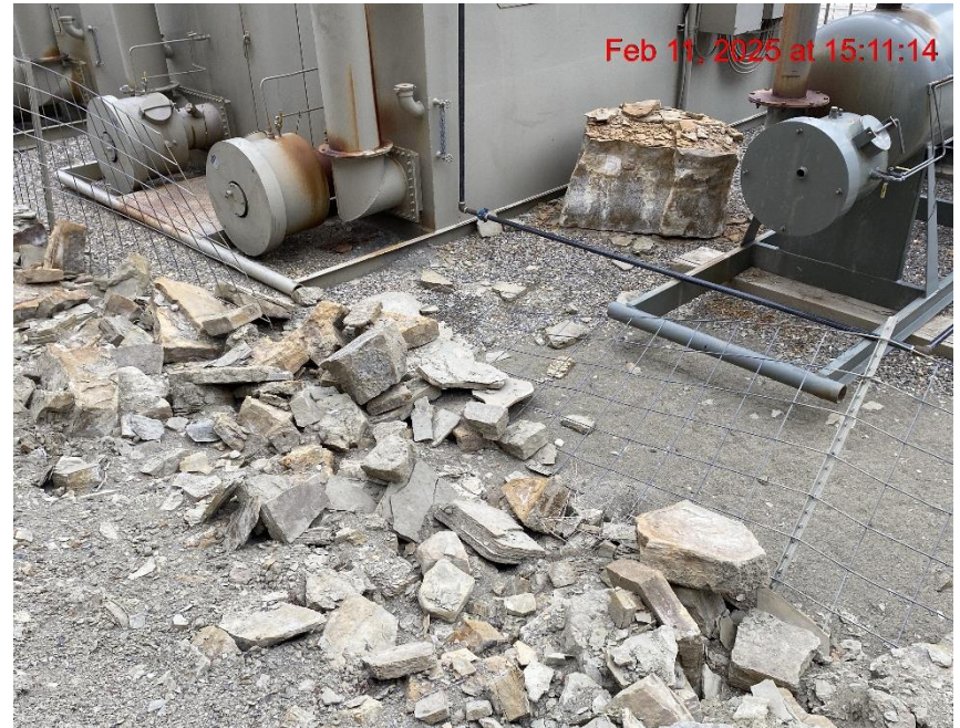
Insufficient Erosion Controls/Site Degradation – Photo #06602