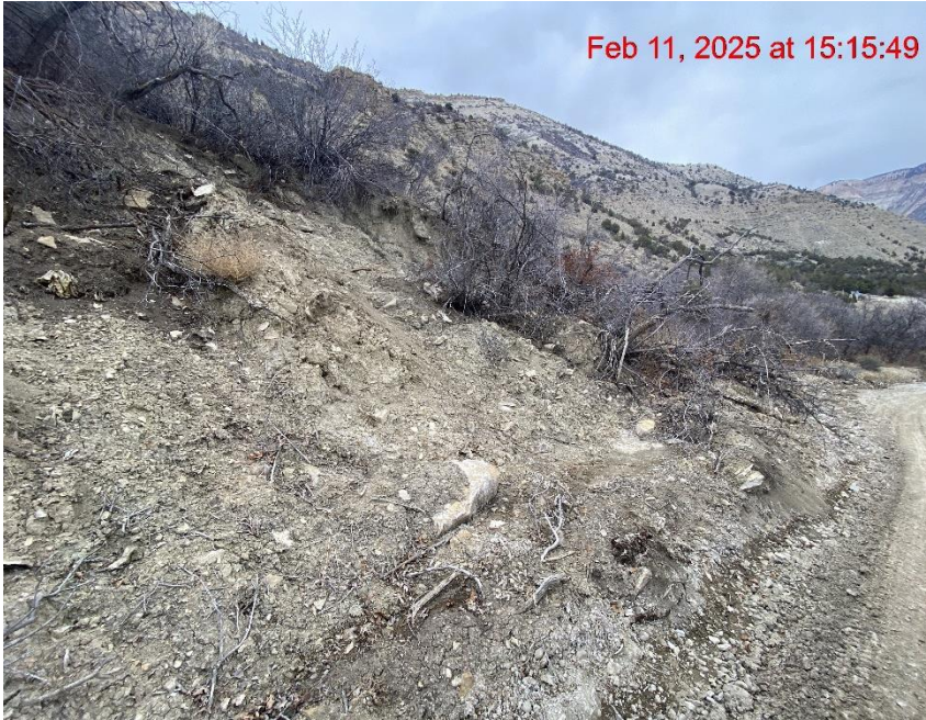
Lease Road Cut Slope Sloughed/No BMPs – Photo #06609