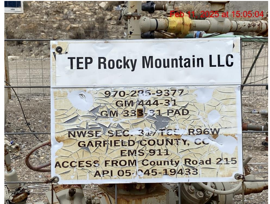
Weathered/Illegible Wellhead Sign – Photo #06588