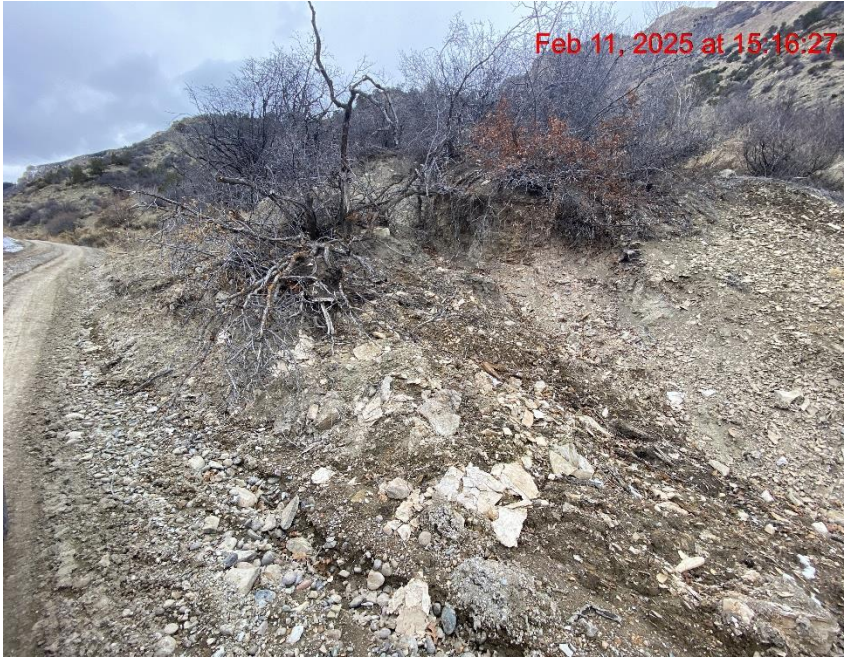
Lease Road Cut Slope Sloughed/No BMPs – Photo #06611