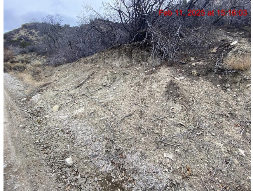
Lease Road Cut Slope Sloughed/No BMPs – Photo #06610