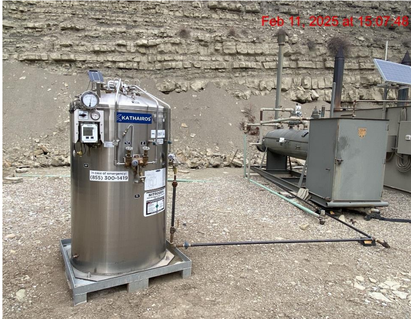
Location – Photo #06592