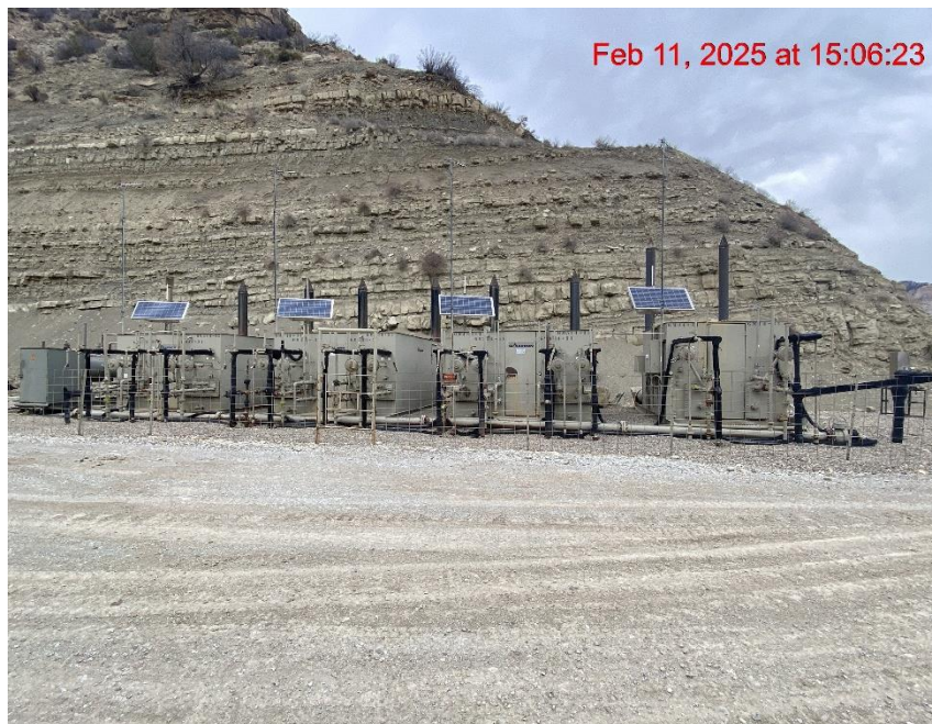
Location – Photo #06590