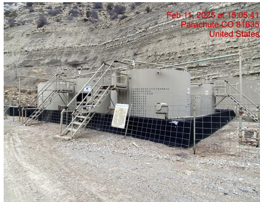
Location – Photo #06589