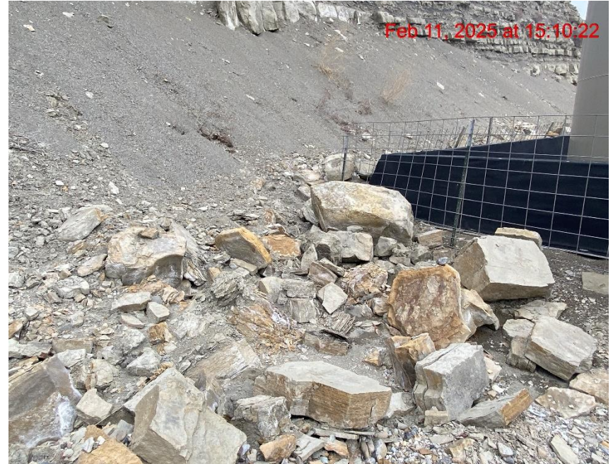
Insufficient Erosion Controls/Site Degradation – Photo #06598