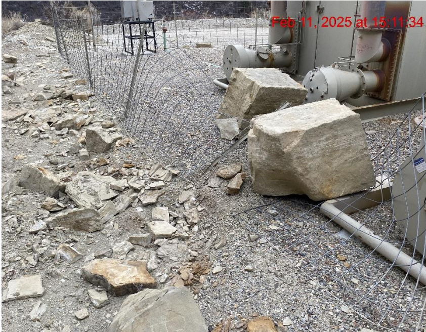
Insufficient Erosion Controls/Site Degradation – Photo #06603