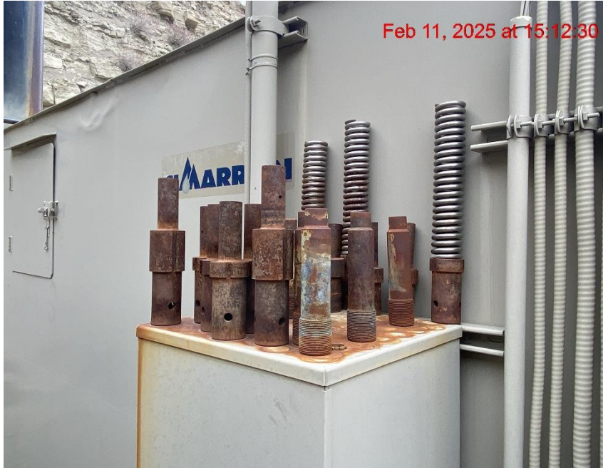
Stored Supplies – Photo #06607