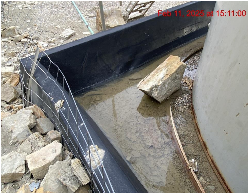
Insufficient Erosion Controls/Site Degradation – Photo #06601