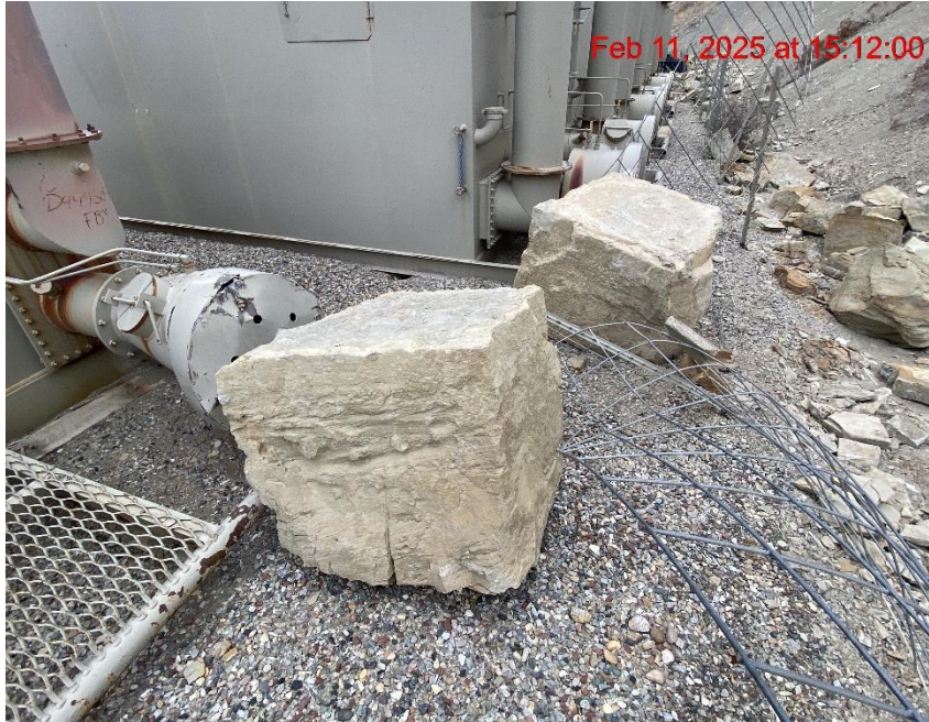
Insufficient Erosion Controls/Site Degradation – Photo #06605