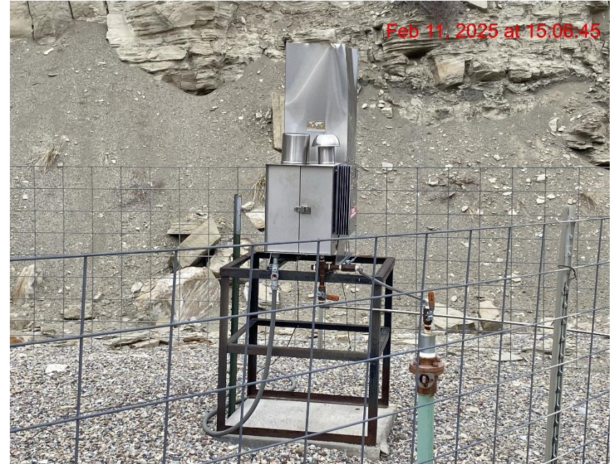
Location – Photo #06591