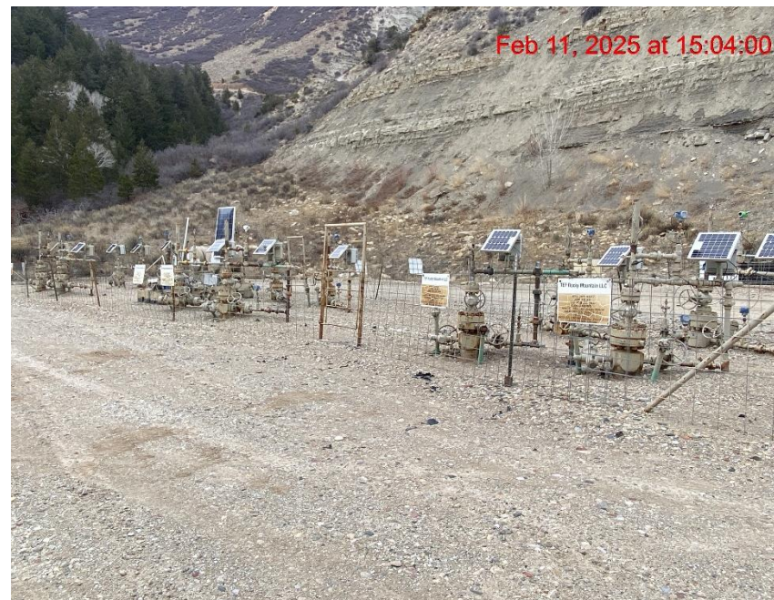
Location – Photo #06586