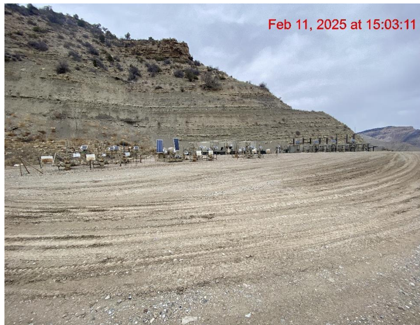
Location Overview – Photo #06585