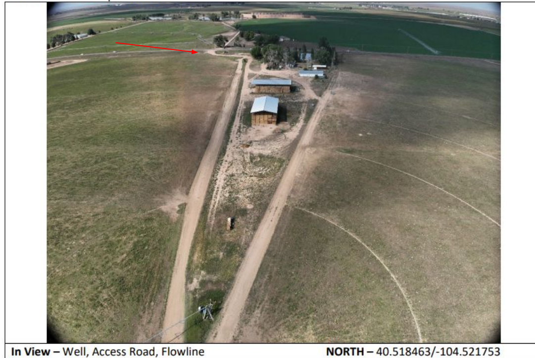
Photo 3. Screenshot from Page 8 of the drone closure report (doc #404067592). No other documentation within the drone closure report illustrates the northern, or start, of the access road, which does not appear to have been reclaimed.

Cardinal directional photos of the site.