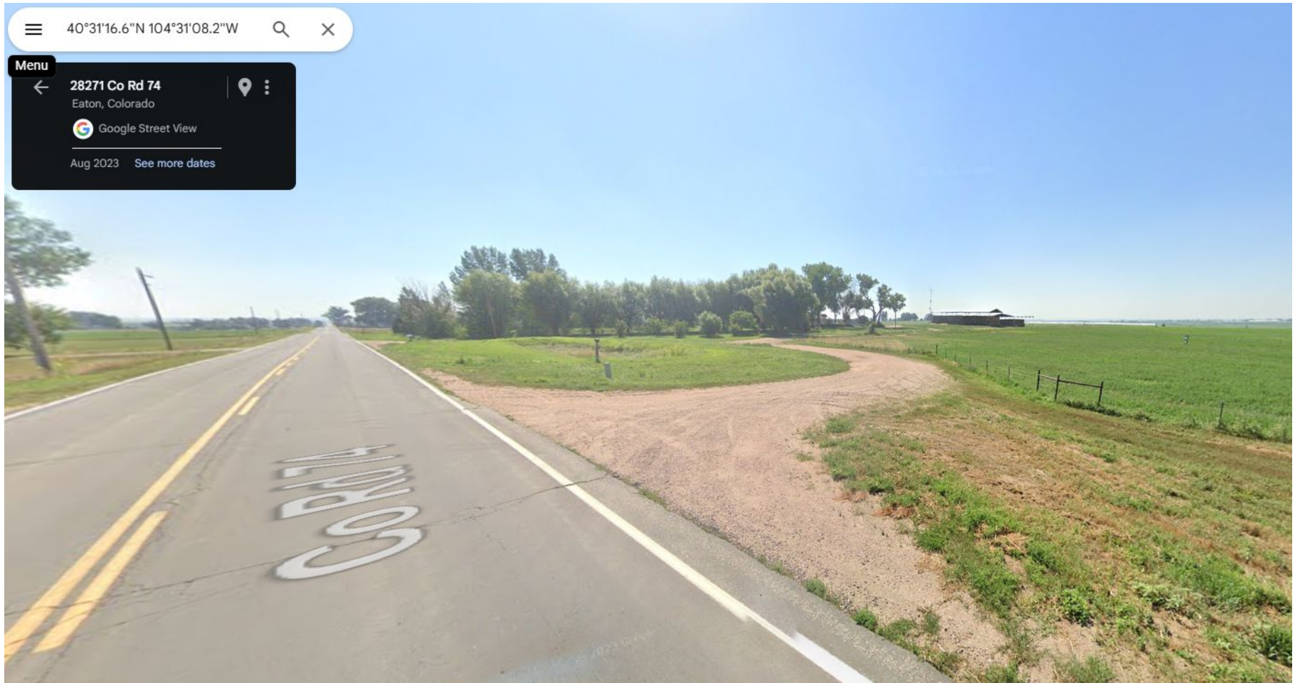
Photo 5. Google Maps imagery (circa 08/2023) illustrating that the access road remains and does not appear to have been reclaimed.