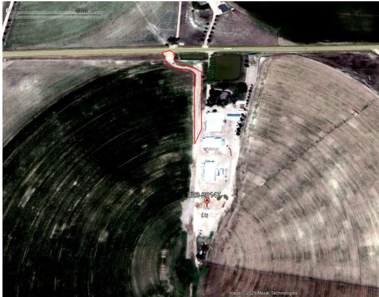
Photo 2. Google Earth aerial imagery (circa 07/2011) illustrating that an access road appears to have been constructed in connection to the subject Well (API 123-28147).