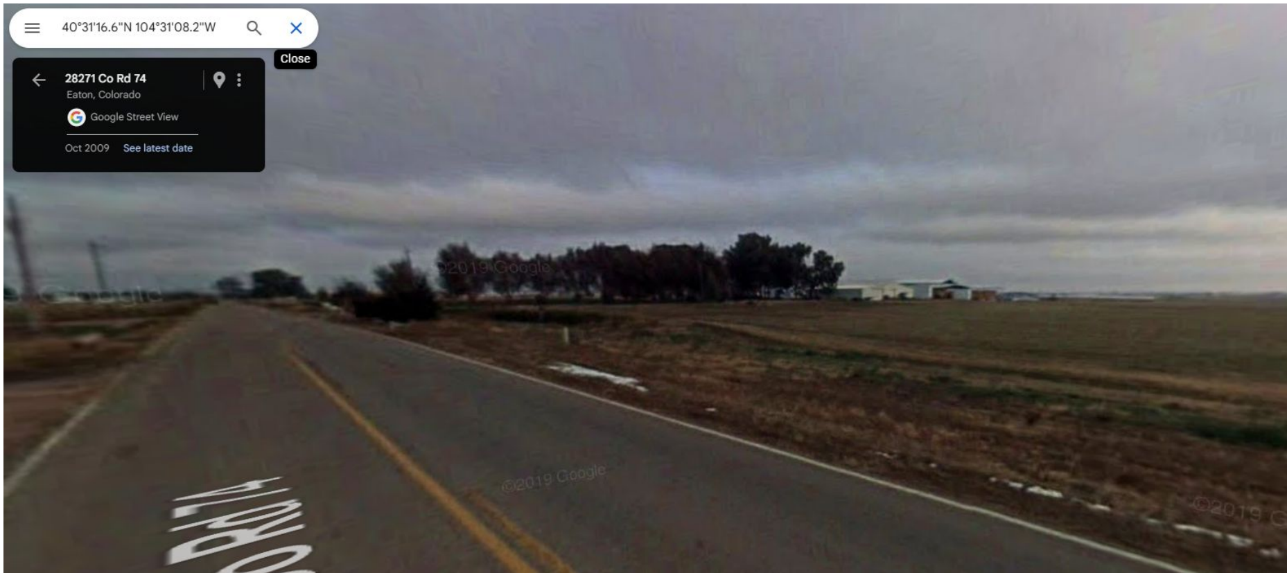
Photo 4. Google Maps imagery (circa 10/2009) illustrating that the access road entrance did not exist prior to oil and gas development.