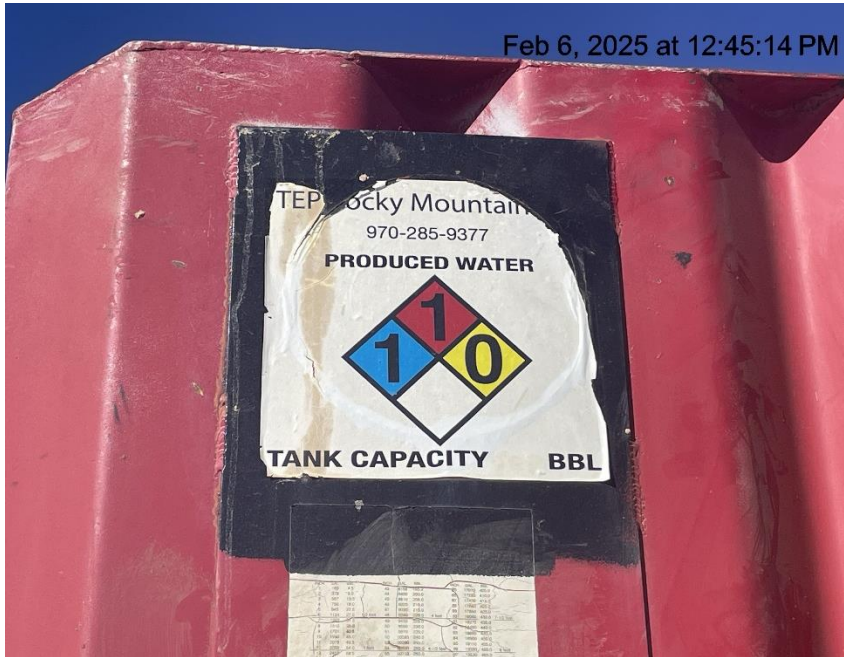
Photo # 4033 Tank label on frac tank damaged & some info is becoming illegible