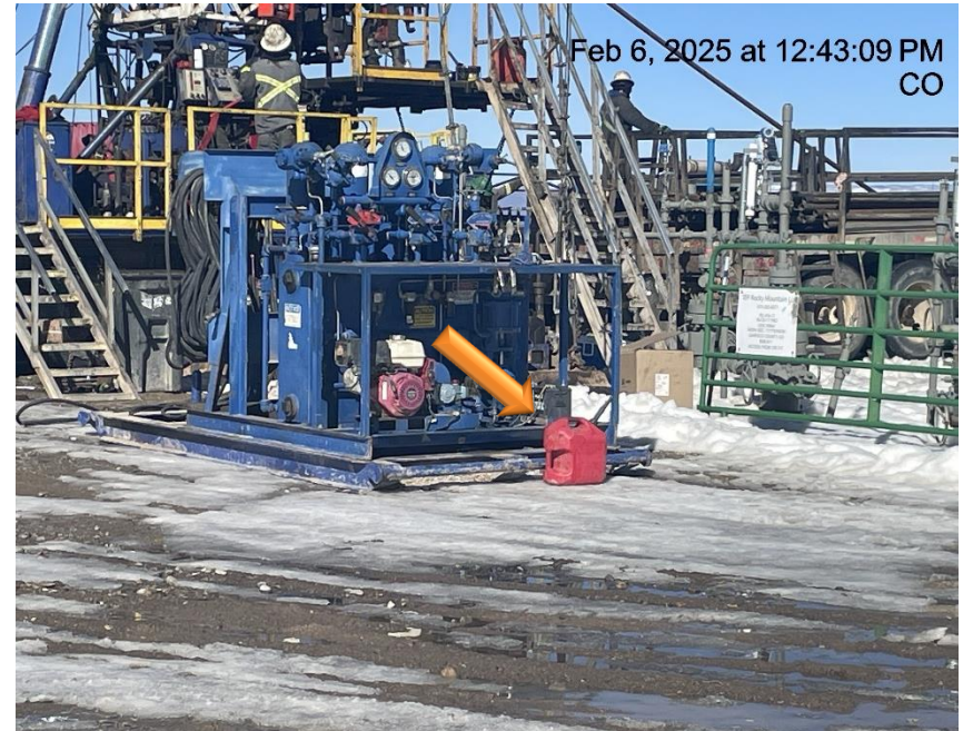
Photo # 4034 Fuel container less than 50 ft from multiple wellheads/not in compliance with CECMC rules