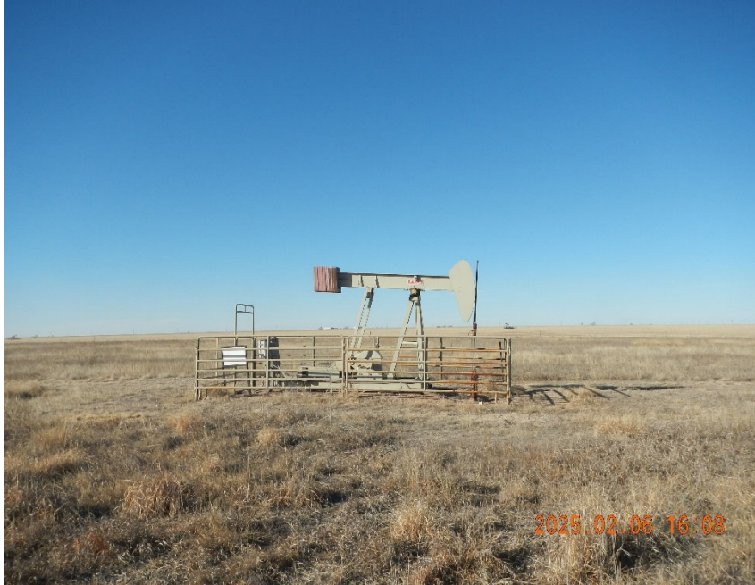
3. Well location overview.