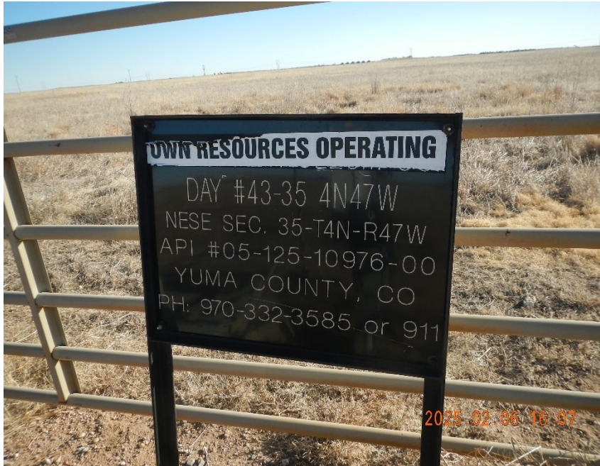
1. Lease sign at well location.