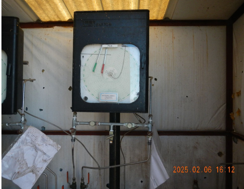
5. Gas meter inside meter shed.