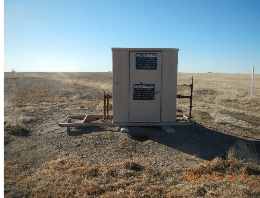
6. Gathering location overview.