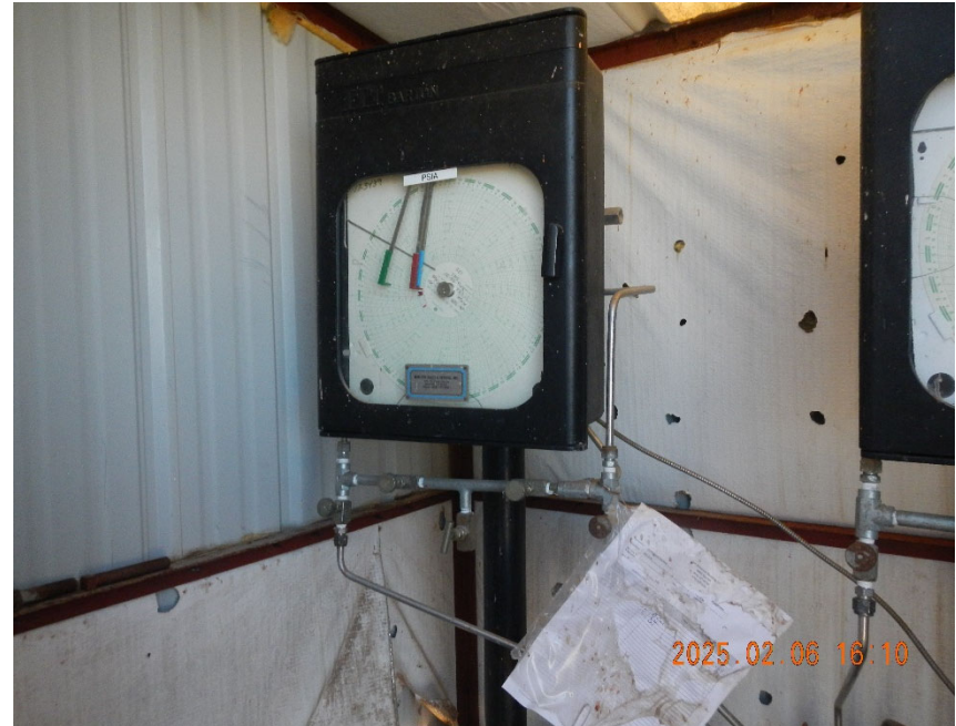
6. Gas meter inside meter shed.