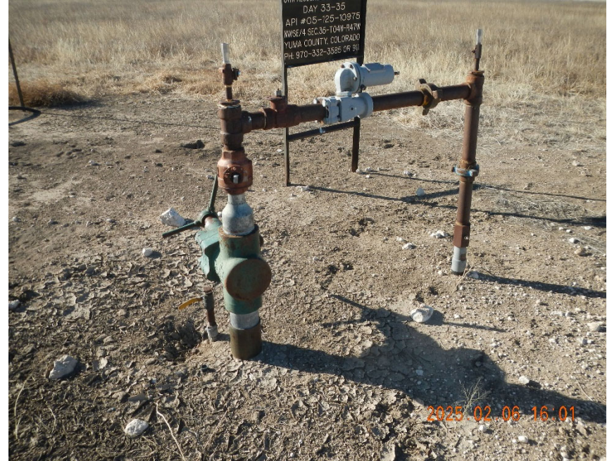
2. View of wellhead.