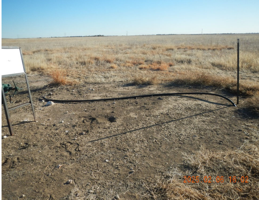
3. View of stubbed up electrical line inside black poly line.