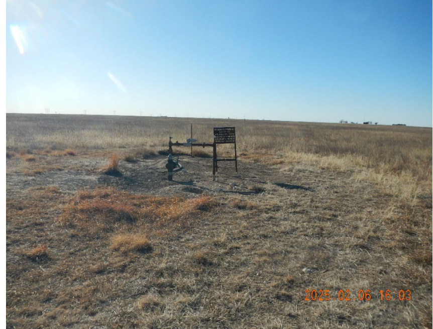
4. Well location overview.