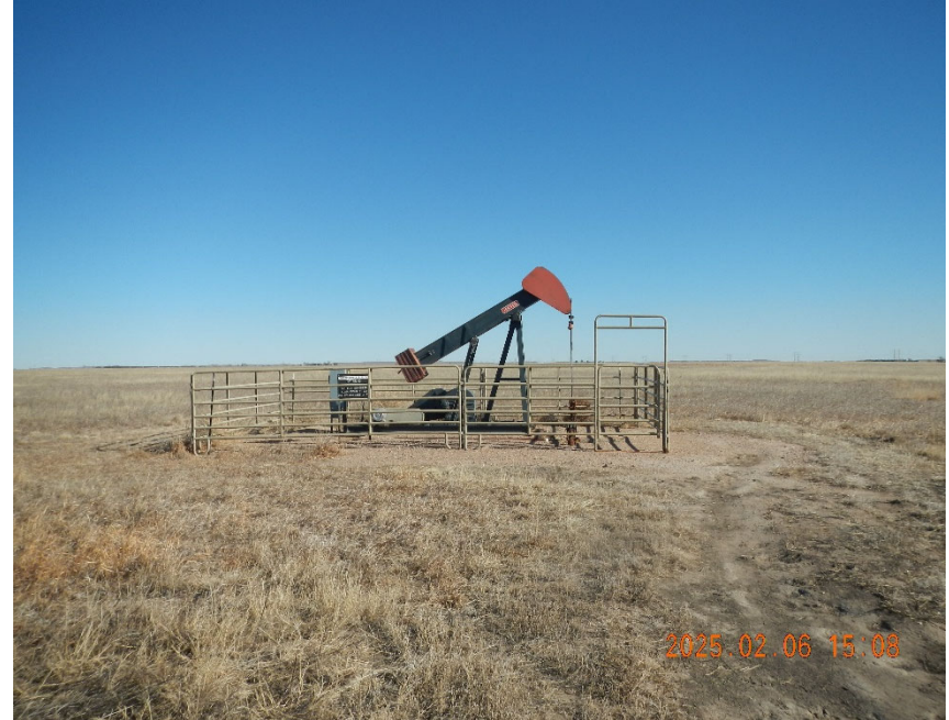
4. Well location overview.