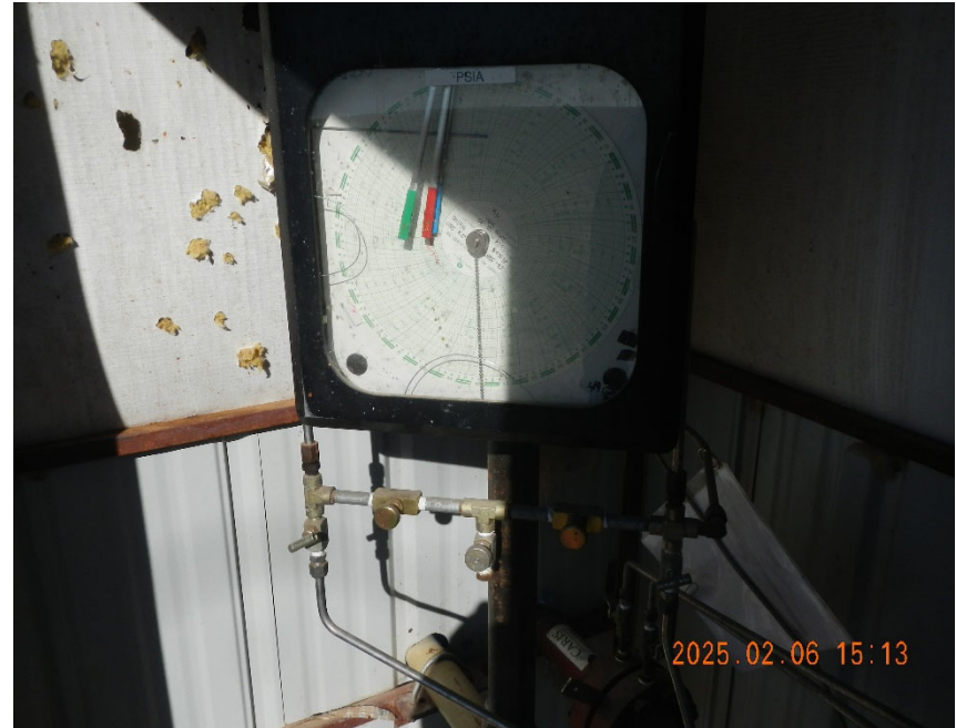
6. Gas meter inside meter shed.