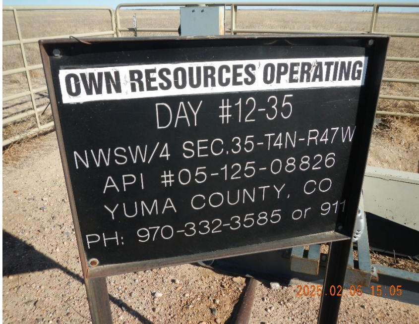
1. Lease sign at well location.