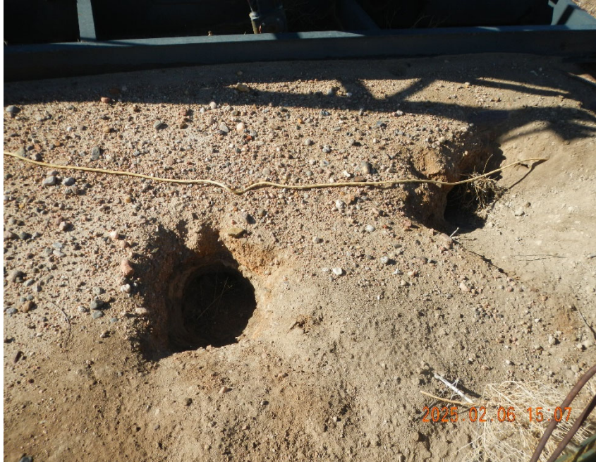
3. Burrows inside wellhead fencing.