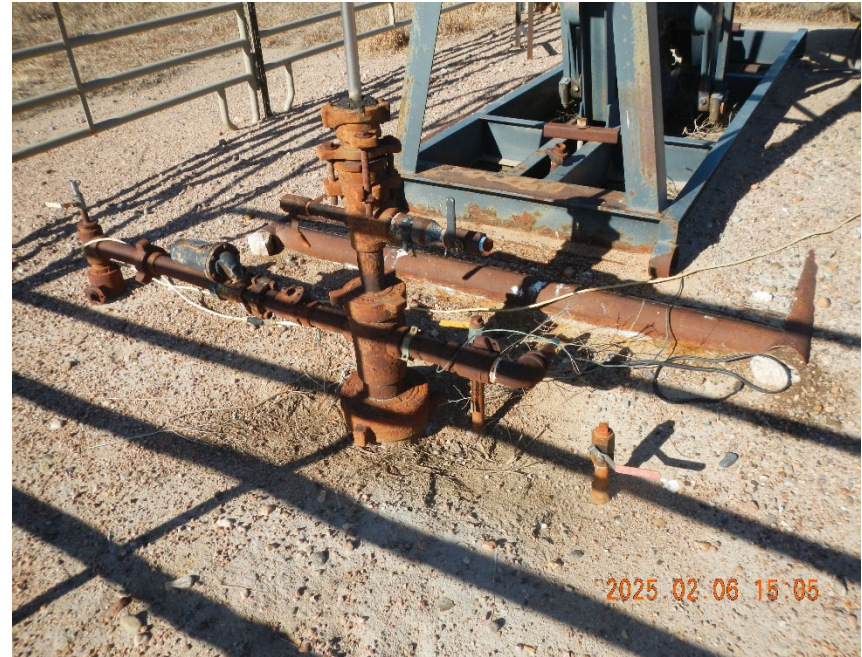
2. View of wellhead.