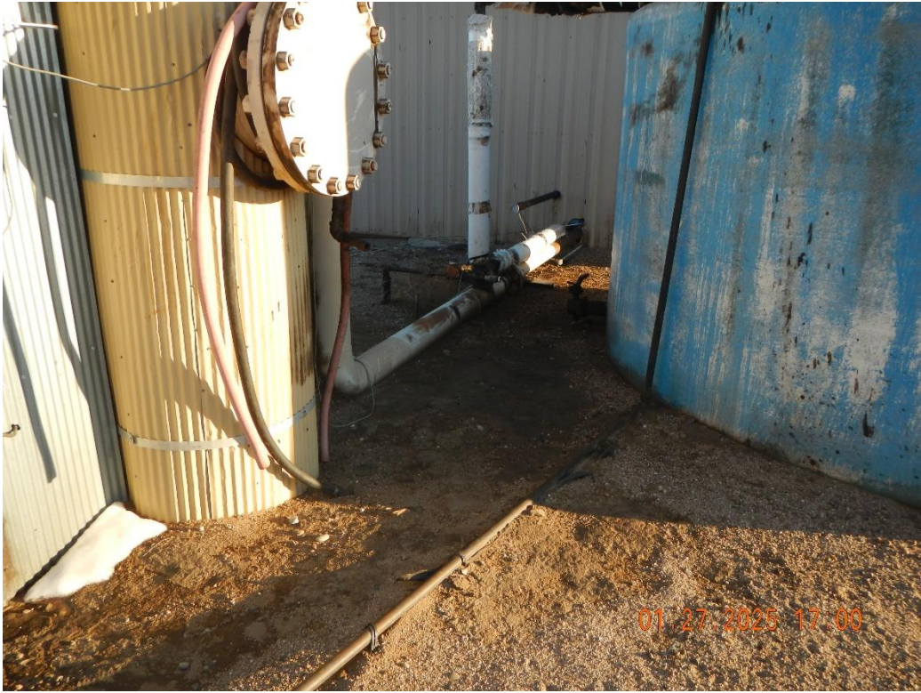
Stained ground. No berming around tank.