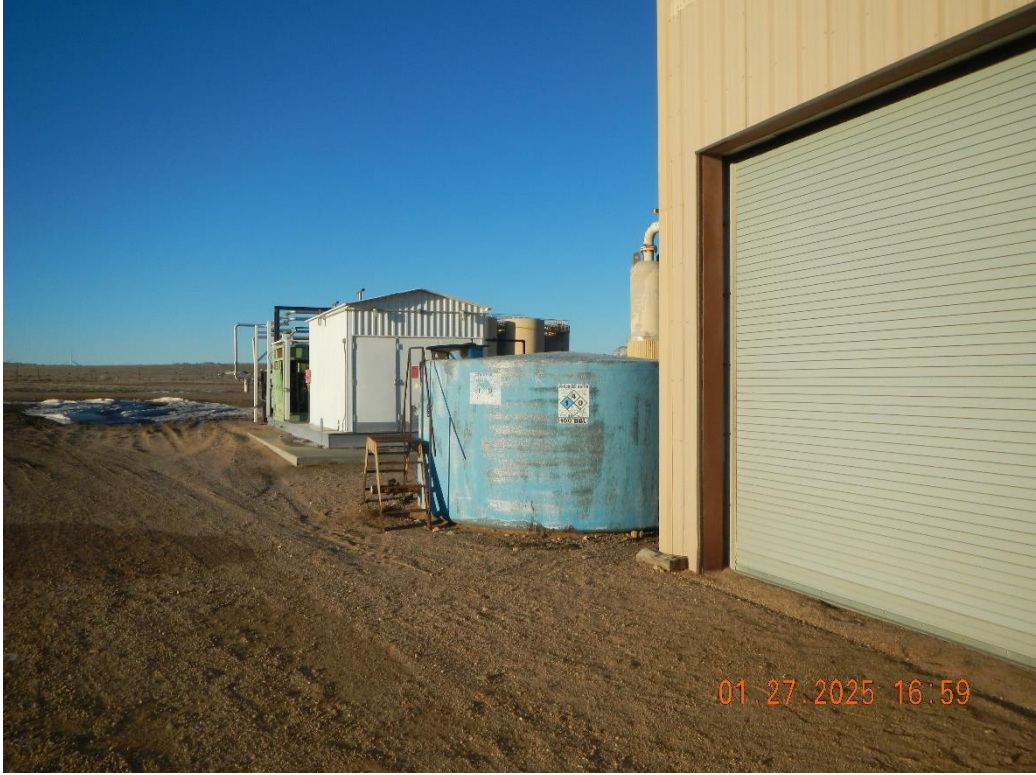
Stained ground. No berming around tank.