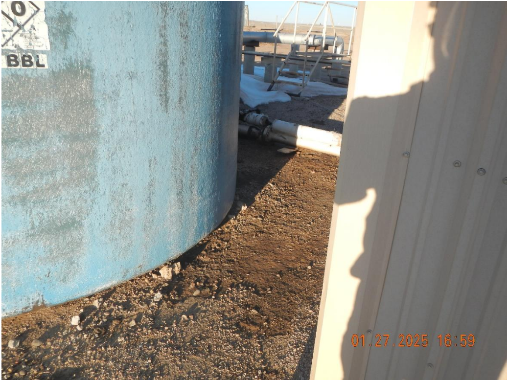
Stained ground. No berming around tank.