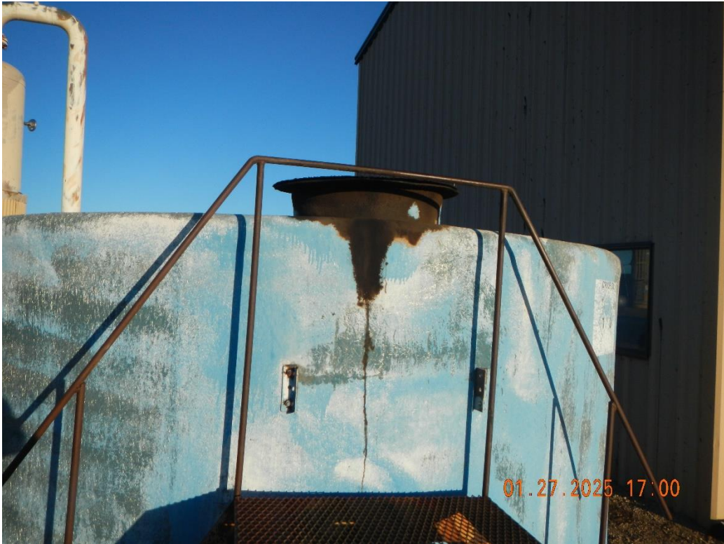
Oil over flown.