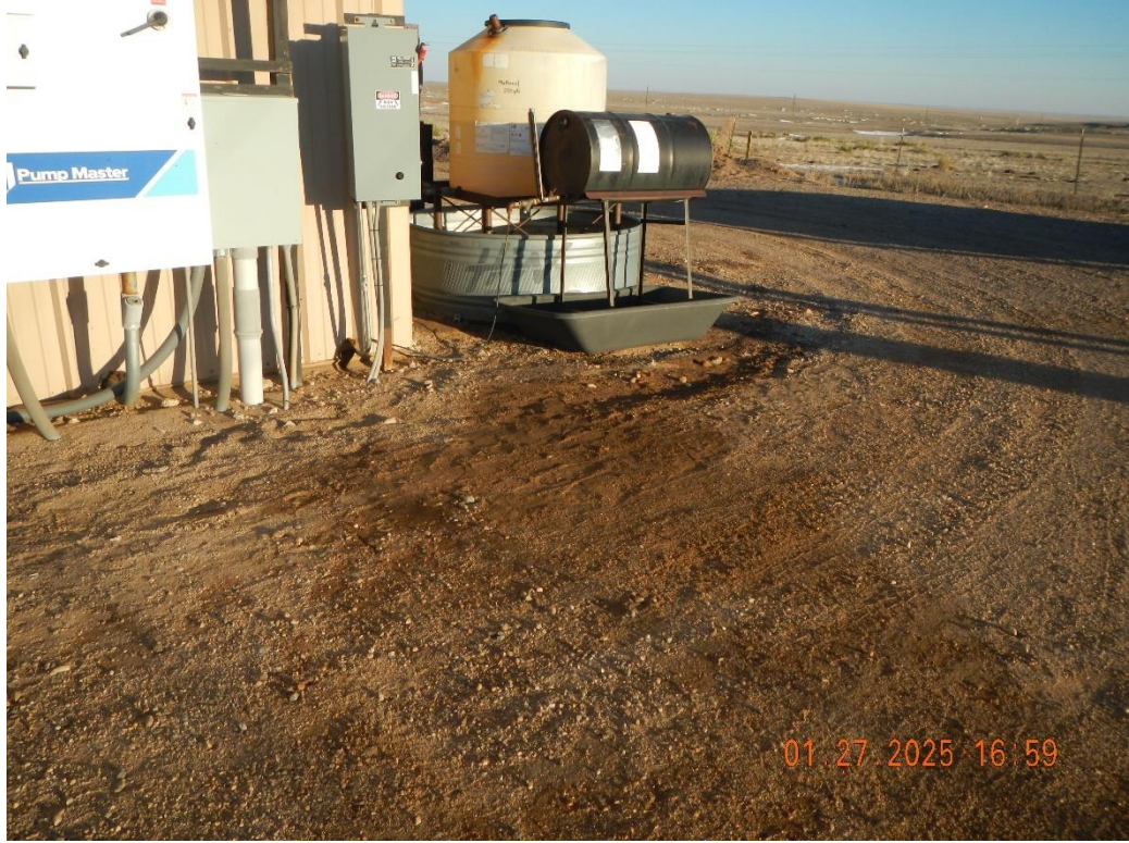
Stained ground around containers.