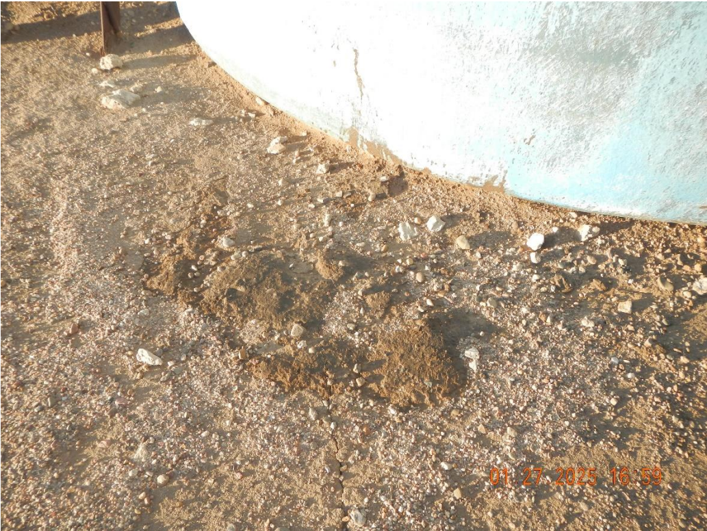
Stained ground. No berming around tank.