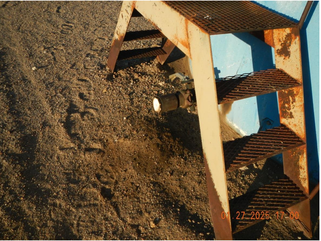
Stained ground. No berming around tank.