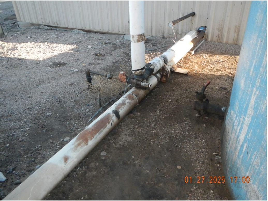
Stained ground. No berming around tank.