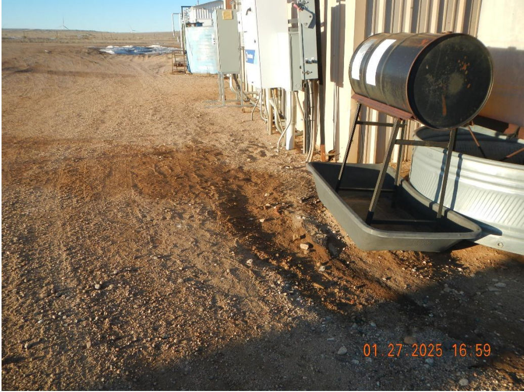
Stained ground around containers.