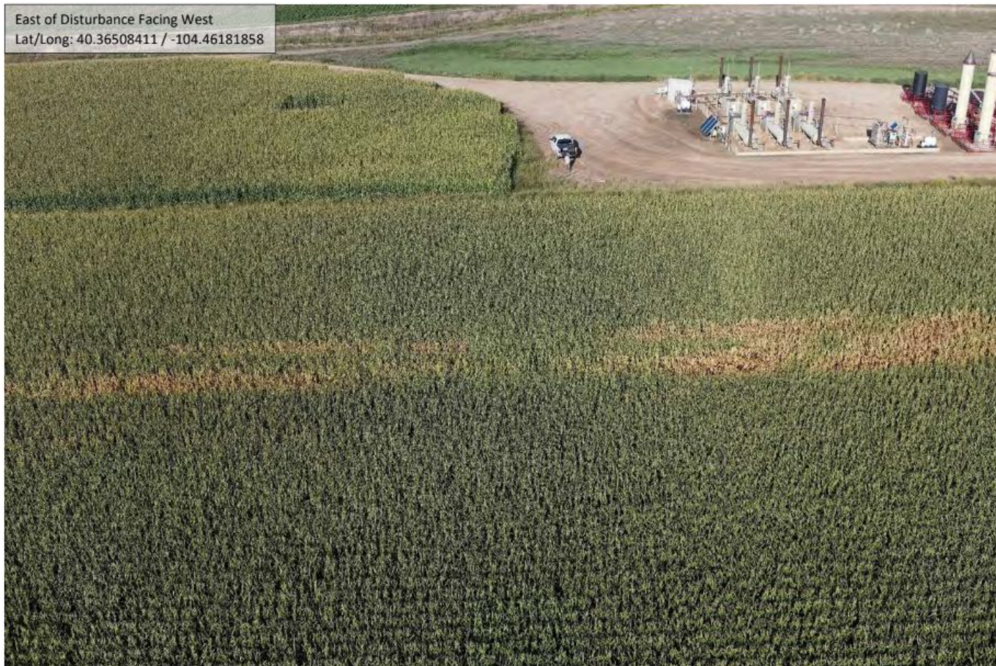
Photo 5. Screenshot taken from Page 17 of the drone closure report illustrating impacted crops north and south of the subject well; presumed flowline path (right) and former access road (left) in view.