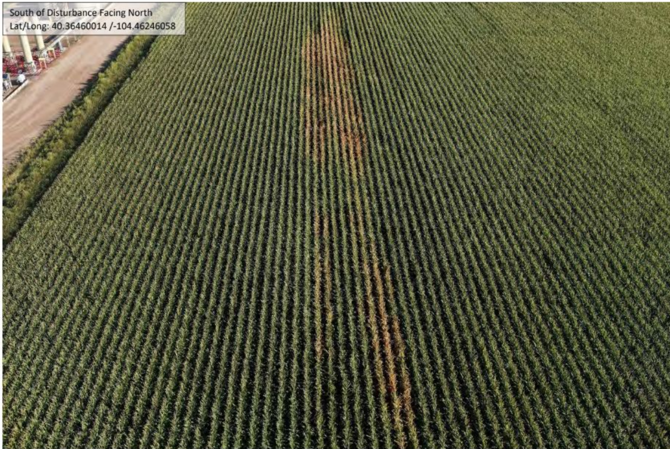
Photo 2. Screenshot taken from Page 14 of the drone closure report illustrating impacted crops north of the subject well location, along the presumed flowline path.