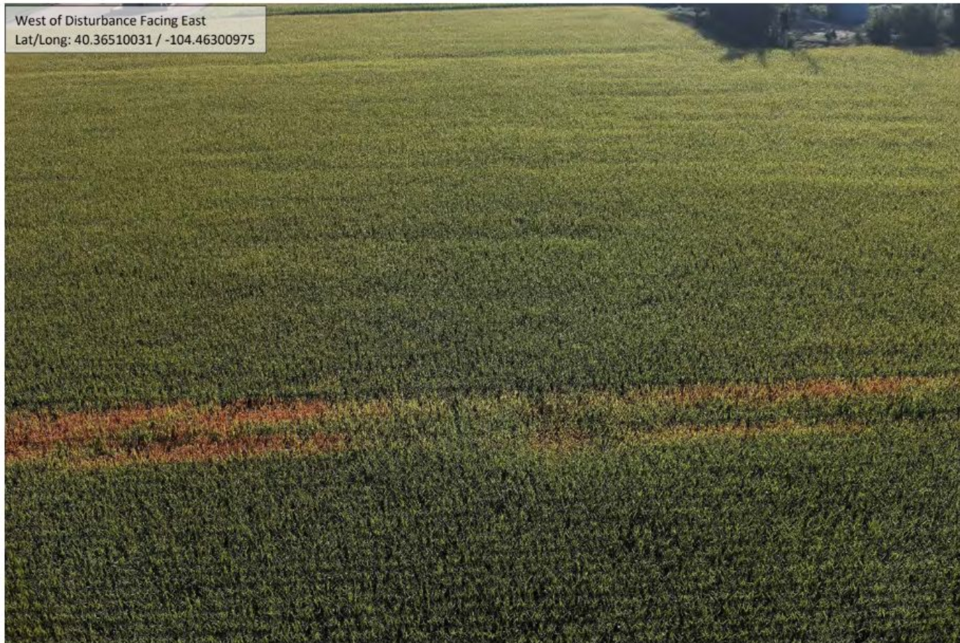
Photo 4. Screenshot taken from Page 16 of the drone closure report illustrating impacted crops north and south of the subject well; presumed flowline path (left) and former access road (right) in view.