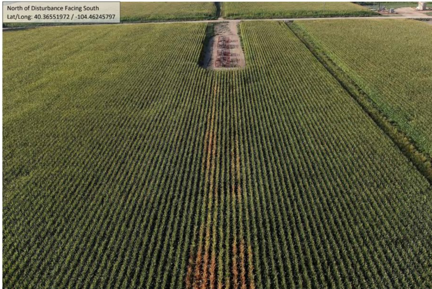
Photo 3. Screenshot taken from Page 15 of the drone closure report illustrating impacted crops south of the subject well location, along the former access road.