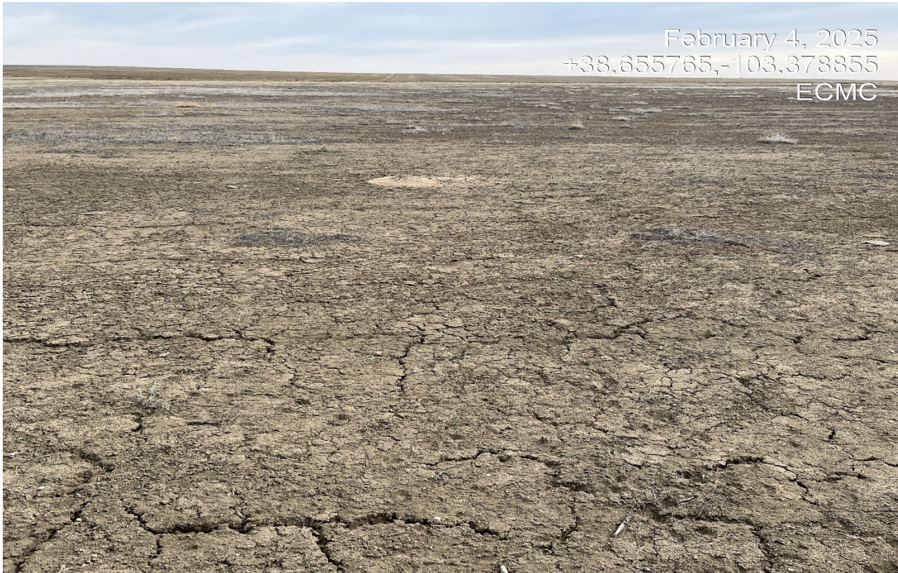
Photo 5. West side of the location facing east.