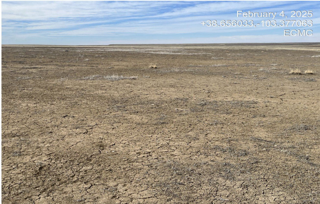
Photo 3. Facing west toward the location. Perennial vegetation has not established and the location needs to be reseeded.