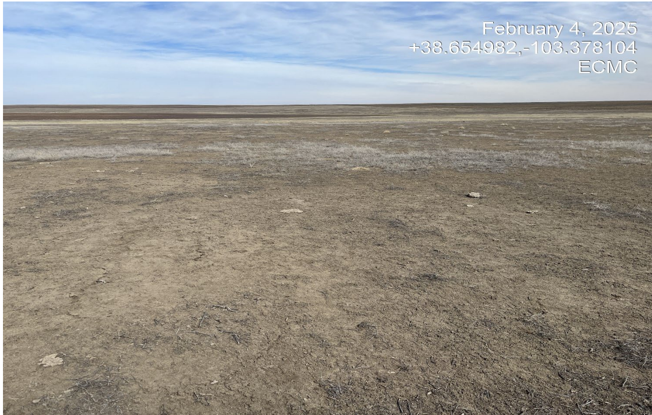
Photo 6. South side of the location facing north.