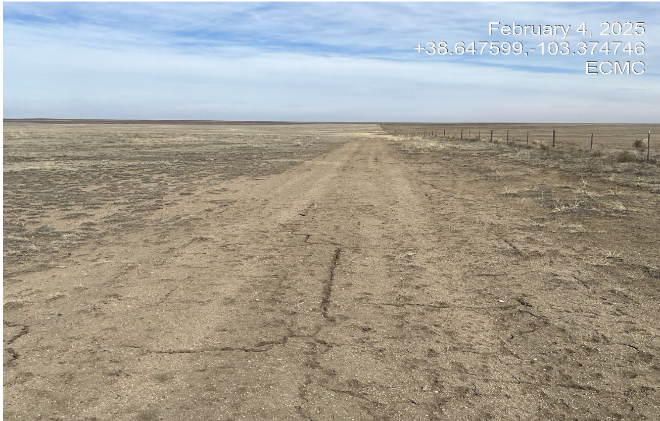
Photo 1. Facing north along the access road. The former access road has not established perennial vegetation and needs to be reseeded.