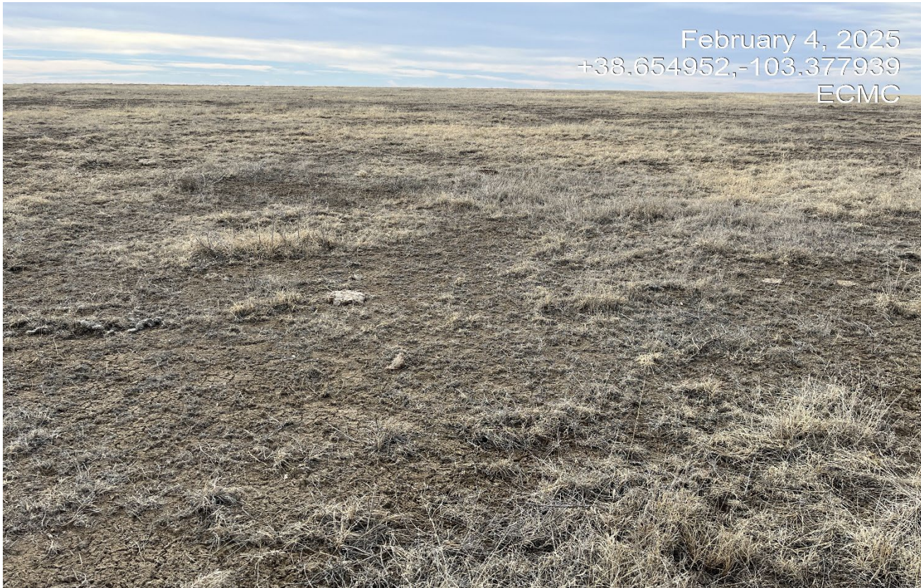
Photo 7. Facing north toward the reference area which consists of native Blue grama dominate grassland.