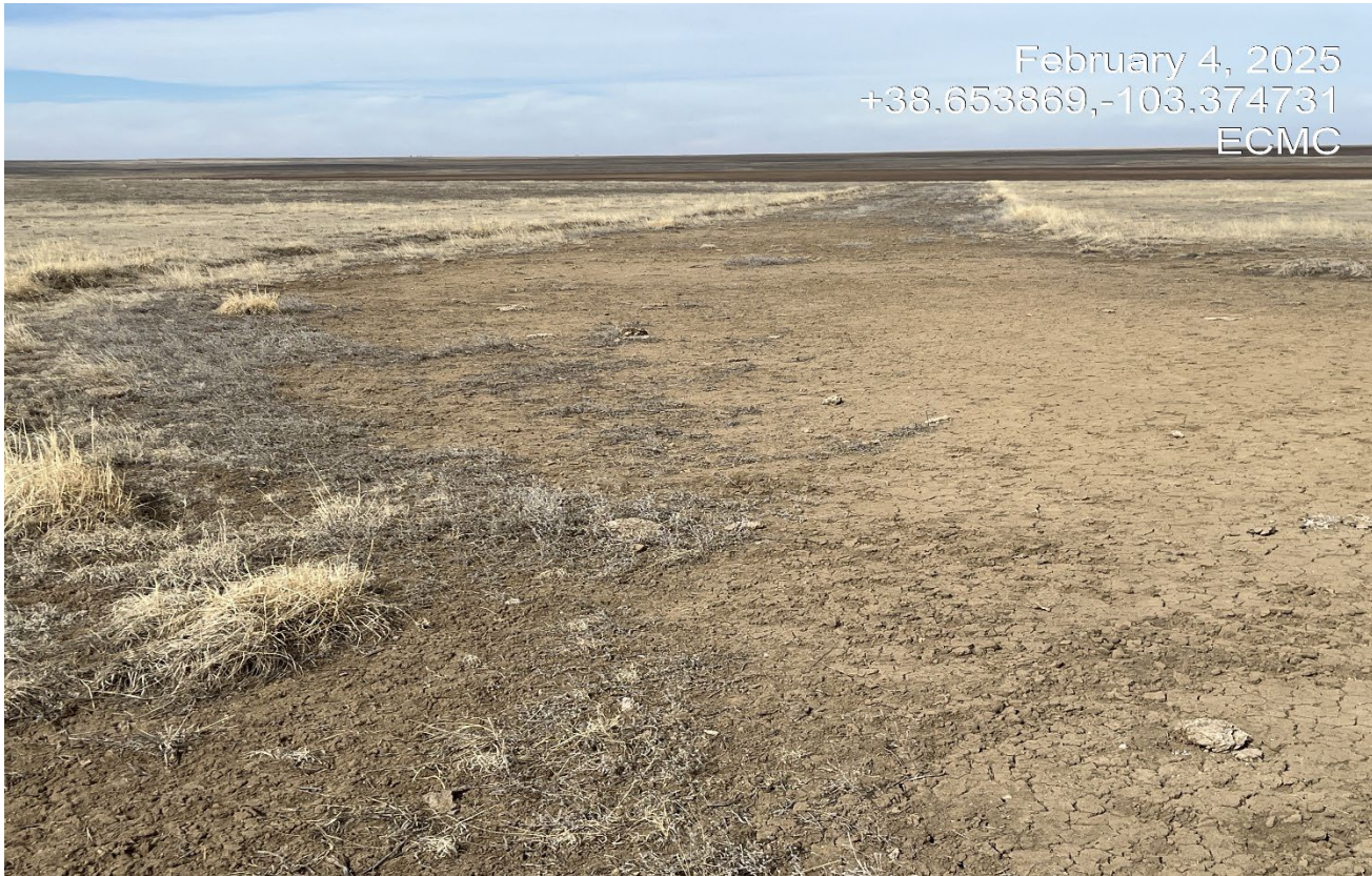
Photo 2. Facing northwest along the access road. The former access road has not established perennial vegetation and needs to be reseeded.