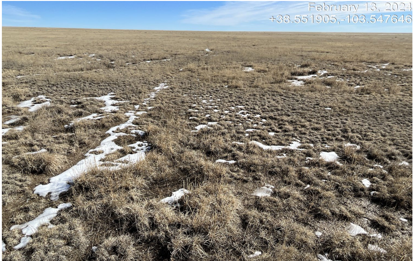
Photo 6. Facing east toward the surrounding undisturbed pasture.