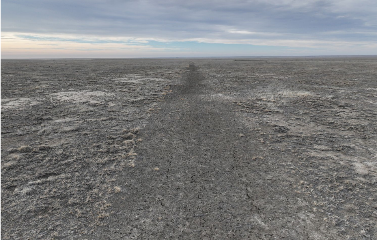
Photo 2. Drone aerial photo facing south along the access road. The former access road has not established perennial vegetation and needs to be reseeded.