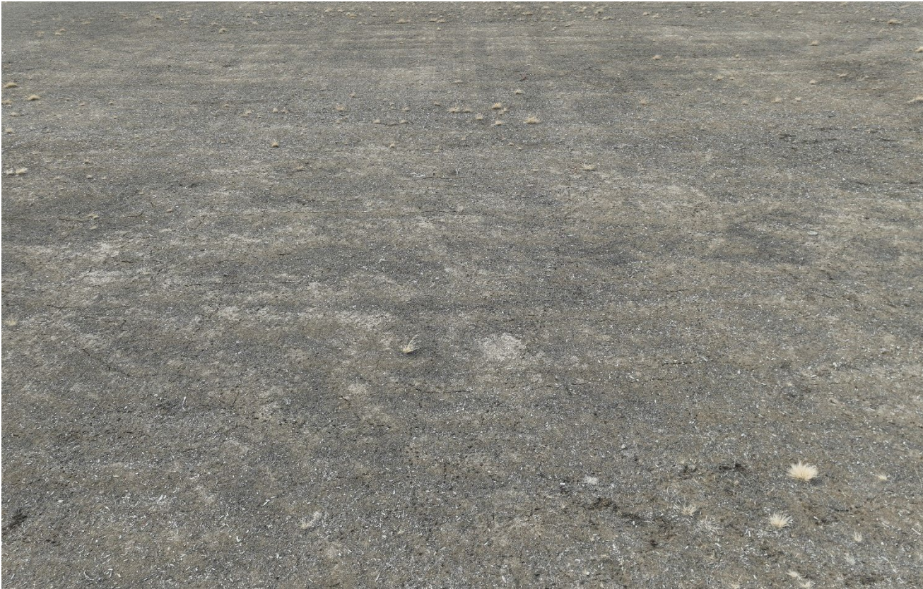
Photo 3. Facing down toward the ground cover shows almost entirely bare soils. Additional reseeding needs to be performed.