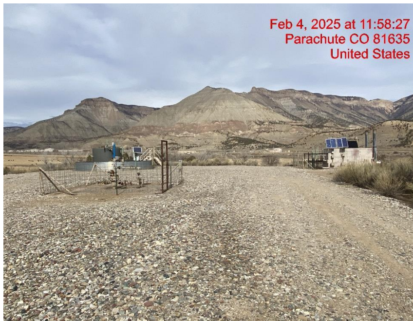
Location Overview – Photo #06424