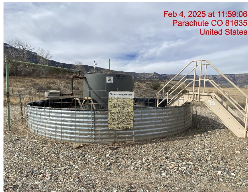
Location – Photo #06426