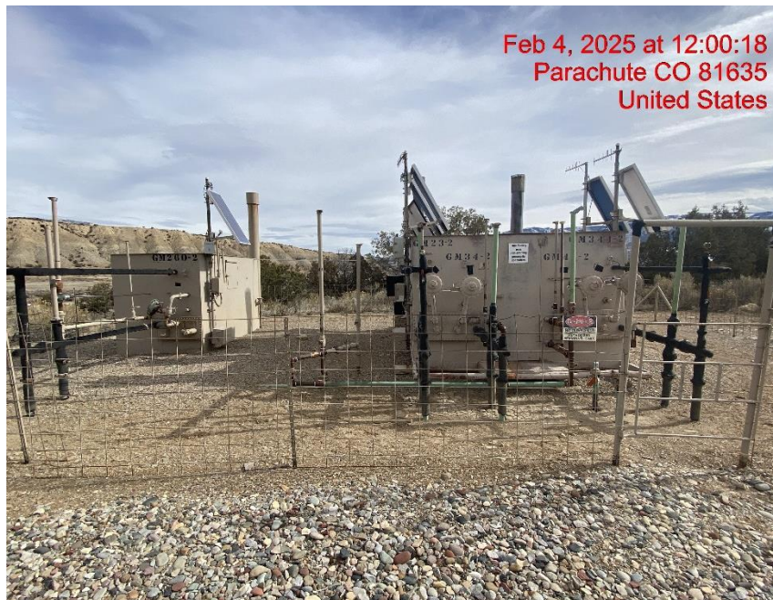
Location – Photo #06428