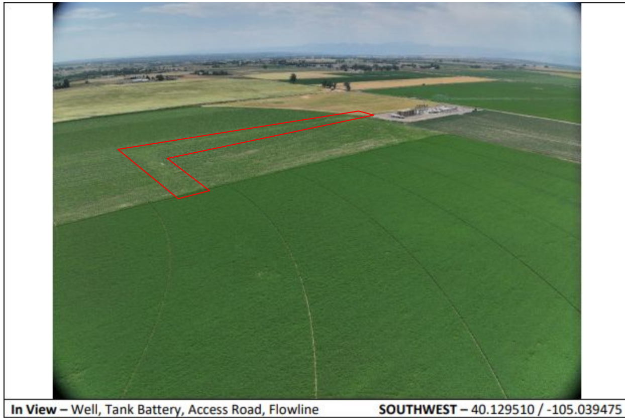
Photo 3. Drone aerial imagery taken from the drone documentation; Page 13, doc #403942075. It is unclear what crop and at what growth stage the access road is planted to. Red outline (drawn by ECMC staff) illustrates the presumed access road that requires additional documentation.