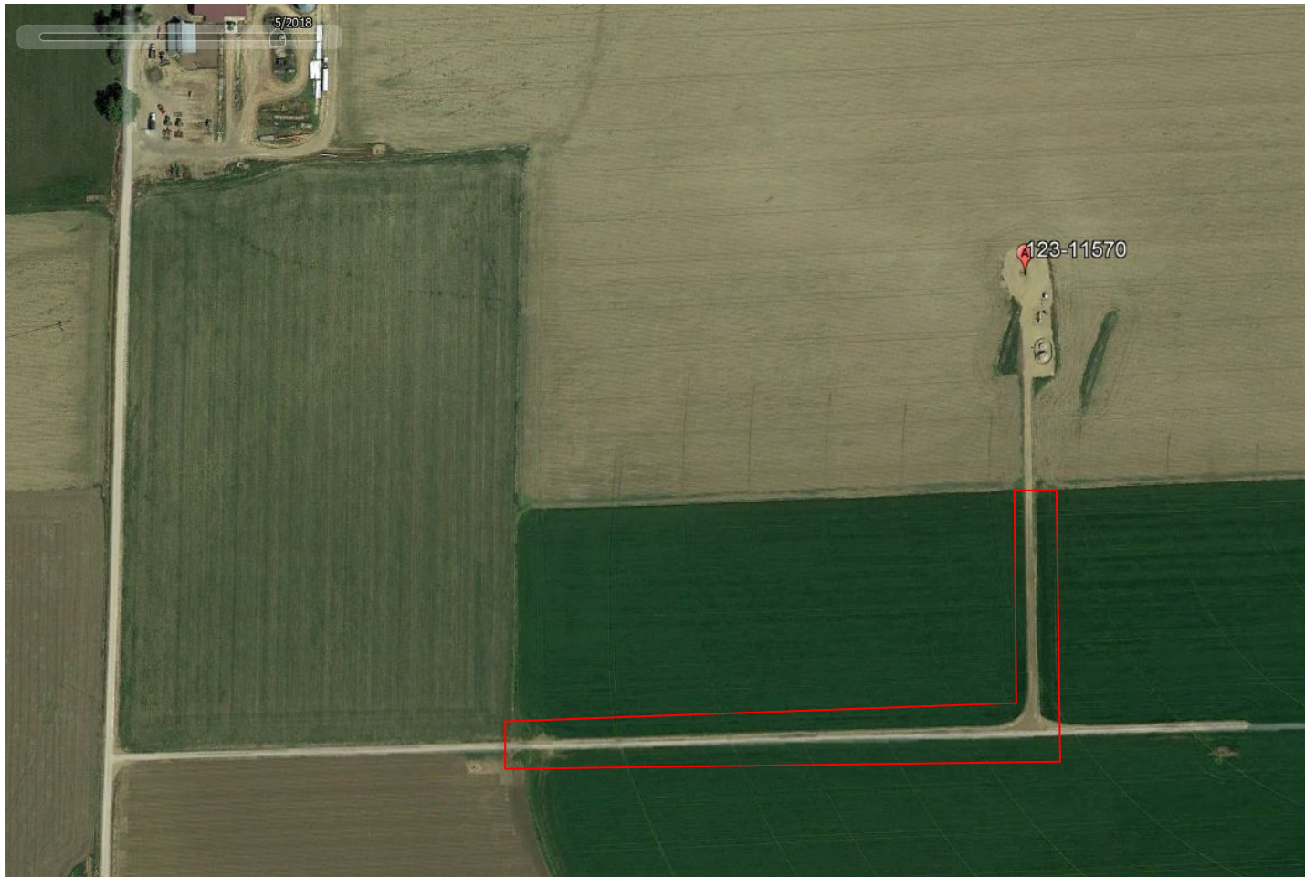
Photo 2. Google Earth aerial imagery (circa 05/2018) illustrating portions of the access road that require additional documentation for the next drone submission.