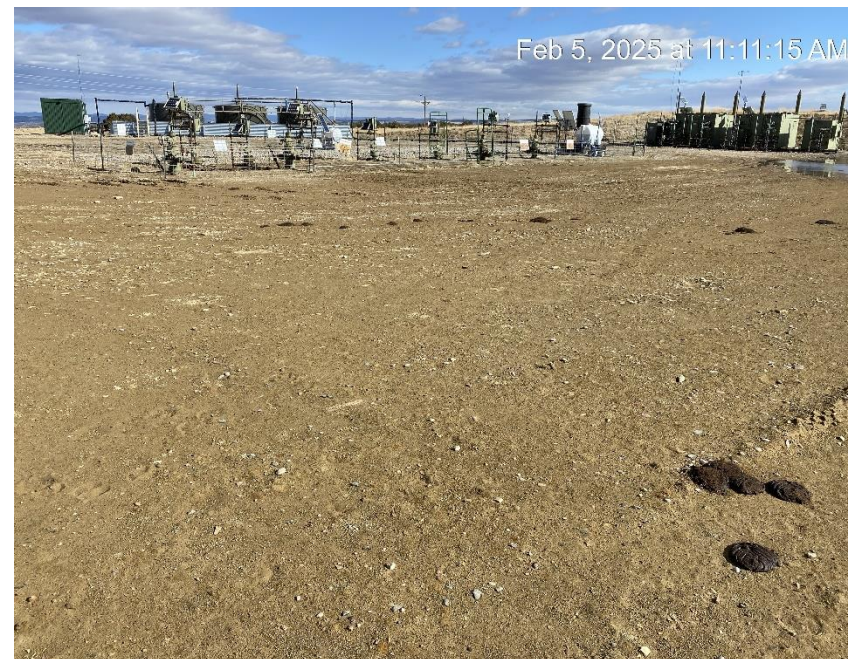
Location from Southwest corner