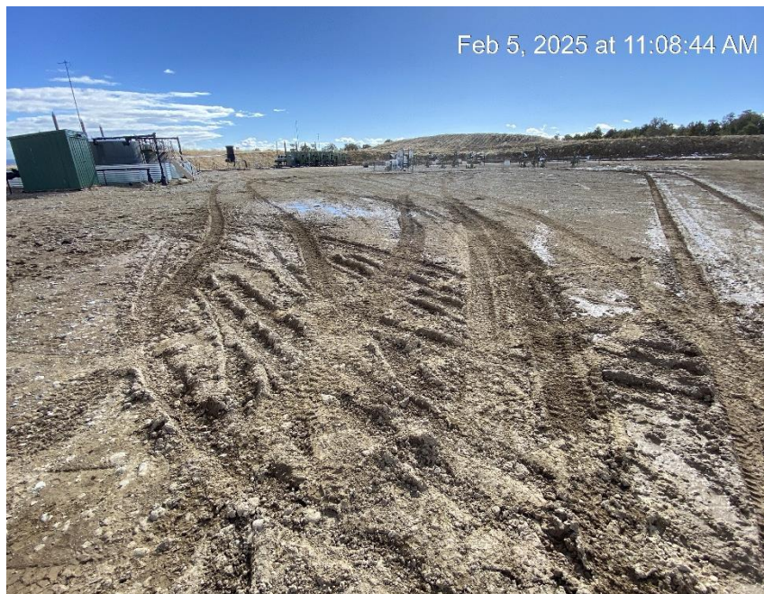
Location from North entrance