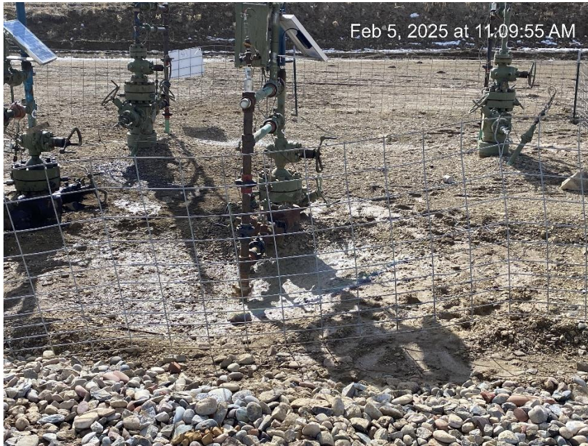
No well sign displayed