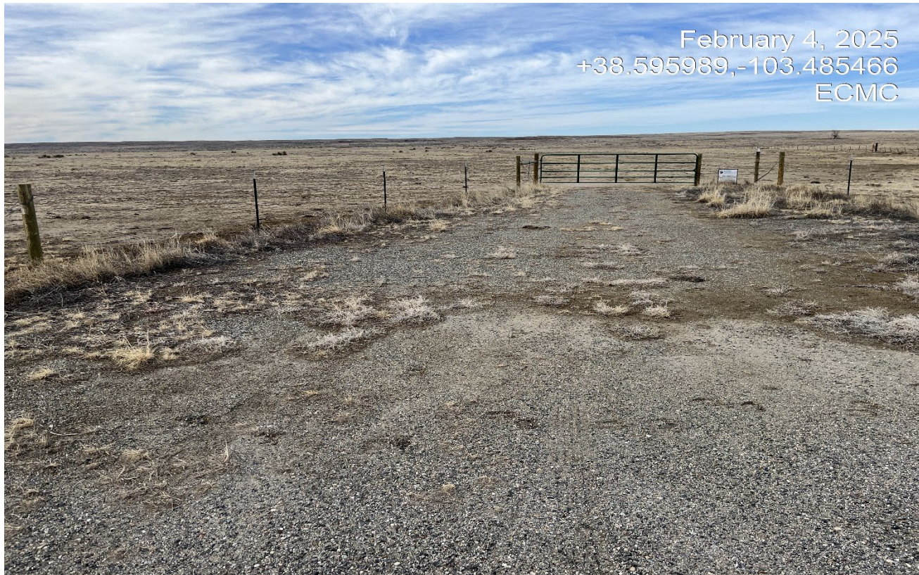
Photo 1. Facing west at the access road off the county road. The fence needs to be reinstalled back to the original position. The gravel needs to be removed and road reclaimed.