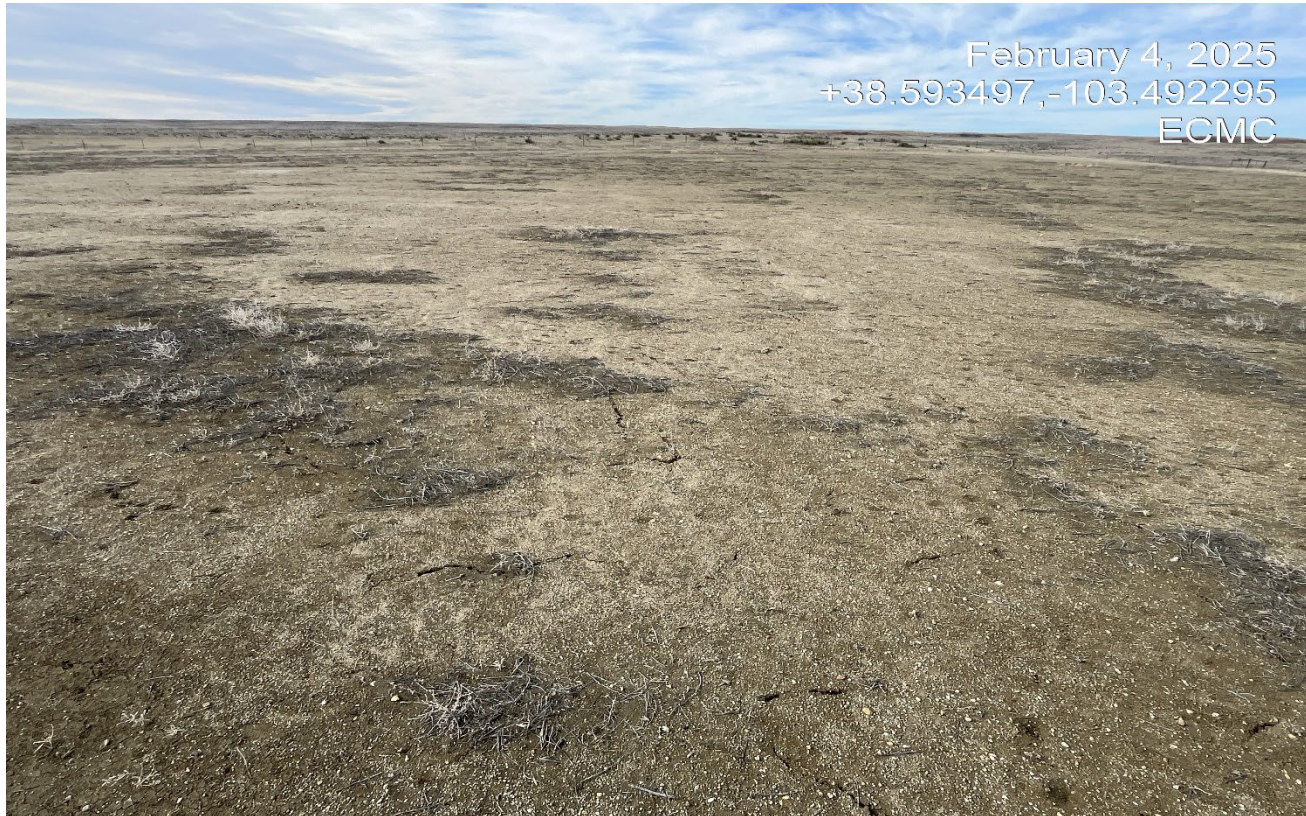
Photo 4. Facing west at the center of the location. The location has not established perennial vegetation and needs to be reseeded.