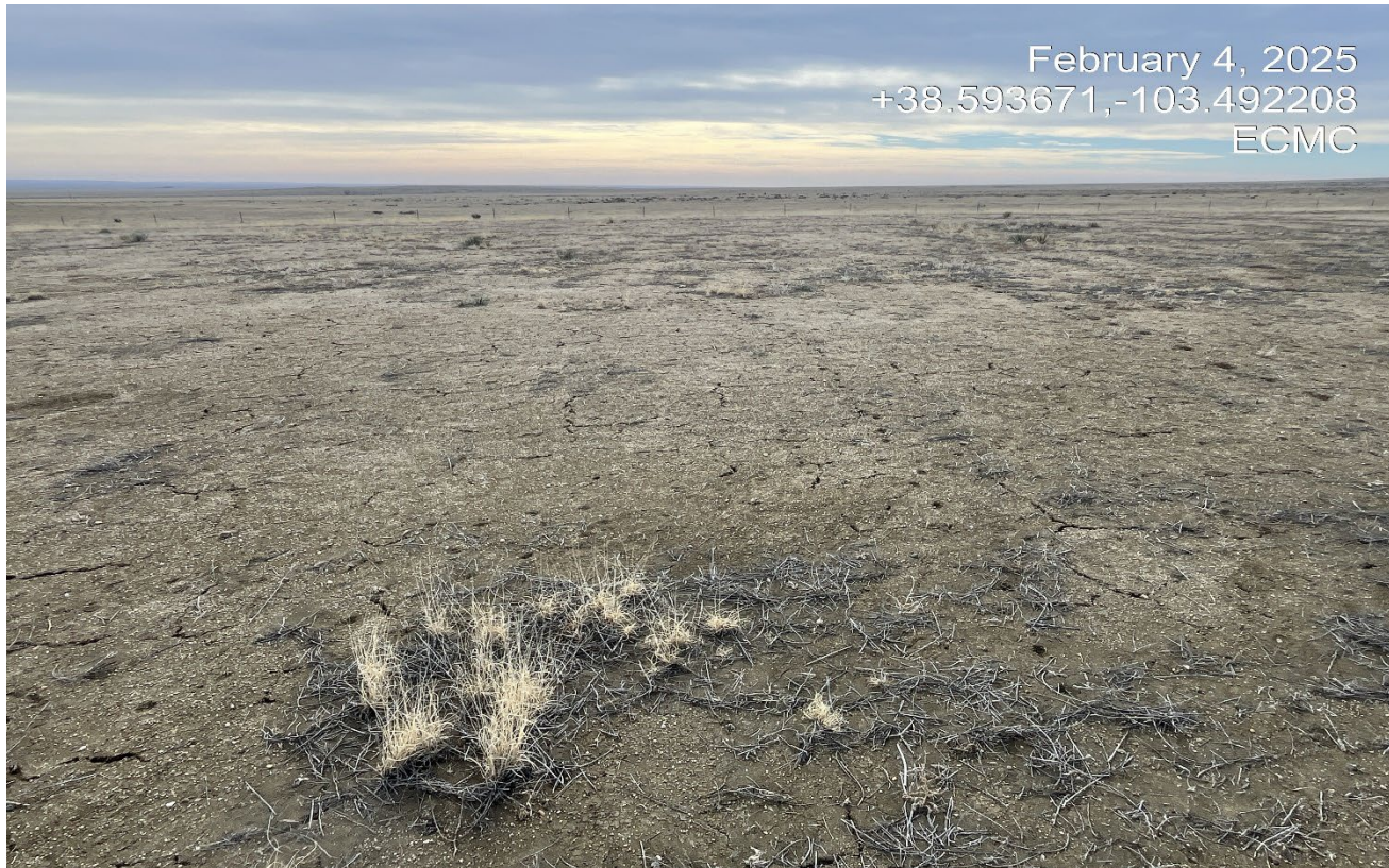
Photo 6. Facing south at the center of the location.