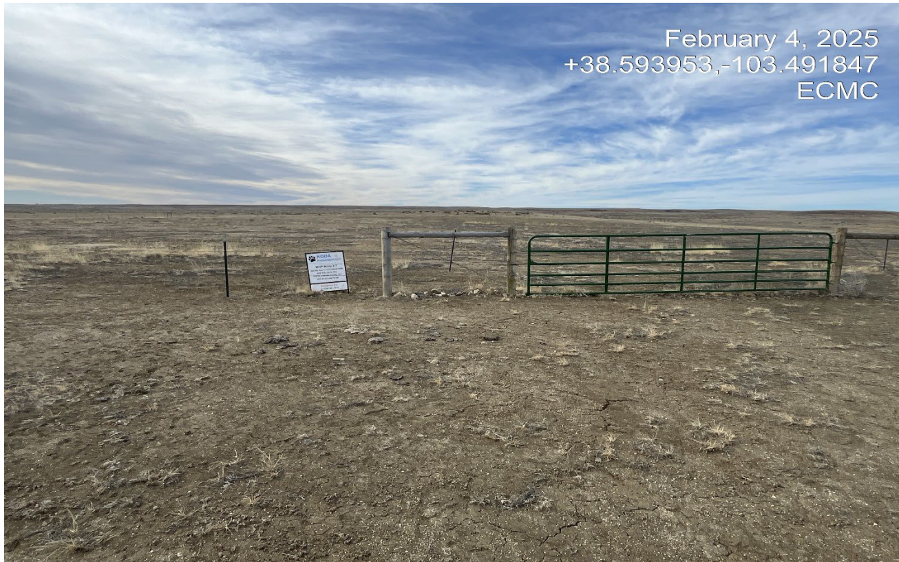
Photo 3. Facing west toward the location which is fenced off.