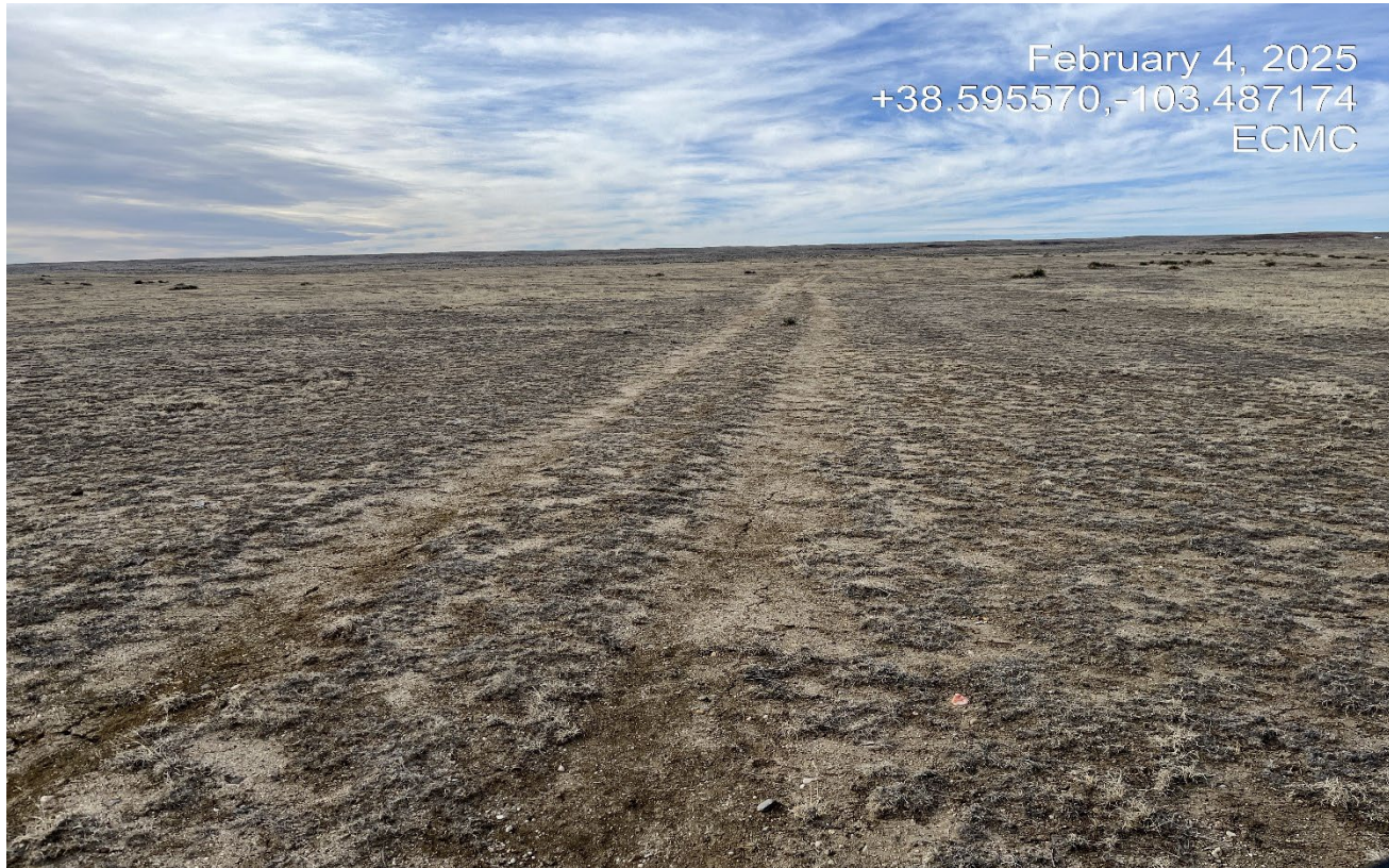
Photo 2. Facing along the former access road. It appears native vegetation started to grow back along the two track.