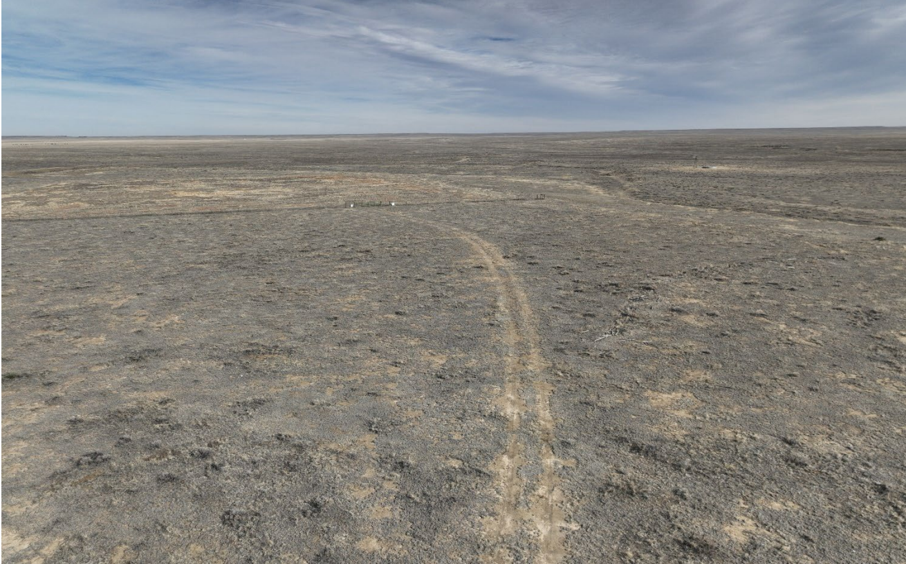
Photo 4. Drone aerial photo facing northeast along the former access road.