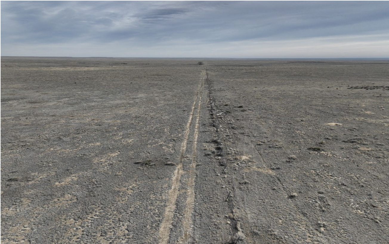
Photo 3. Drone aerial photo facing east along the former access road. The two track road further along appears to be in use and not reclaimed.