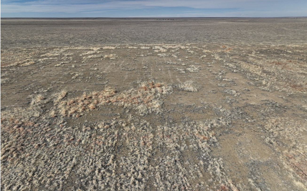
Photo 7. Drone aerial photo facing west at the location. There are areas that should be seeded to promote more vegetation growth.