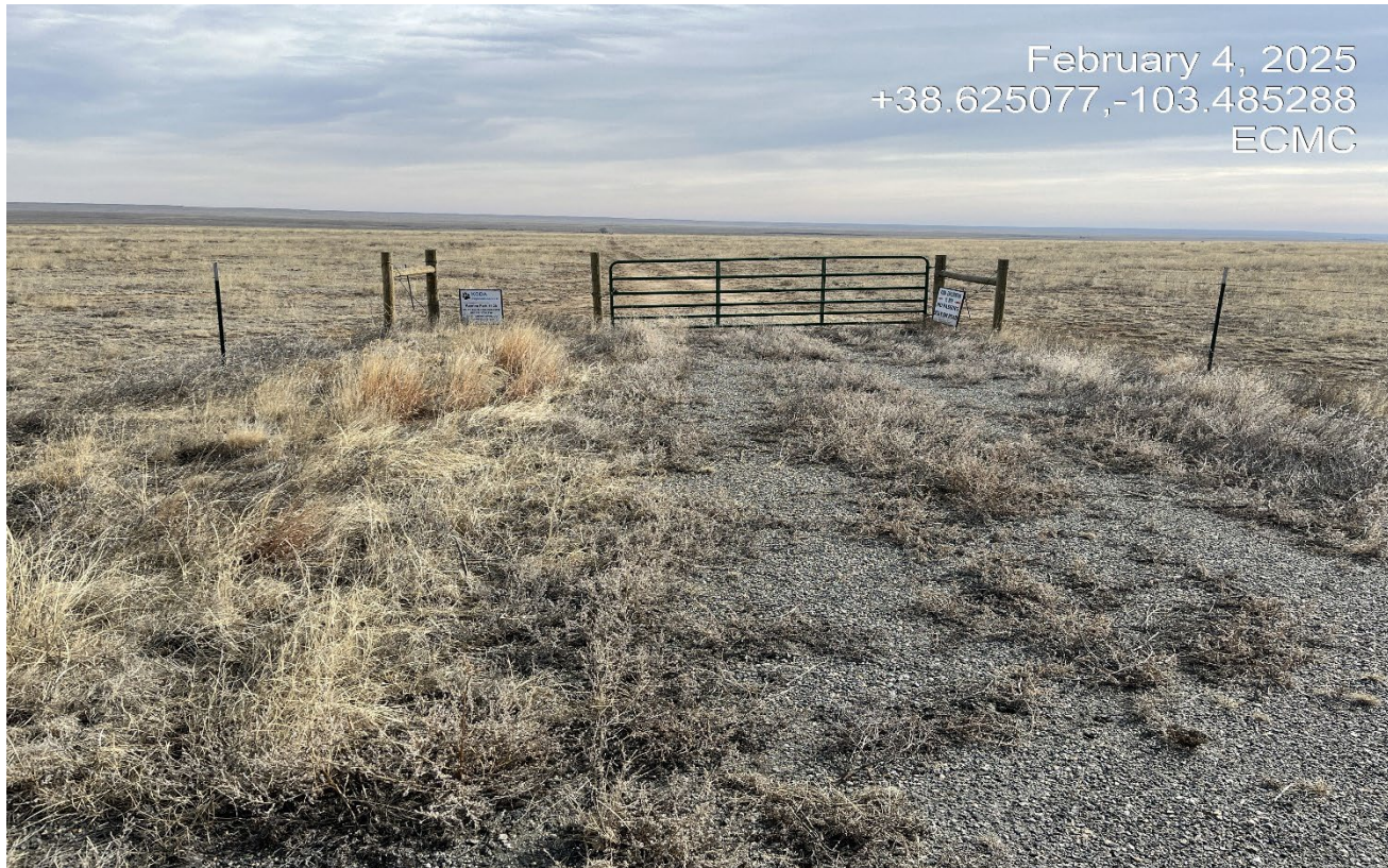
Photo 1. Facing east at the access road off the county road. The fence needs to be reinstalled back to the original position. The gravel needs to be removed and road reclaimed.