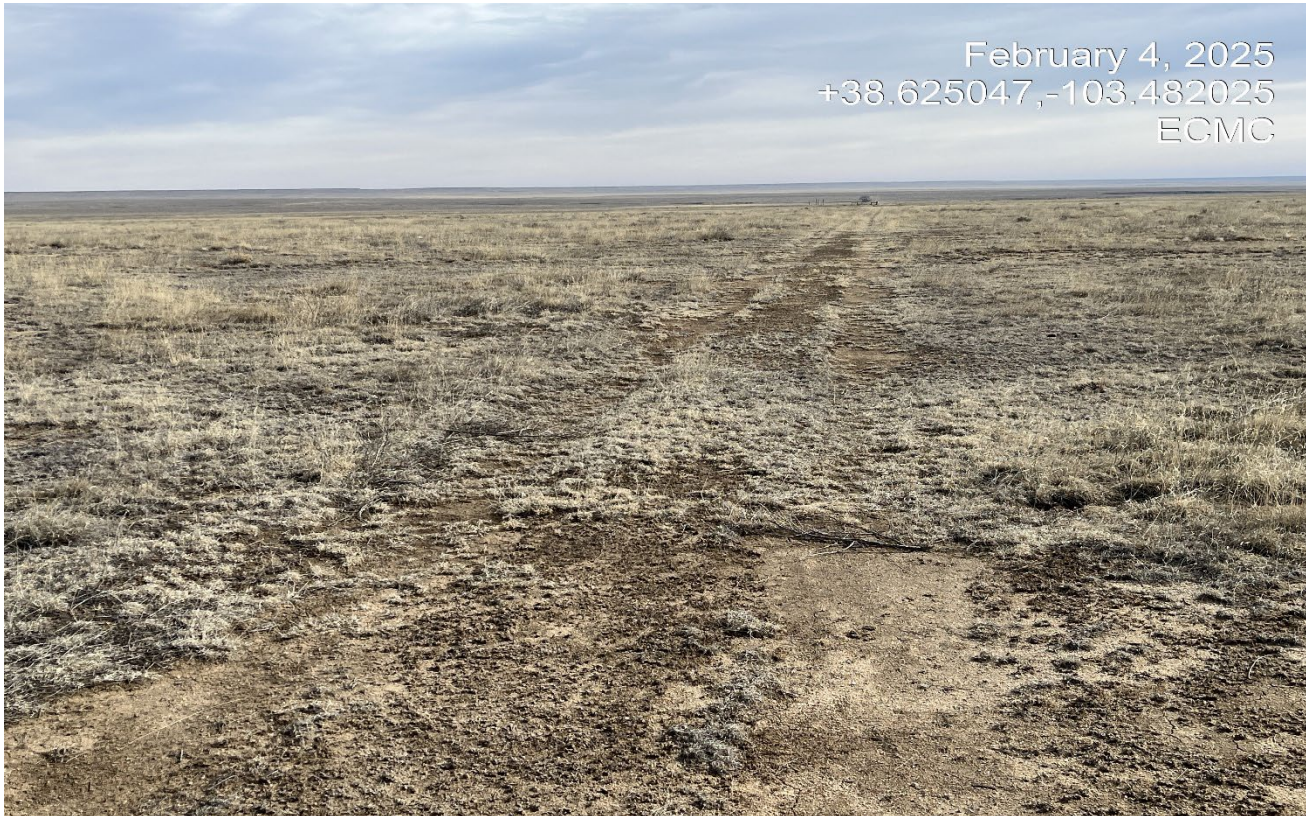
Photo 2. Further east along the road perennial vegetation appears to be growing back into the former road.