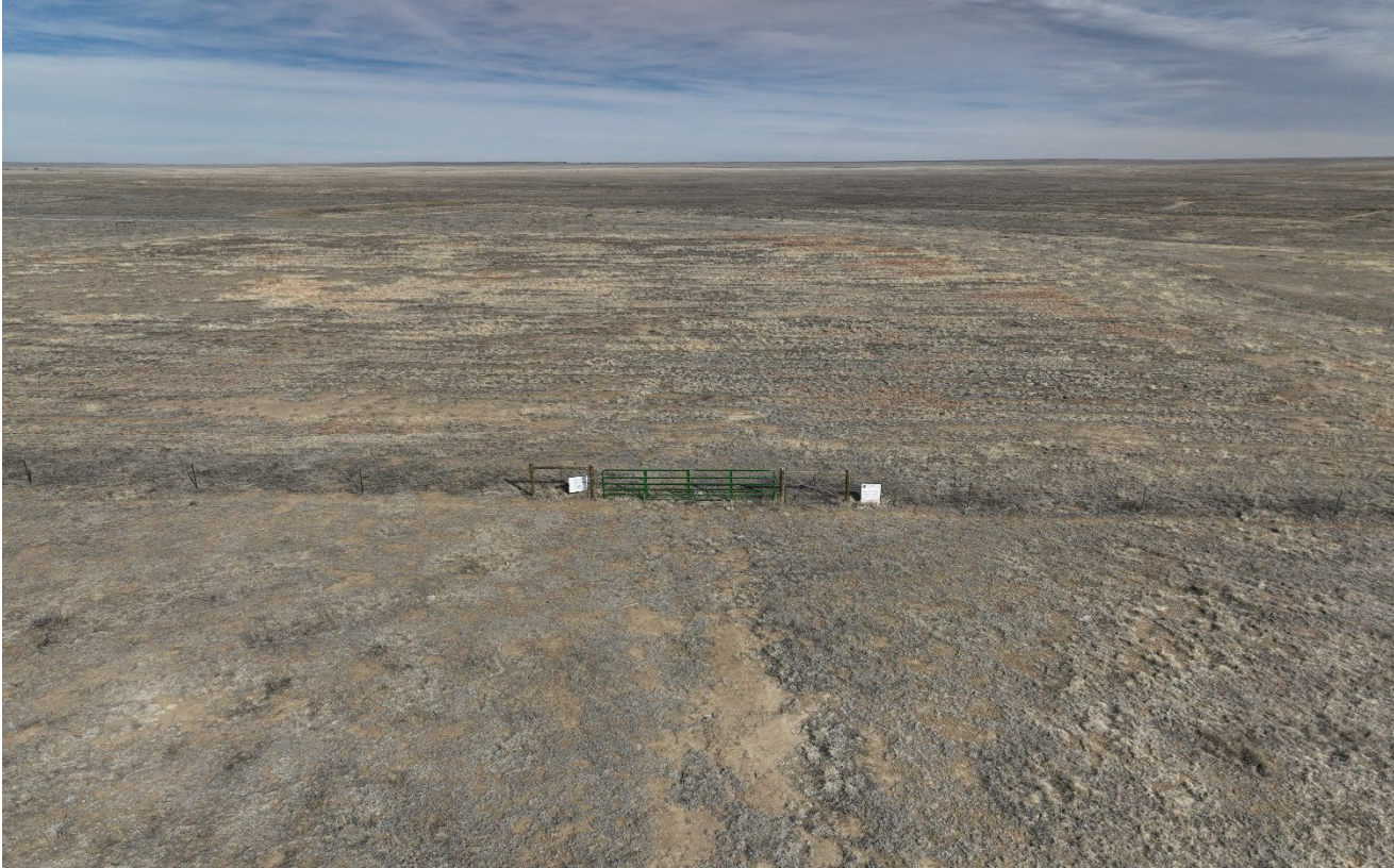
Photo 5. Drone aerial photo facing north toward the location.