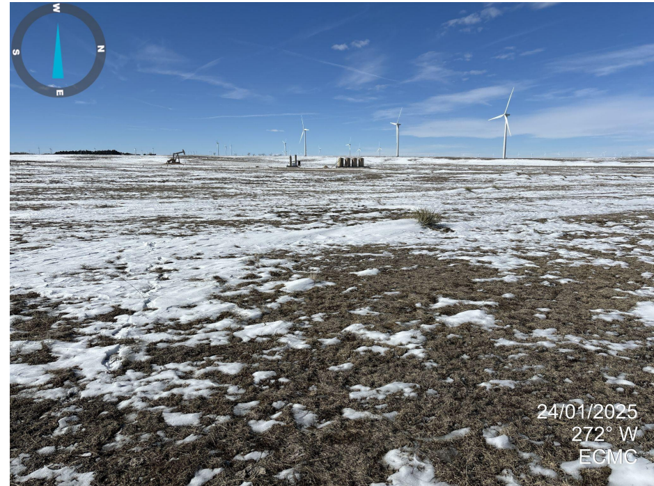
Photo 4. Looking west from well location. See Photo 1 comments.