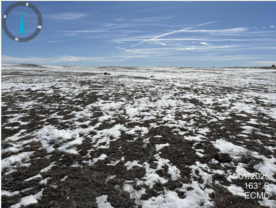
Photo 3. Looking south from well location. See Photo 1 comments.