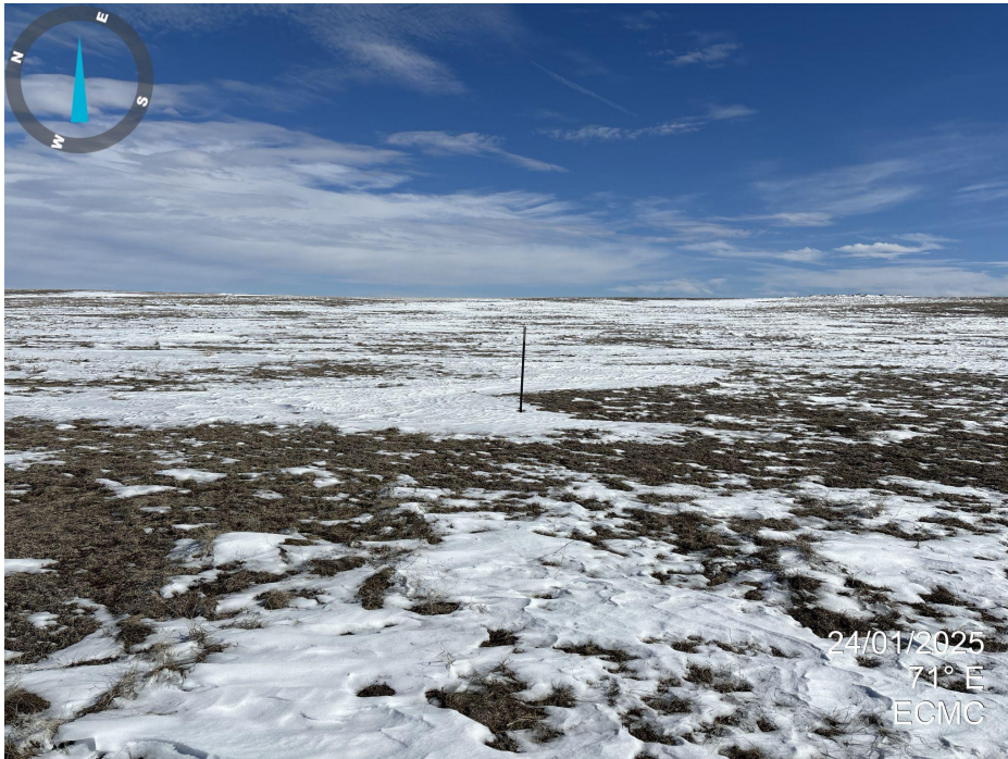
Photo 1. Photo taken looking east across location. T post remains at well location. Location has not been constructed.