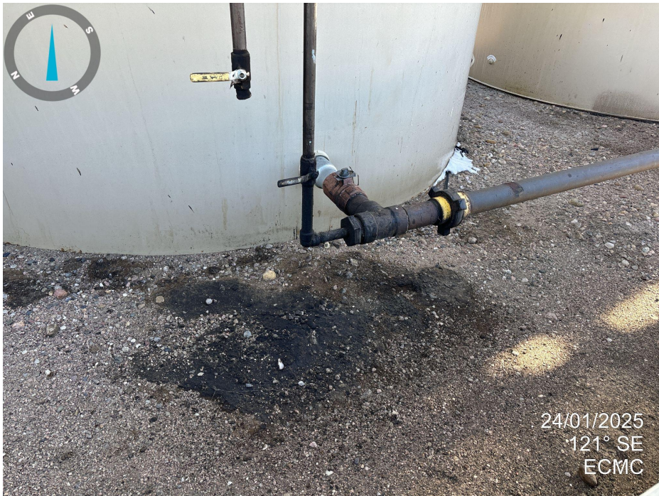
Photo 3. Looking at the west side of tank battery, northernmost crude oil tank. Stained soil beneath valves in secondary containment.