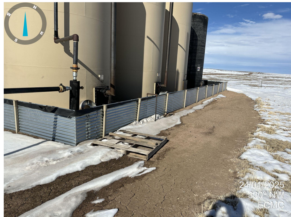
Photo 6. Pallet behind tank battery.