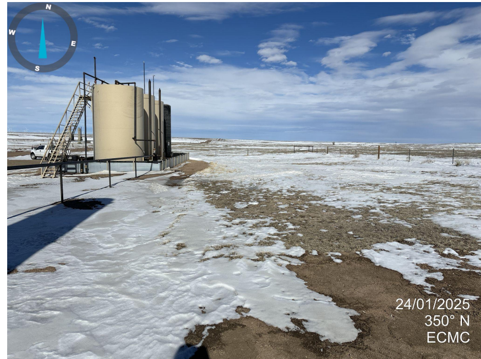
Photo 8. Looking north down the east side of the location. No noxious weeds were present at the time of inspection.