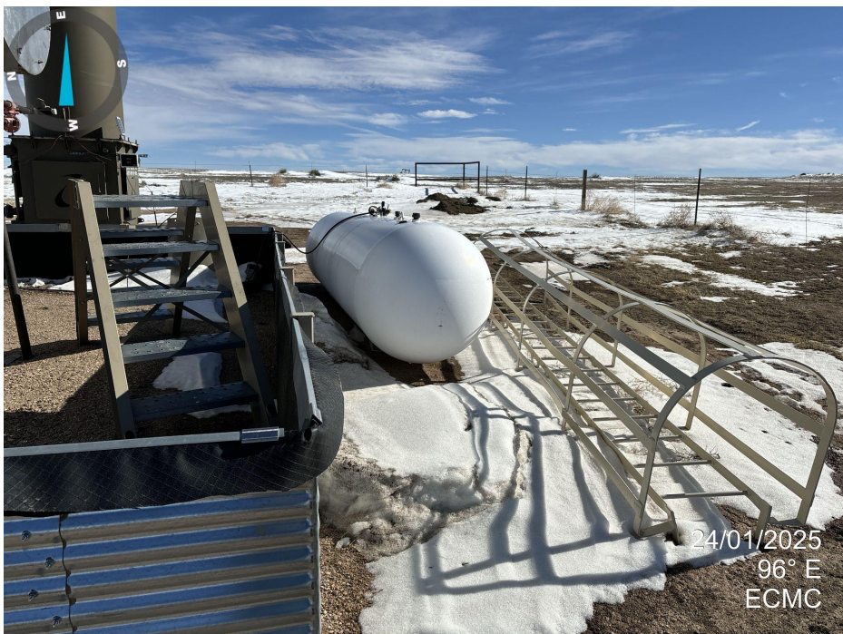
Photo 5. Picture on southern side of wellsite looking east near separator. Stairs and ladder are not installed.