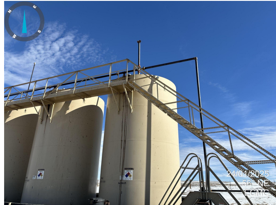
Photo 2. Looking east at tank battery. Spill from top hatch/valve.