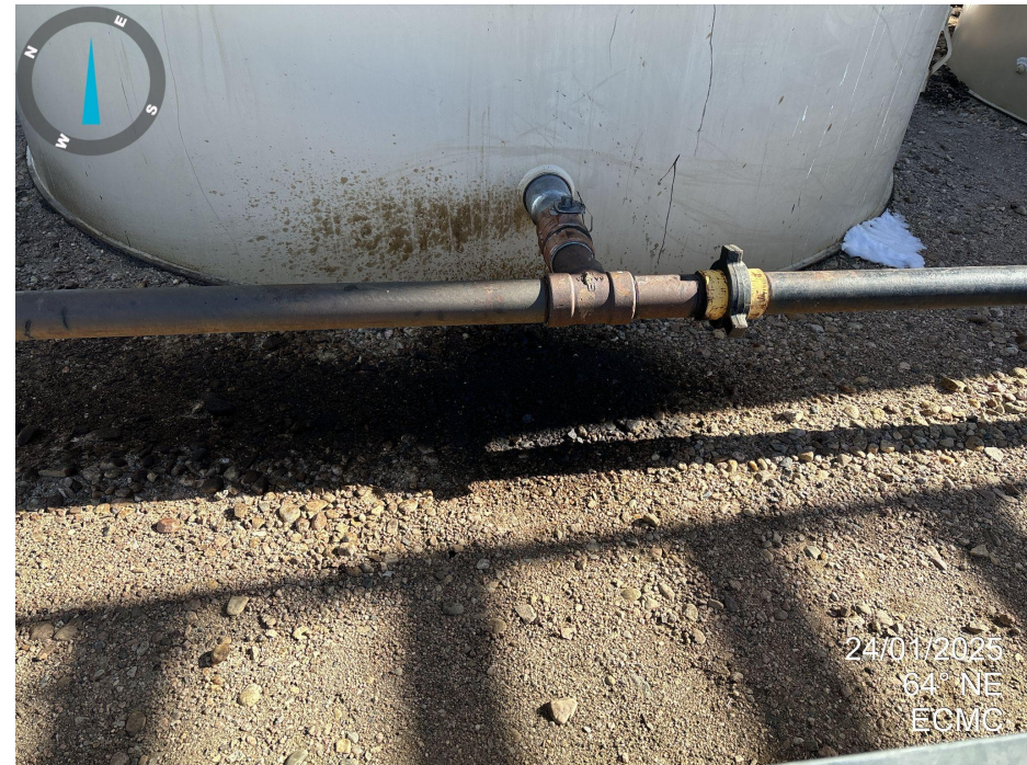
Photo 4. West side of tank battery middle crude oil tank. See photo 3 comments.