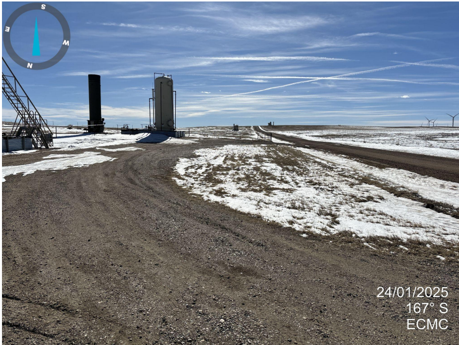
Photo 1. Photo taken looking south across the west side of location. Snow cover prevented a full vegetative assessment. At the time of inspection no noxious weeds were present.