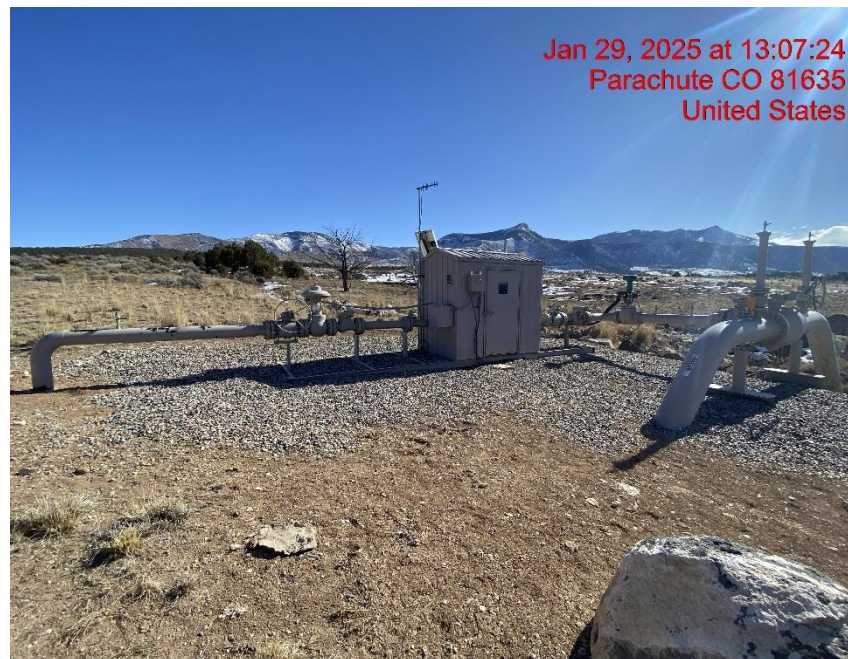
Location – Photo #06292