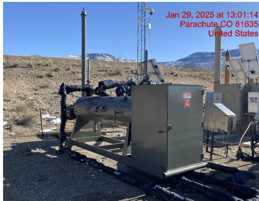
Location – Photo #06283