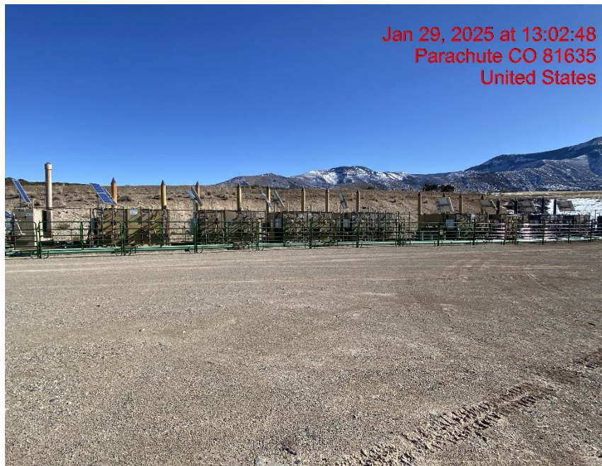
Location – Photo #06285