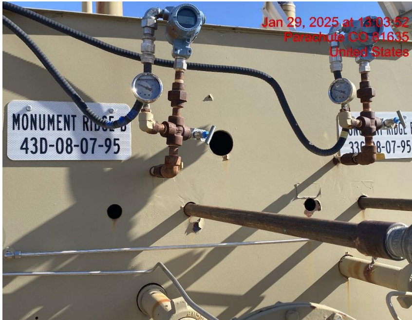
Wildlife Entry Hazard – Photo #06287