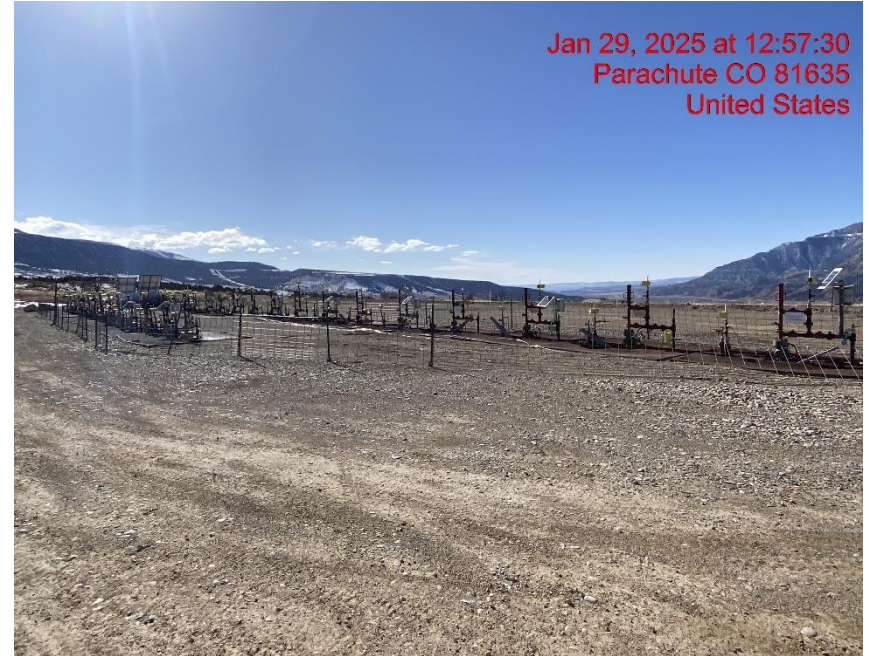
Location Overview – Photo #06273

Jan 29, 2025 at 12:57:30 Parachute CO 81635 United States