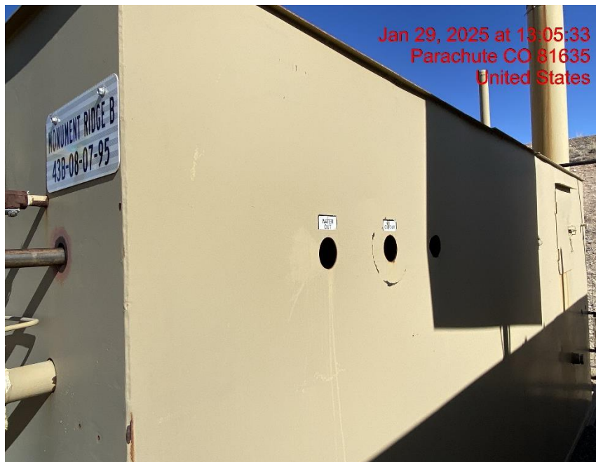
Wildlife Entry Hazard – Photo #06291