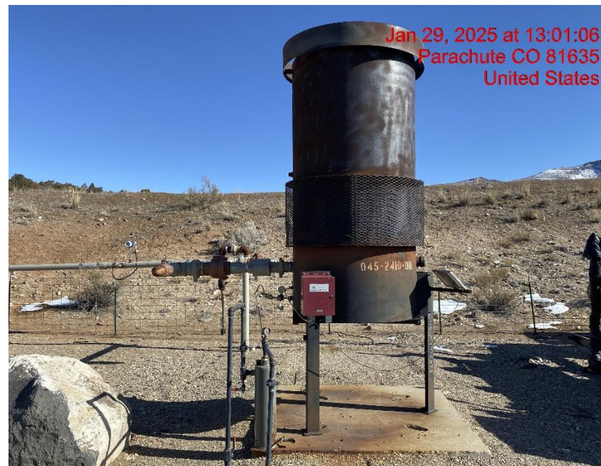
Location – Photo #06282