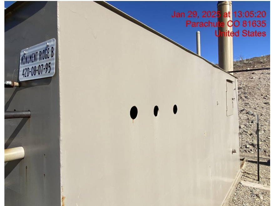
Wildlife Entry Hazard – Photo #06290