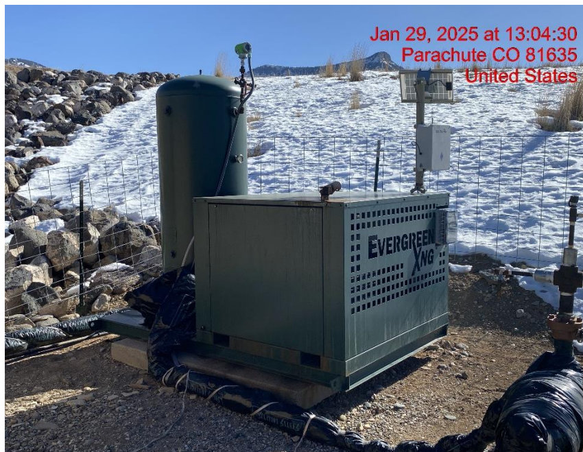
Location – Photo #06288