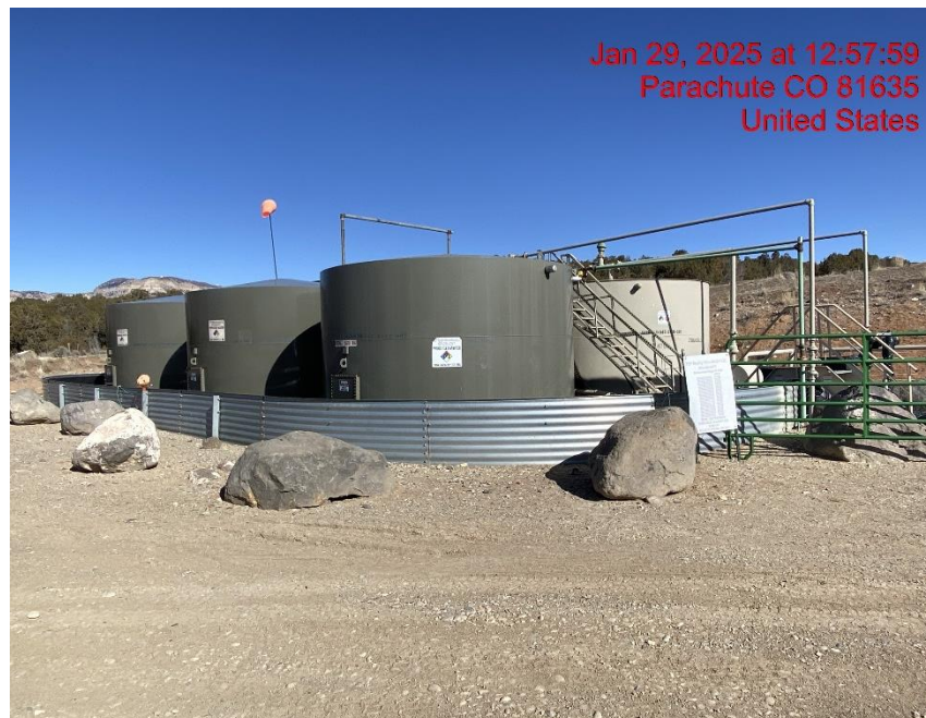
Location – Photo #06275