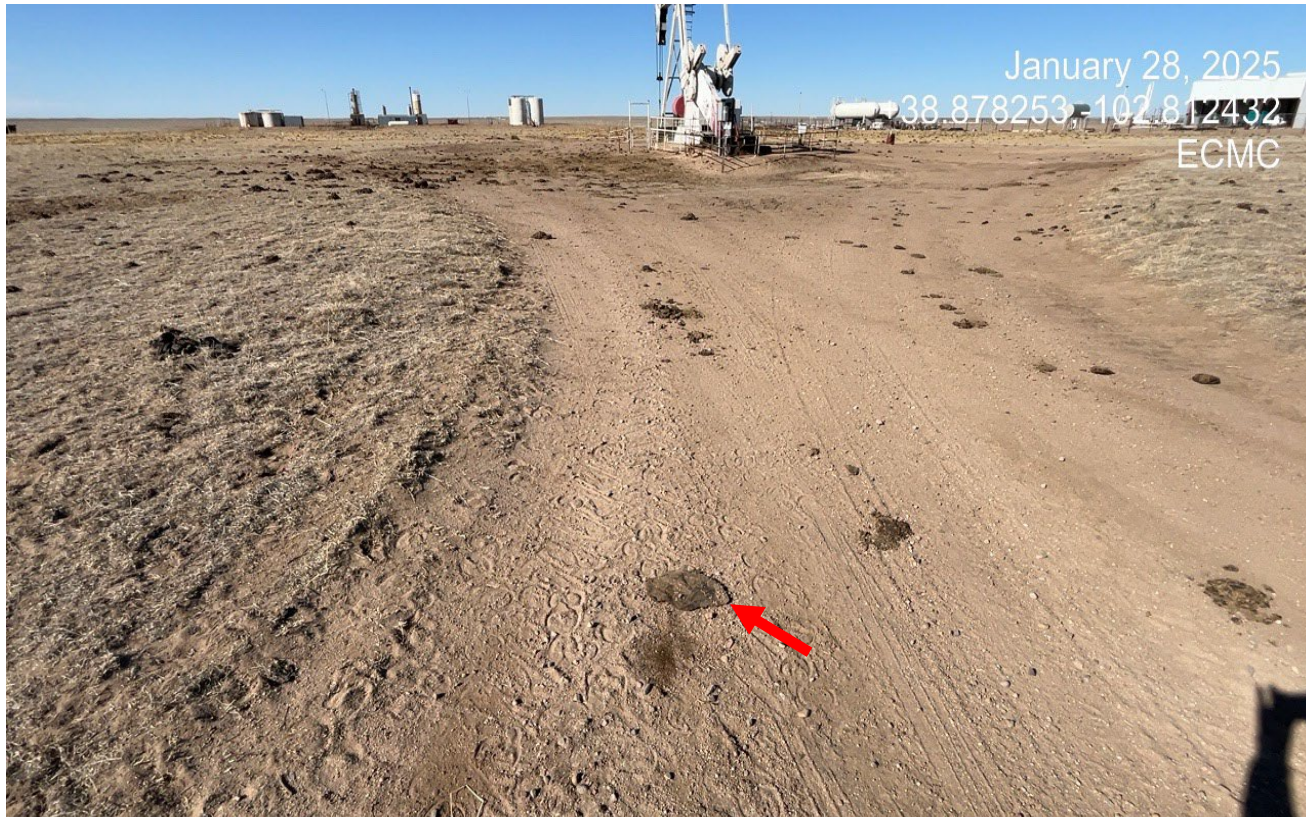
Photo 6. Facing northwest toward the wellsite. The red arrow points to an oily rag that still remains.