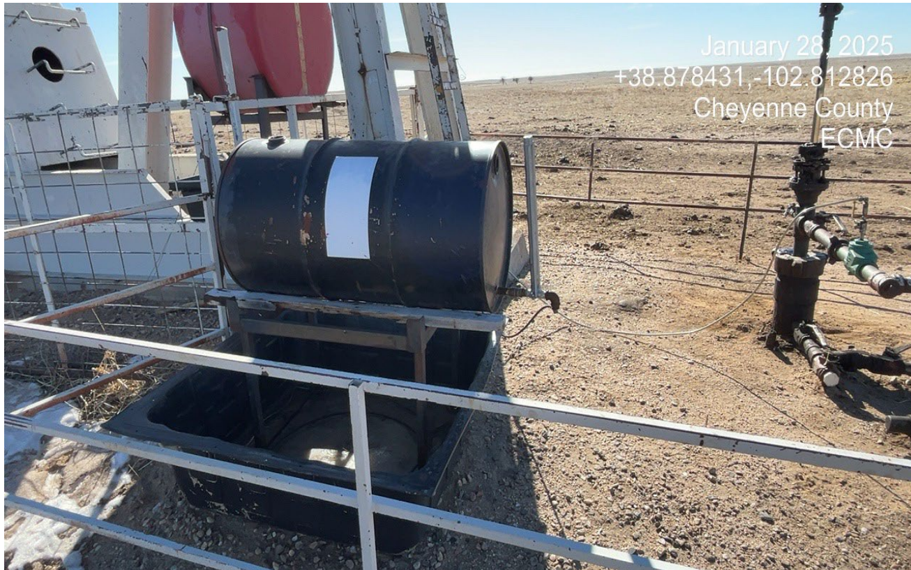
Photo 7. The labeling on the barrels is faded and needs to be updated.