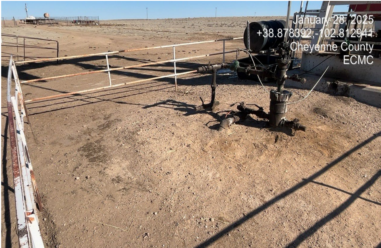
Photo 2. Facing toward the wellhead. There are stained soils by the wellhead. Previous CA was not completed.