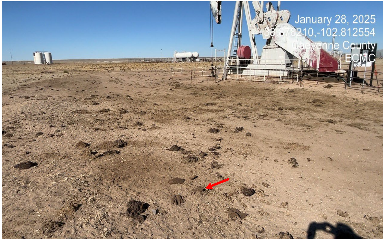
Photo 4. There is a pile of oily rags at the south side of the location. This must be removed and properly disposed. Previous CA was not completed.