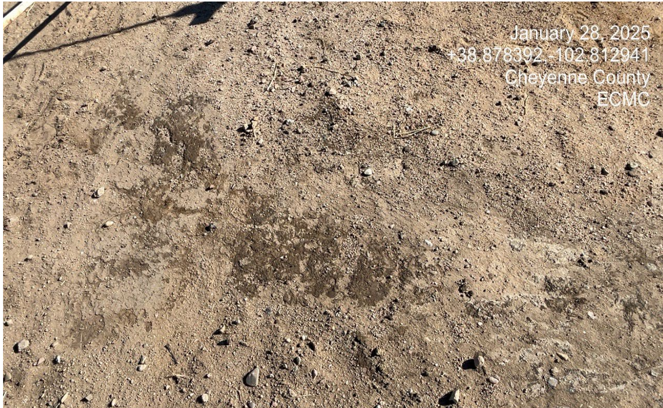
Photo 3. View of oil stained soils at the wellhead.