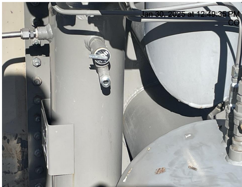
Photo # 2931 PRV vent line does not comply with CECMC pressure safety device rules