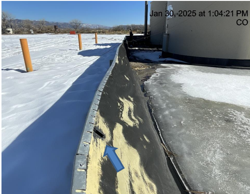
Photo # 2933 Hole in secondary containment liner/liner needs maintenance