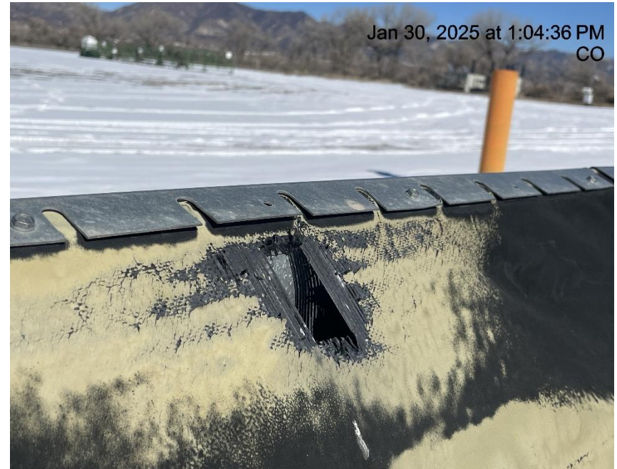
Photo # 2934 Hole in secondary containment liner/liner needs maintenance