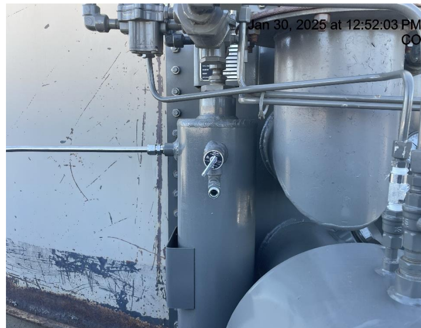
Photo # 2932 PRV vent line does not comply with CECMC pressure safety device rules