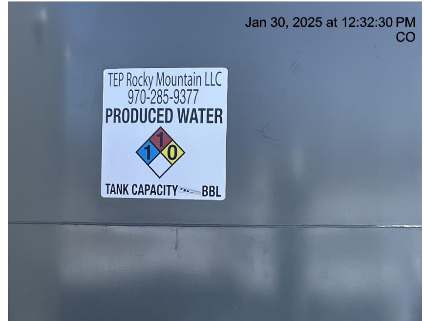
Photo # 2833 Capacity on tank label illegible/not in compliance with CECMC rules