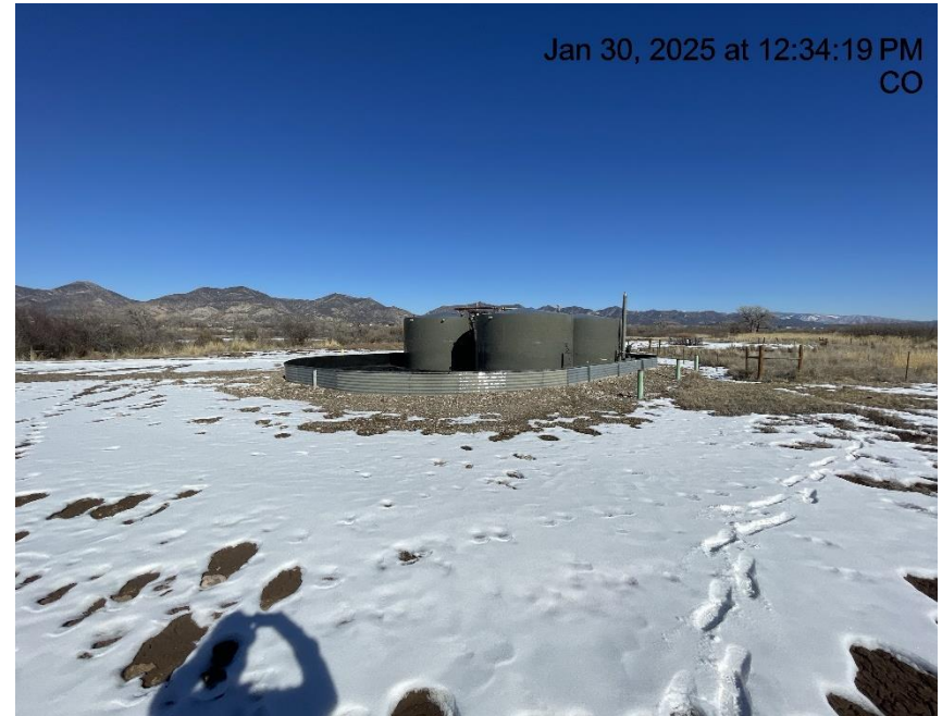
Photo # 2835 One 300 bbl tank added to location - Unable to locate FORM 4 SUNDRY for this equipment/not in compliance with CECMC rules