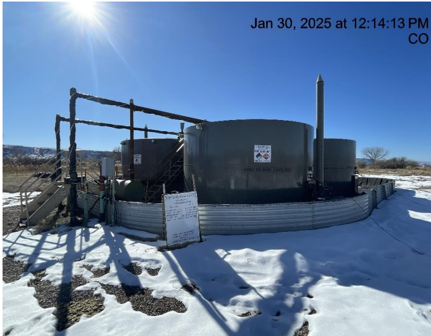
Photo # 2834 One 300 bbl tank added to location - Unable to locate FORM 4 SUNDRY for this equipment/not in compliance with CECMC rules