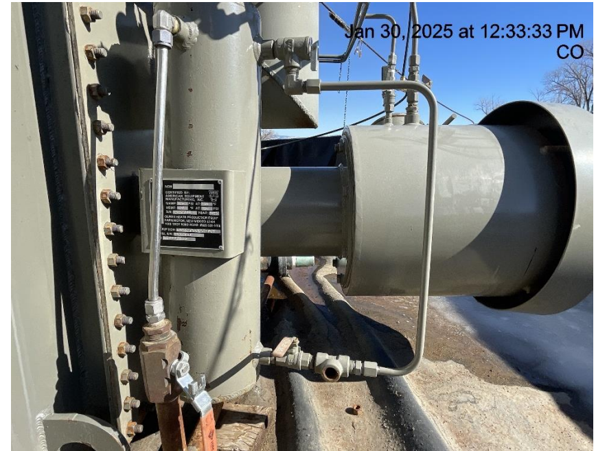
Photo # 2829 PRV vent line does not comply with CECMC pressure safety device rules