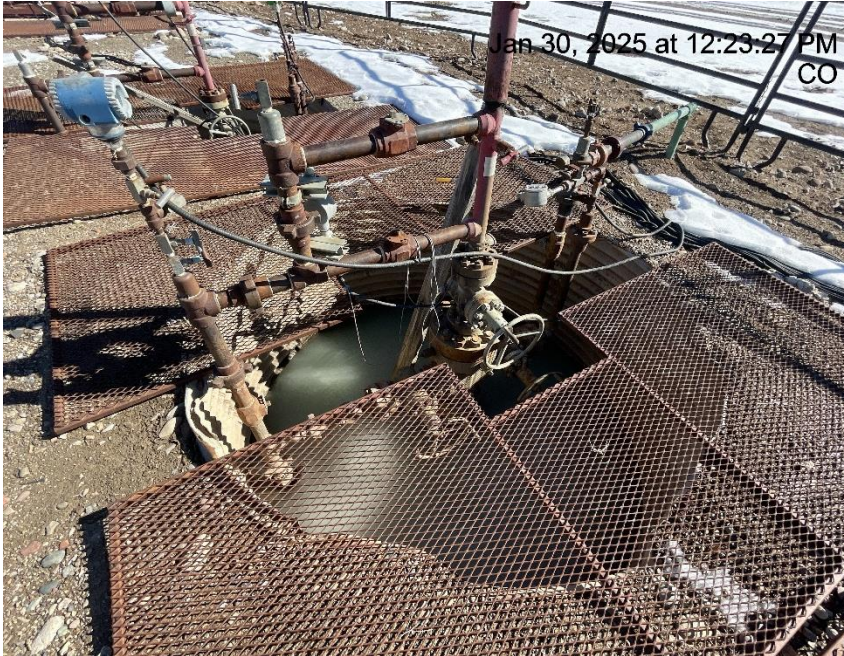
Photo # 2830 Cellar not properly covered/wildlife & personnel hazard