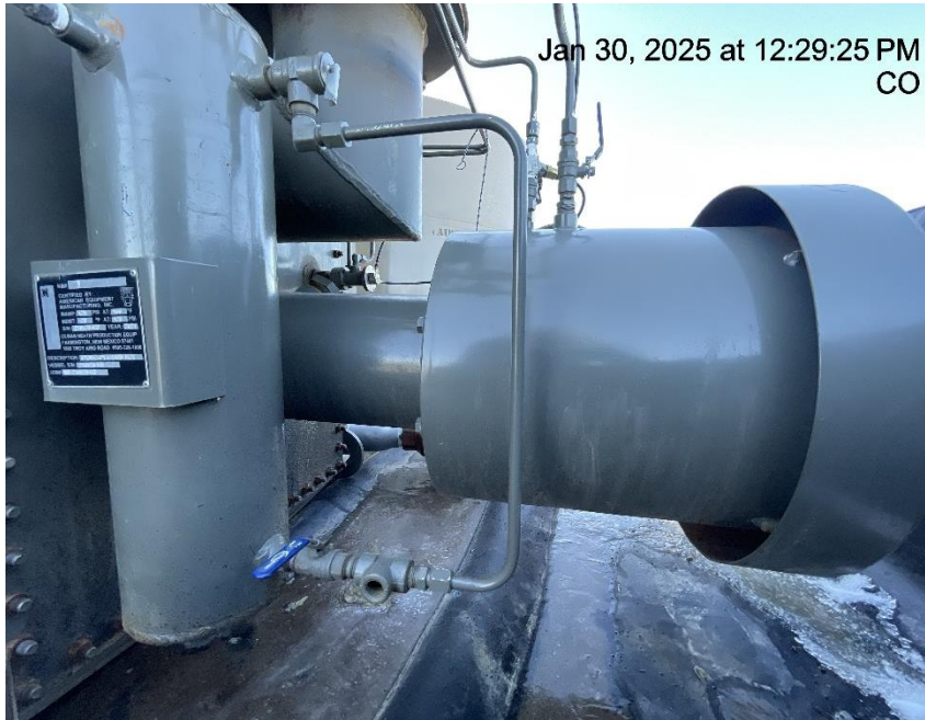
Photo # 2828 PRV vent line does not comply with CECMC pressure safety device rules