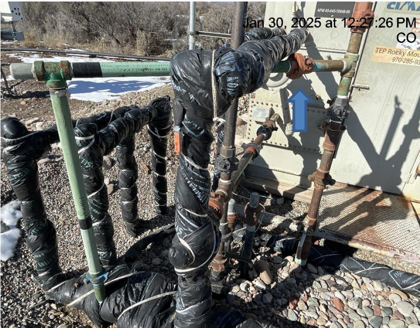
Photo # 2832 Valve on the 2 inch line connecting the RIVER RANCH A4 well BH line to the sales line appears to be shut