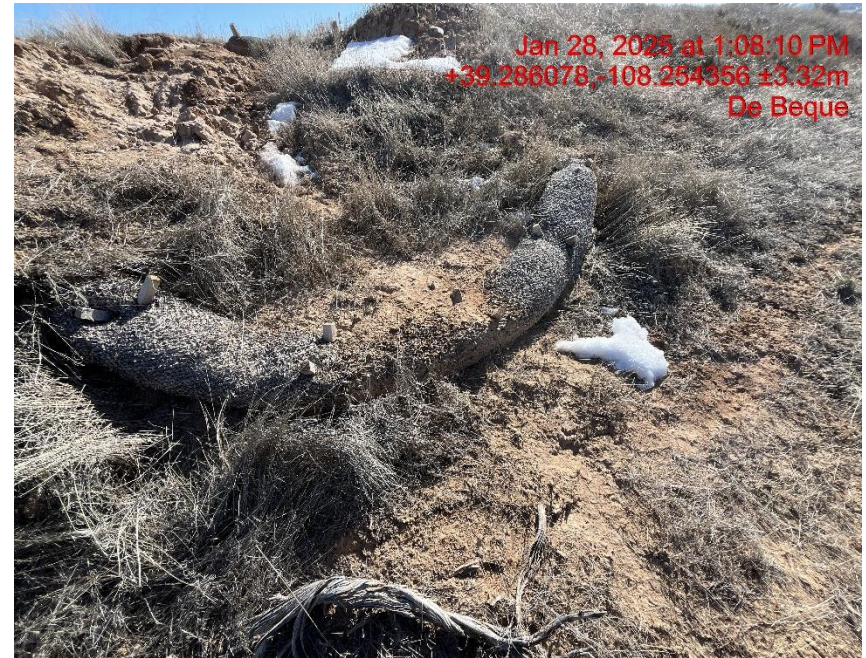
Photo # 3687 Erosion & transport of sediment off location & into vegetated areas/failure to minimize erosion & transport of sediment