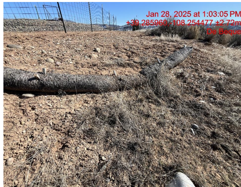
Photo # 3676 Erosion & transport of sediment off location & into vegetated areas/failure to minimize erosion & transport of sediment