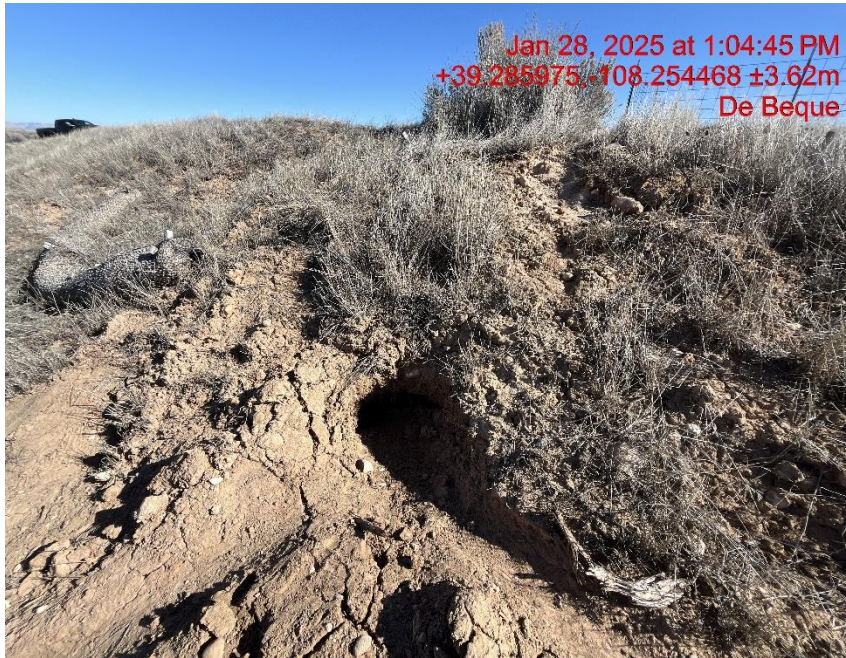
Photo # 3678 Erosion & transport of sediment off location & into vegetated areas/failure to minimize erosion & transport of sediment