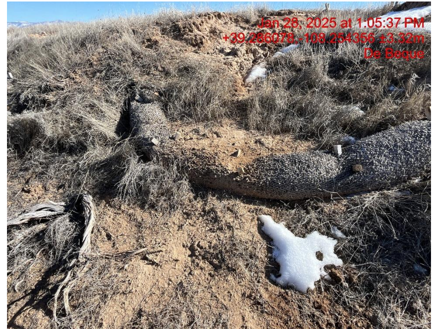
Photo # 3680 Erosion & transport of sediment off location & into vegetated areas/failure to minimize erosion & transport of sediment