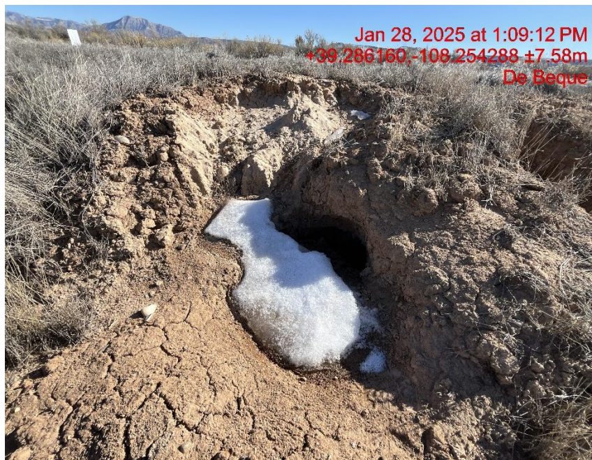
Photo # 3689 Erosion & transport of sediment off location & into vegetated areas/failure to minimize erosion & transport of sediment