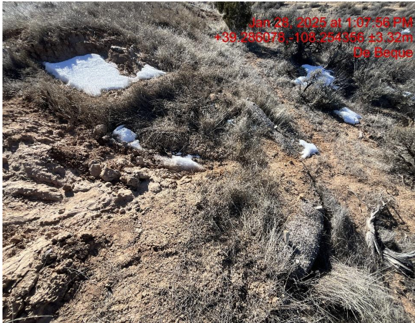
Photo # 3686 Erosion & transport of sediment off location & into vegetated areas/failure to minimize erosion & transport of sediment