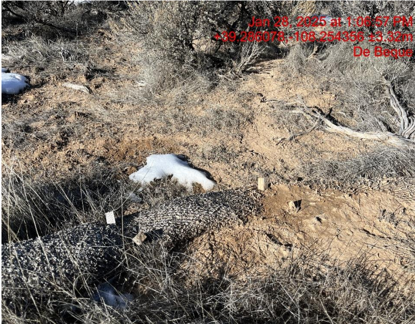
Photo # 3683 Erosion & transport of sediment off location & into vegetated areas/failure to minimize erosion & transport of sediment