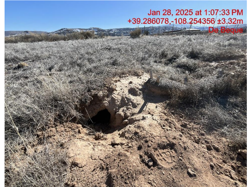
Photo # 3684 Erosion & transport of sediment off location & into vegetated areas/failure to minimize erosion & transport of sediment