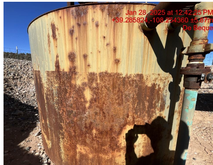
Photo # 3669 Tank has a large amount of rust. All in service tanks will be inspected & maintained