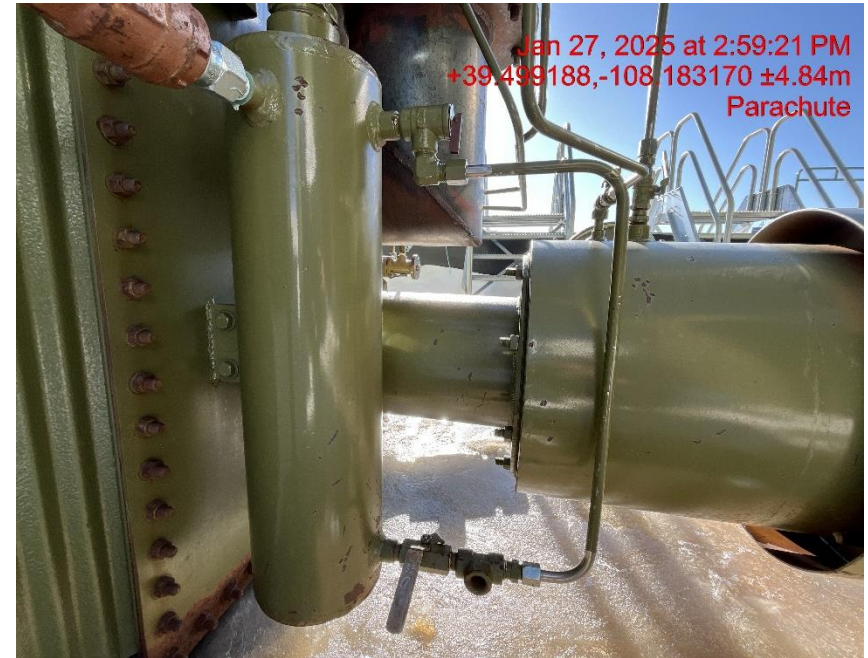
Photo # 3578 PRV vent line does not comply with CECMC pressure safety device rules