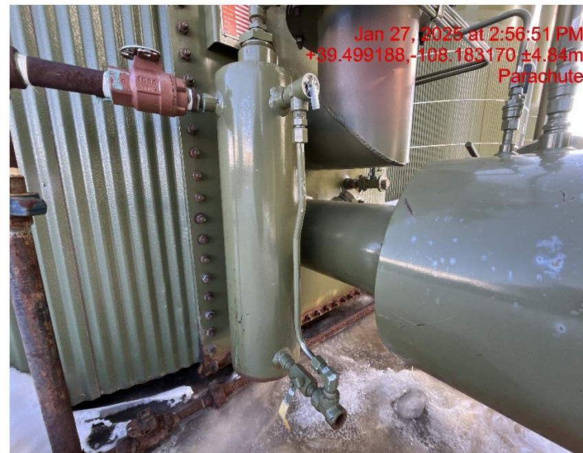
Photo # 3575 PRV vent line does not comply with CECMC pressure safety device rules