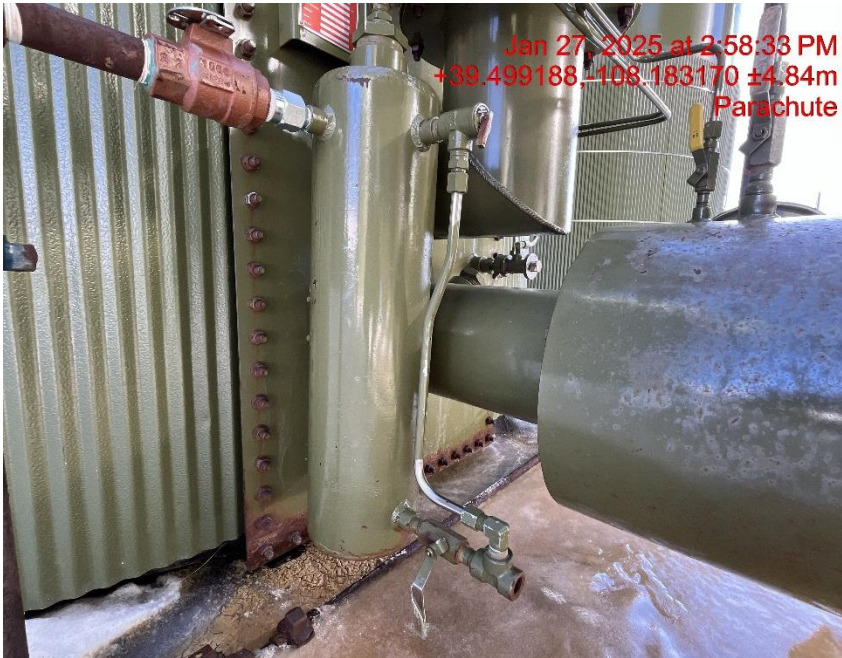
Photo # 3577 PRV vent line does not comply with CECMC pressure safety device rules