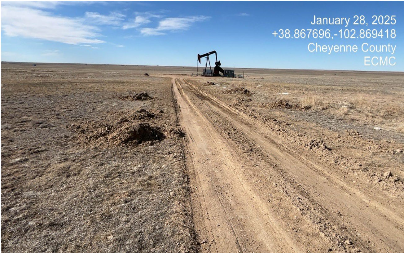
Photo 1. Facing along the access road. The soil pushed off of the road into pile will need to be regraded.