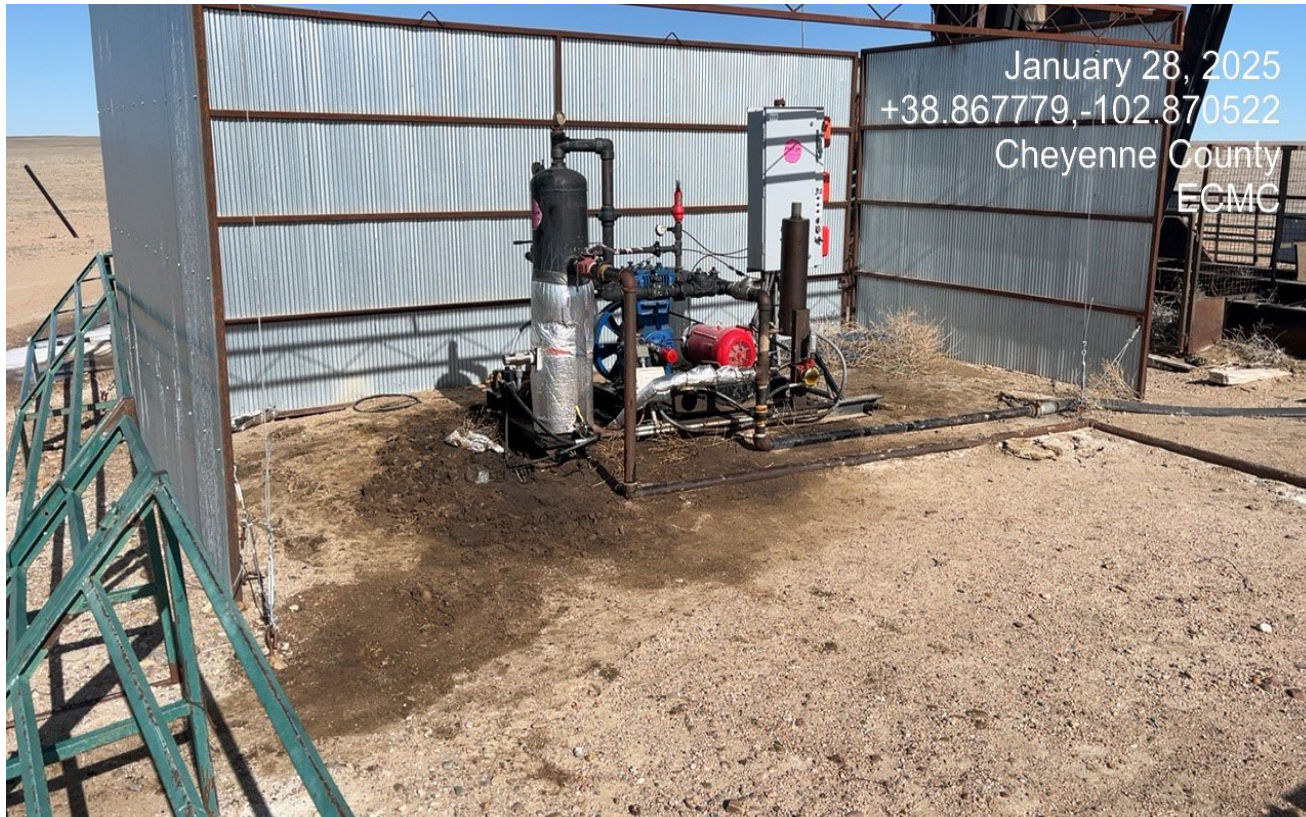
Photo 4. There is oil stained soils around the flowline and equipment.