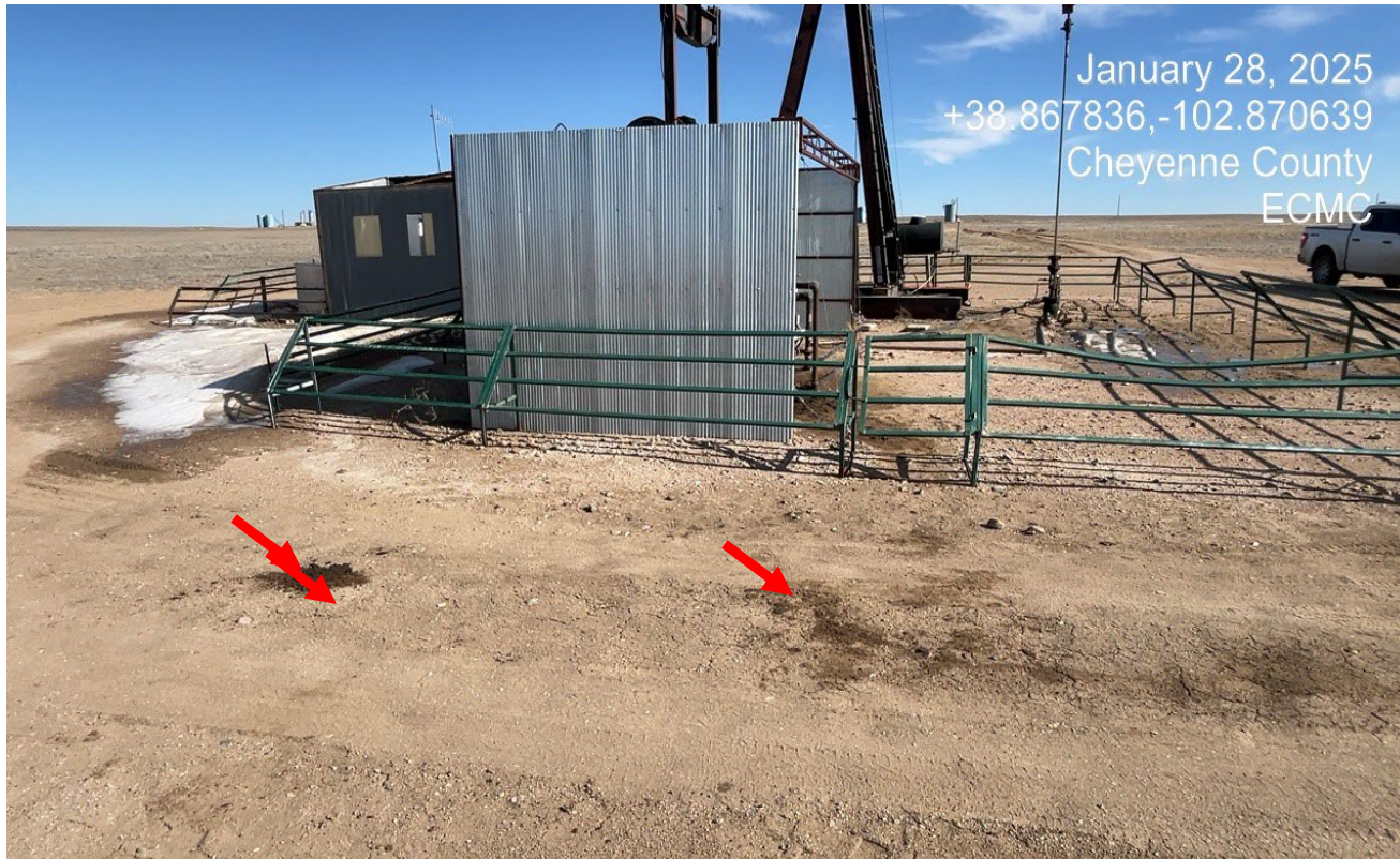
Photo 6. View of oily waste on the road way shown in the previous photo.