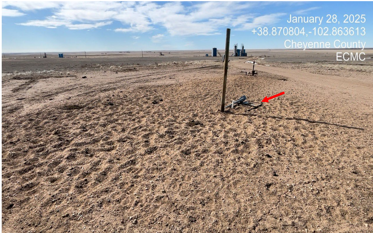
Photo 3. The sign and electric utility has fallen over.