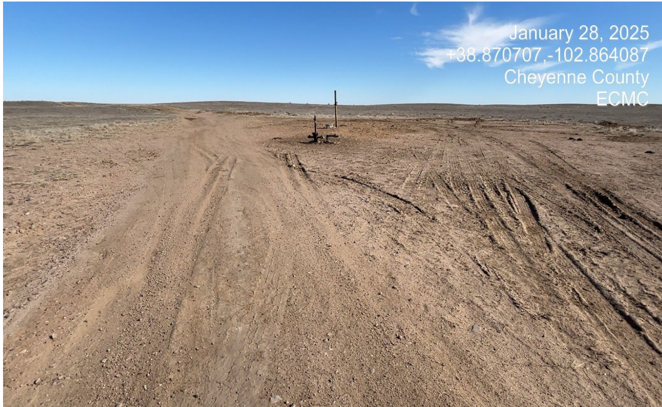
Photo 1. Facing northeast toward the wellsite.