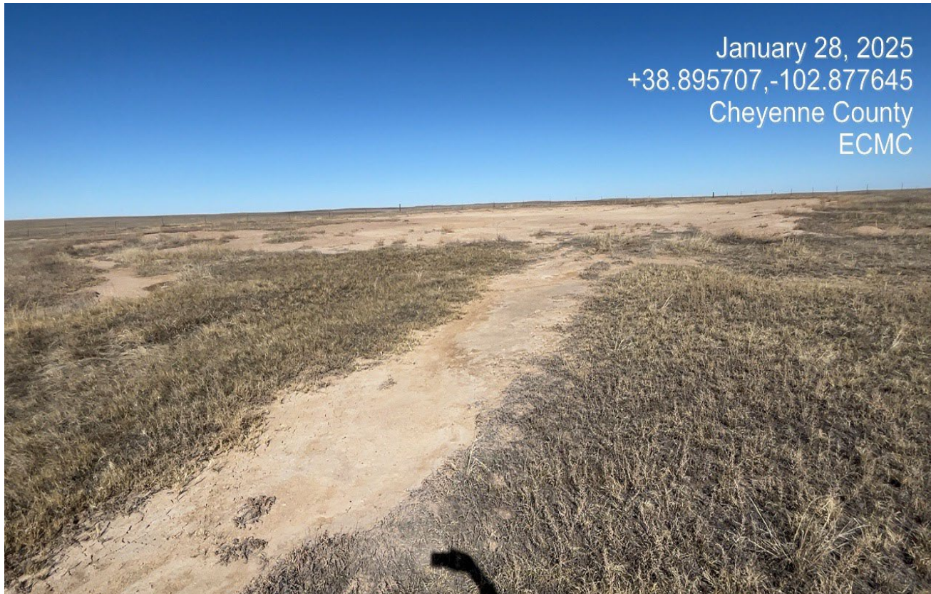
Photo 3. Facing north toward the location. The location is mostly bare of vegetation and appears to have impacted soils from a historic spill.