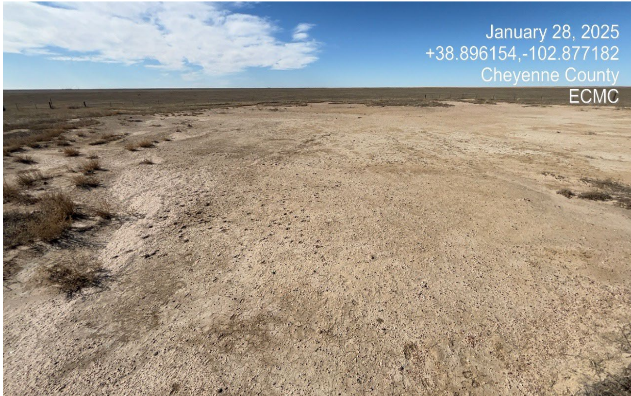
Photo 4. East side of the location facing west. There is no vegetation growth at the location which is approximately 250'x250'.