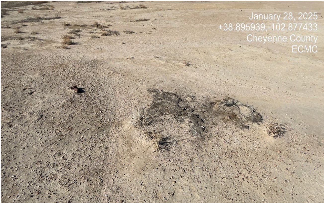
Photo 5. There is a black hardened hydrocarbon material at the east side of the location shown in this photo.