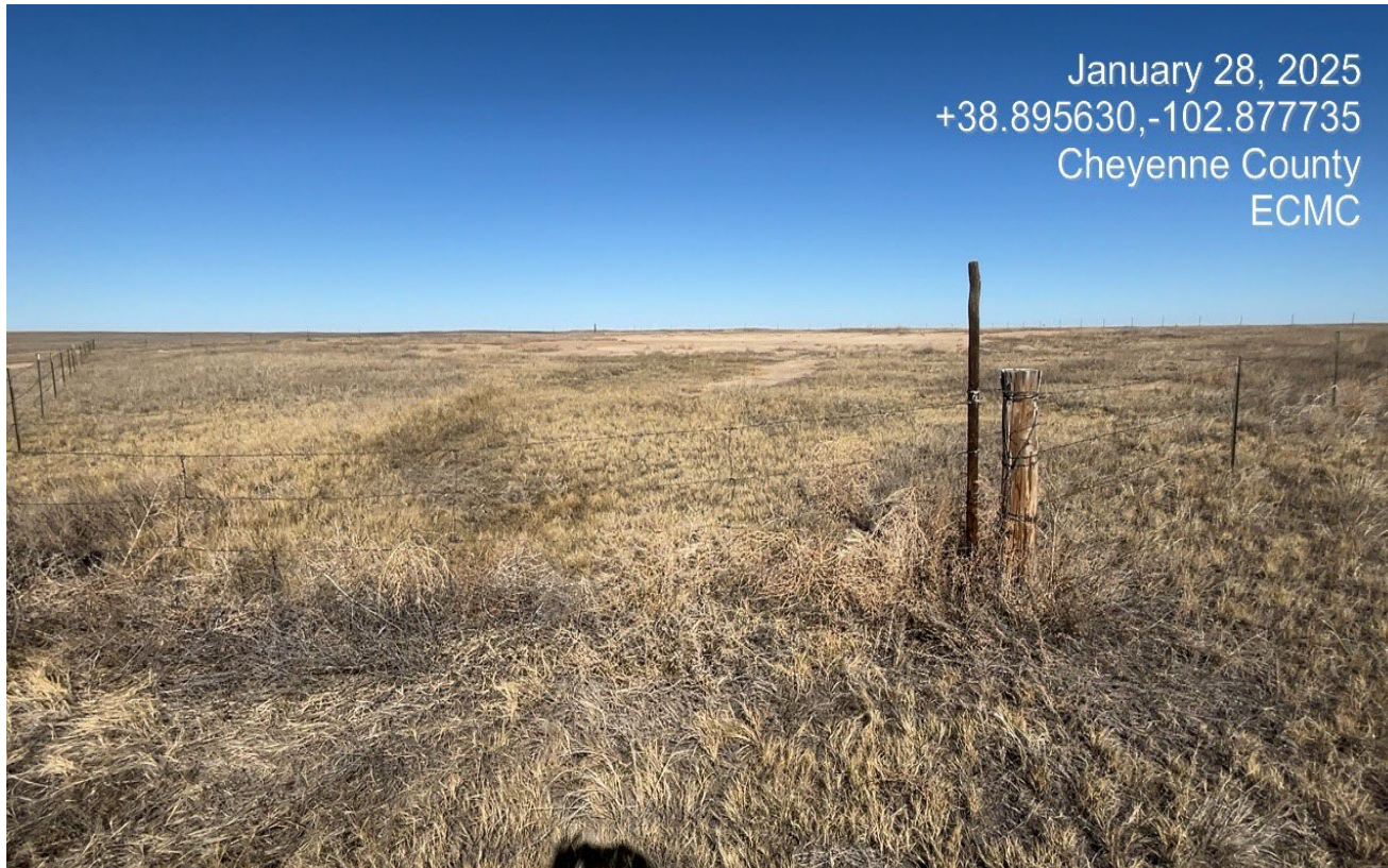
Photo 2. Facing north toward the location which has a fence around the perimeter.