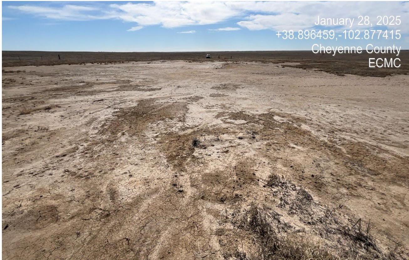
Photo 6. North side of the location facing south. There is no vegetation growth at the location which is approximately 250'x250'.