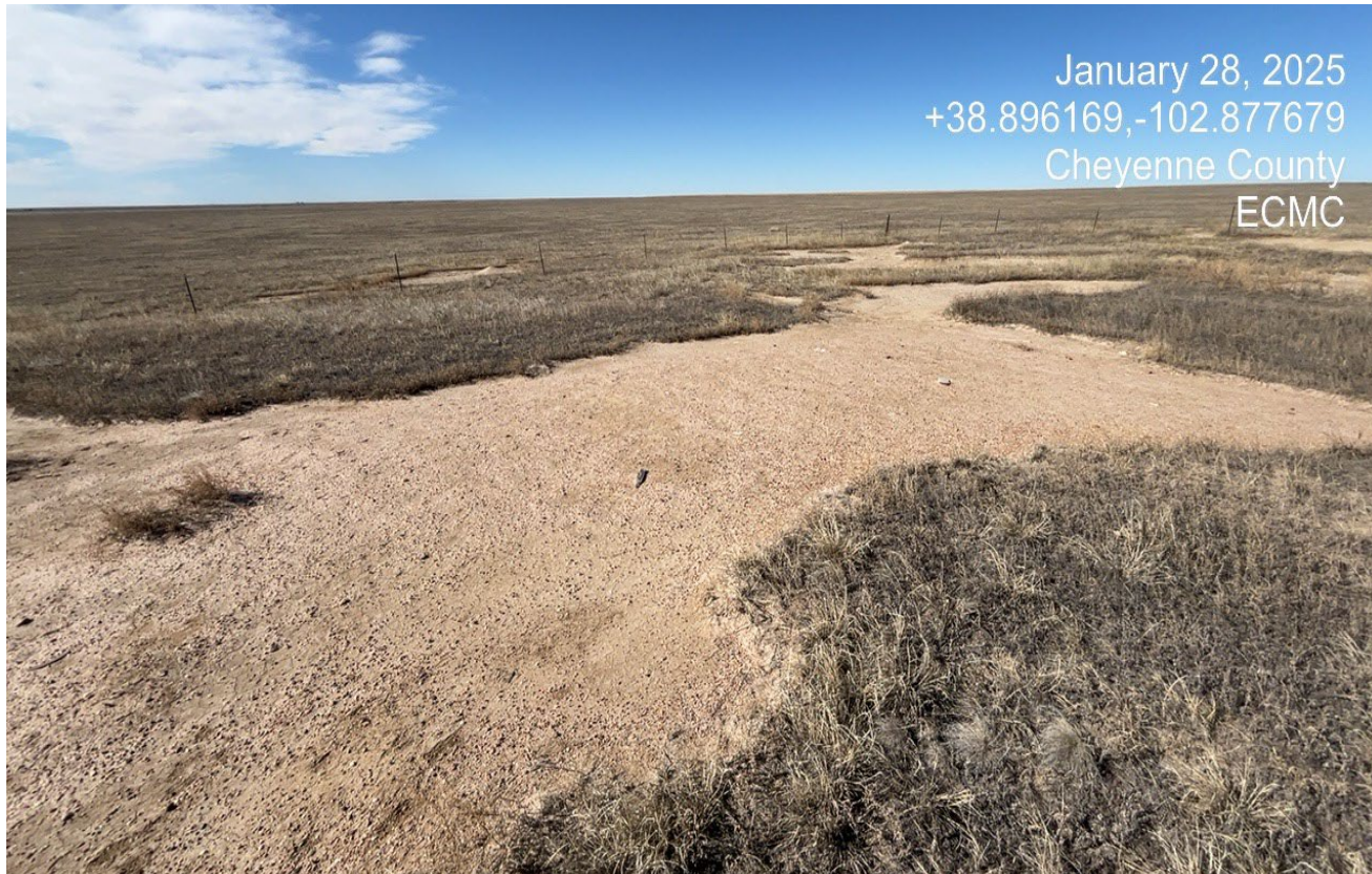
Photo 8. Facing west at the location. It appears there are downhill flow pattern where vegetation is not growing. This is indicative of a historic spill causing a salt kill of vegetation..