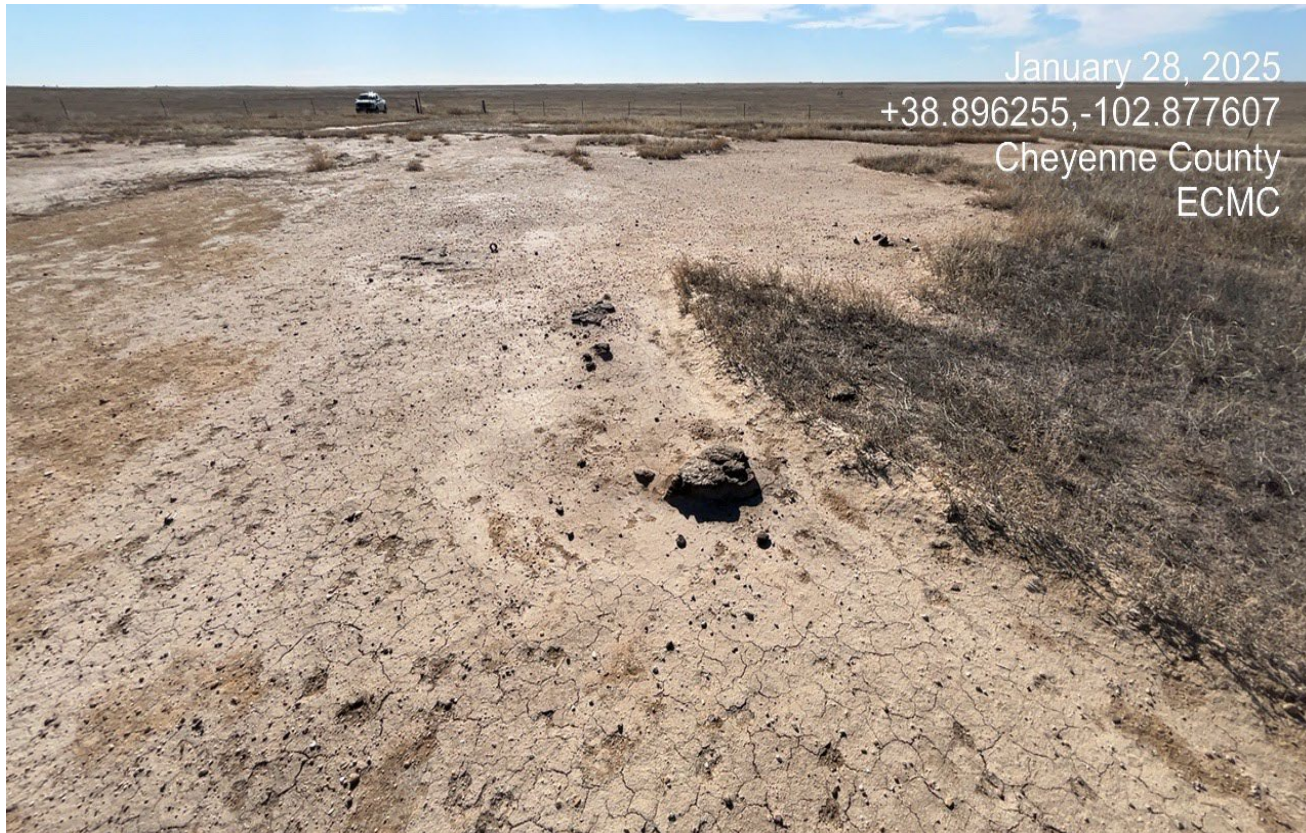
Photo 7. Facing south at the location. Remnants of debris remain.