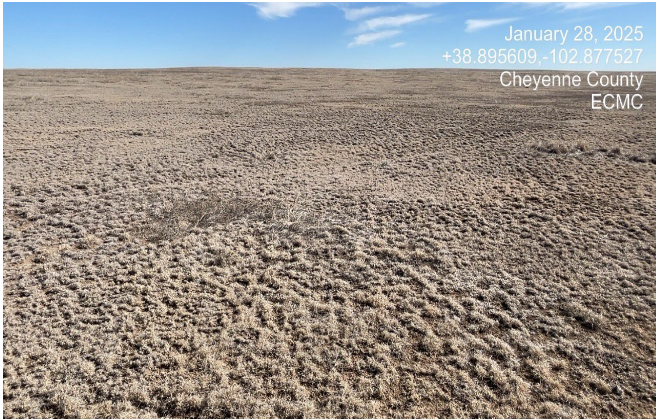
Photo 10. Facing east toward the surrounding undisturbed reference which consists of Blue grama, Threeawn, Sand dropseed among other native plant species.