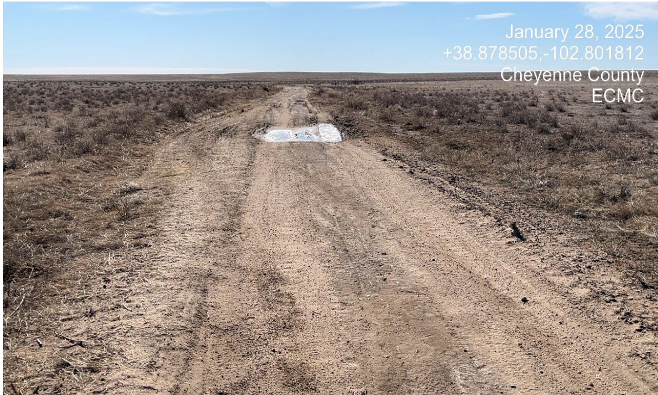
Photo 1. Facing south along the access road. Vehicles are causing unnecessary disturbance driving outside of the access road due to stormwater pooling on the road. The access road must be maintained and vehicles shall not drive outside of the access road boundary. Previous corrective action was not completed.