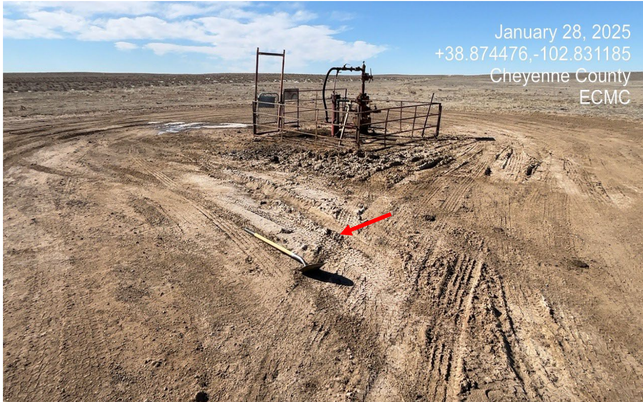
Photo 3. Facing west toward the wellsite. There was a leak at the wellhead which appears to have flowed to the east side of the location. There is white and blackened soils which appears to be condensate from the well.