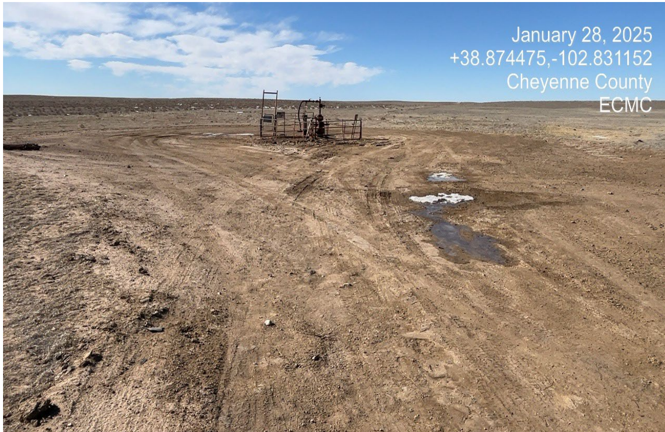
Photo 2. Facing southwest toward the wellsite.