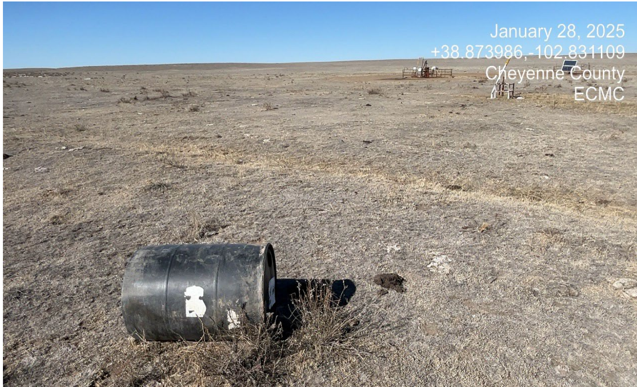
Photo 5. There is a black barrel that blew off the location.