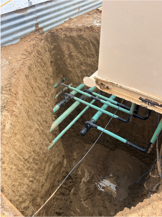
Looking NE Hydrovac removed impacted soil to sidewall and floor points of compliance