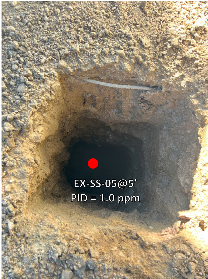
Looking S No petroleum hydrocarbon staining or odor observed