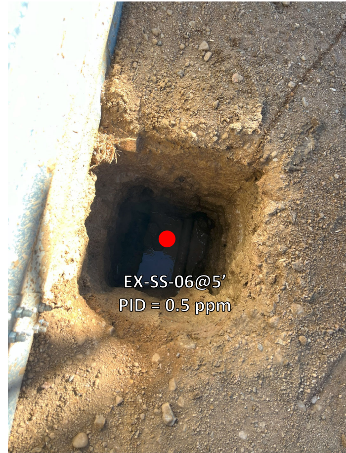
Looking E No petroleum hydrocarbon staining or odor observed