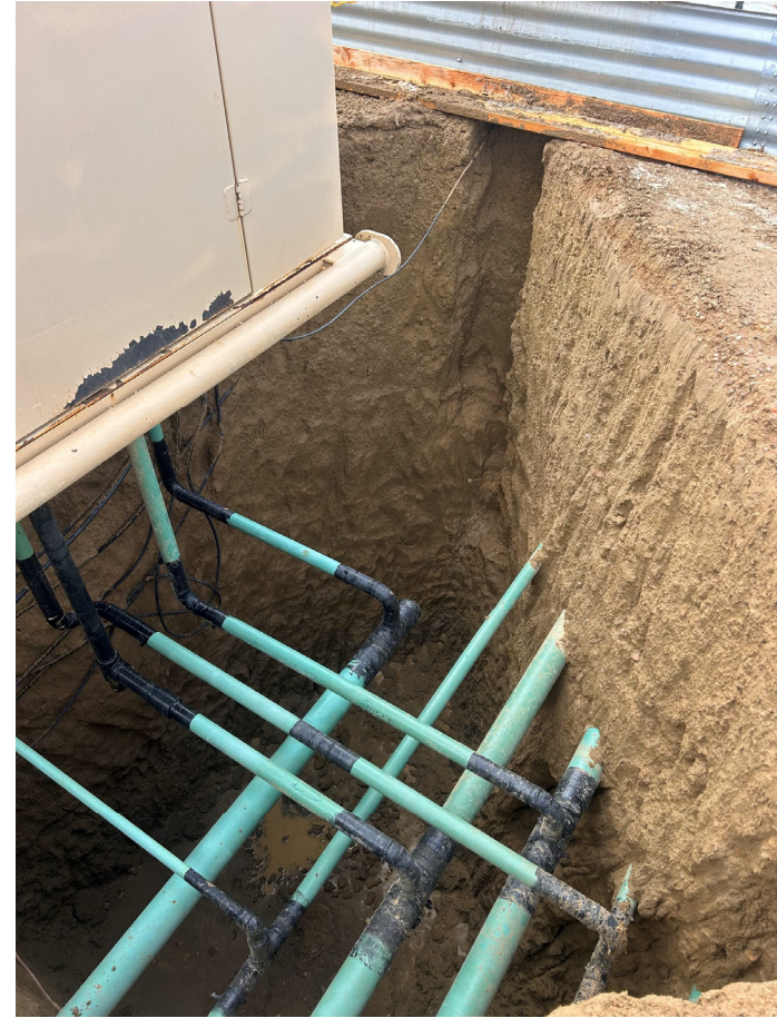
Looking SW Hydrovac removed impacted soil to sidewall and floor points of compliance