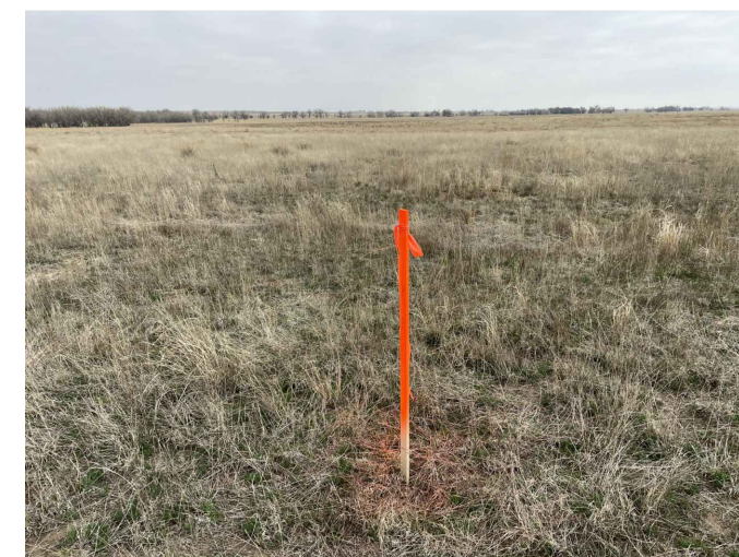
VIEW 8 – NORTHWEST