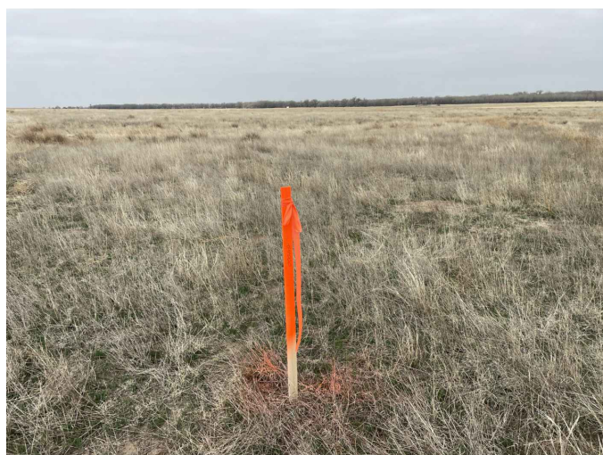
VIEW 6 – SOUTHWEST