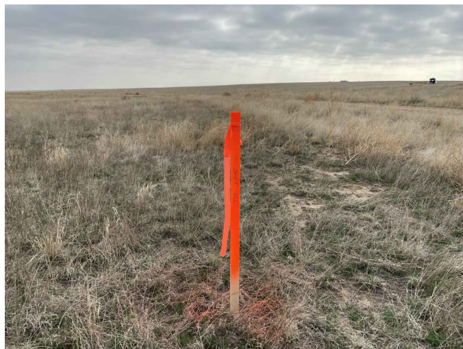
VIEW 2 – NORTHEAST