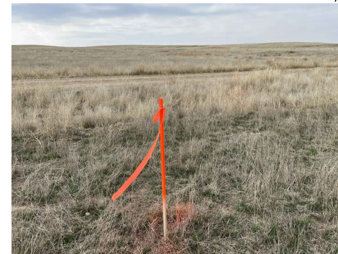
VIEW 4 – SOUTHEAST