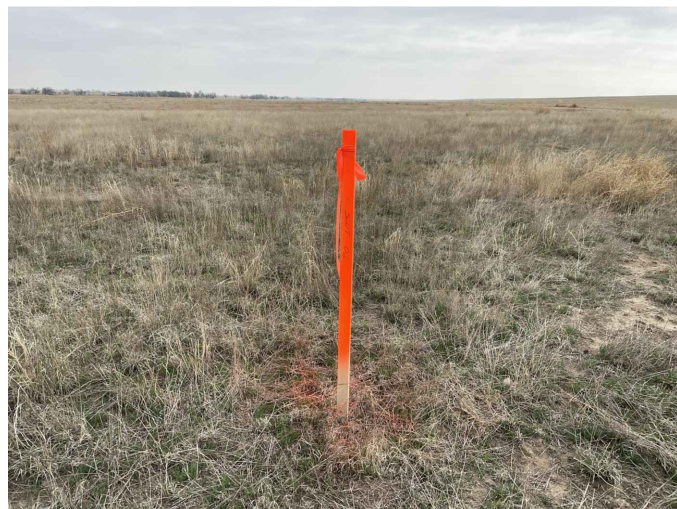
VIEW 1 – NORTH

Q: SENW SECTION: 36 TOWNSHIP: 7N RANGE: 63W 6TH. P.M. WELD COUNTY, CO DATE: 4/25/2024