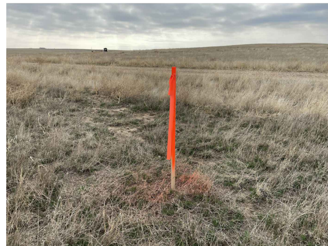
VIEW 3 – EAST