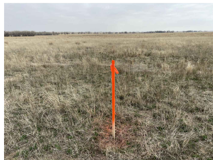
VIEW 7 – WEST