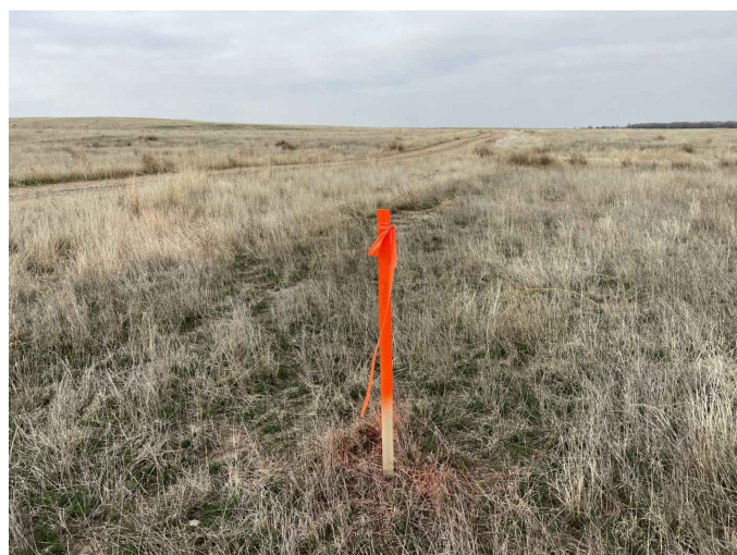
VIEW 5 – SOUTH