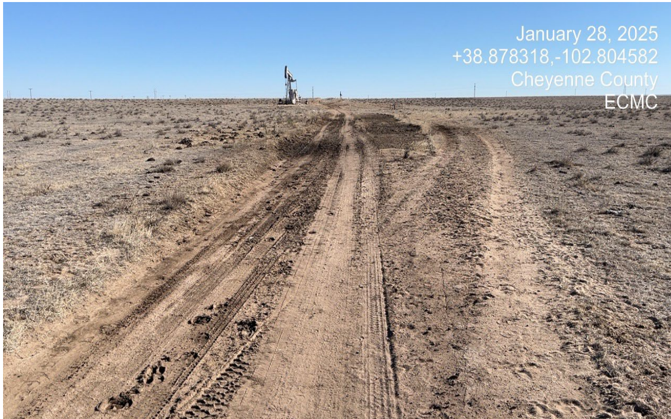
Photo 2. Facing east along the access road. Vehicles are causing unnecessary disturbance driving outside of the access road due to stormwater pooling on the road. The access road must be maintained and shall not drive outside of the access road boundary.