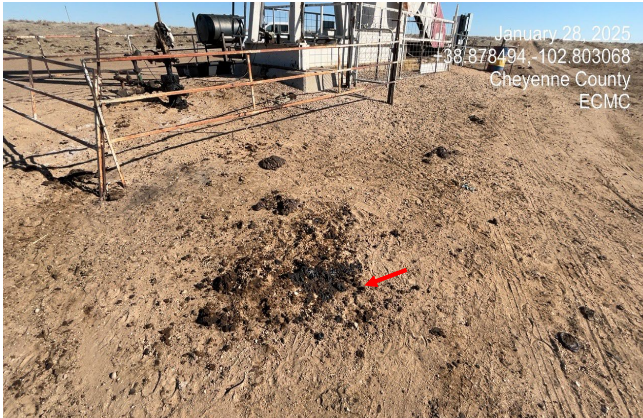
Photo 4. There are stained soils from a recent leak at the wellhead.