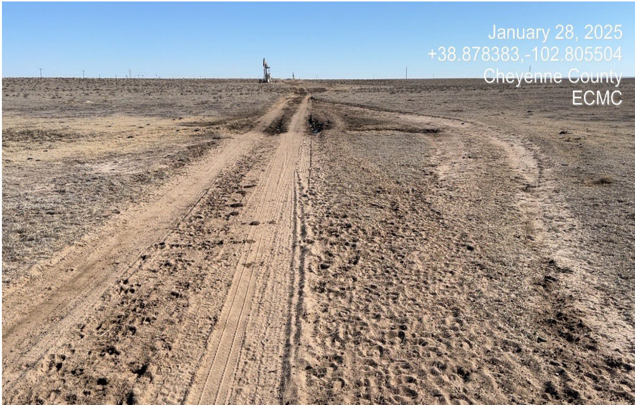
Photo 1. Facing east along the access road. Vehicles are causing unnecessary disturbance driving outside of the access road due to stormwater pooling on the road. The access road must be maintained and shall not drive outside of the access road boundary.