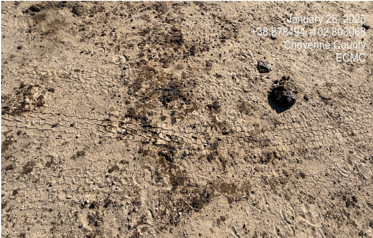
Photo 6. View of stained soils shows vehicle and cattle tracks on top of the stained soils.