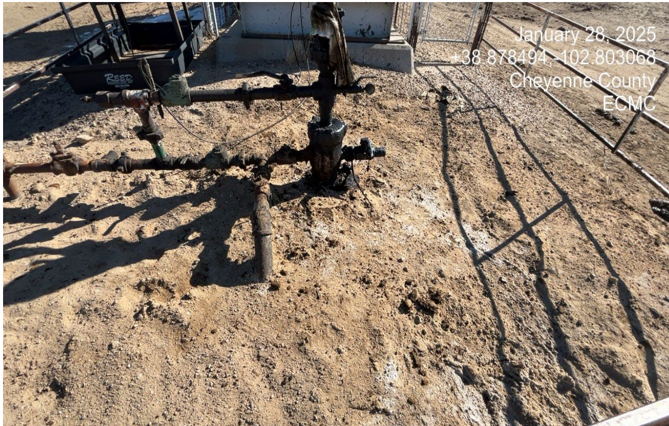
Photo 7. View of wellhead shows stained soils which appear to be covered up with sand.