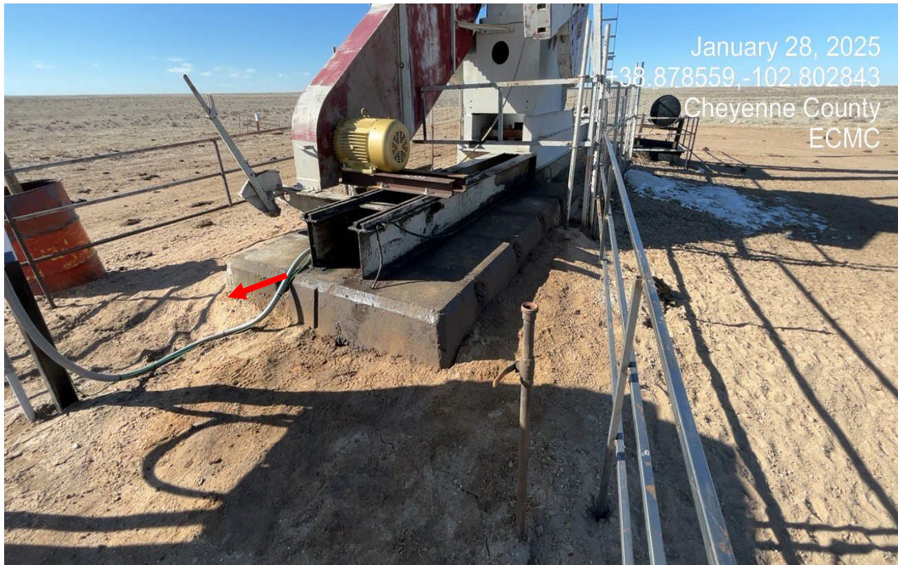
Photo 9. There are still oil stained soils at the pumpjack that have not been cleaned up.