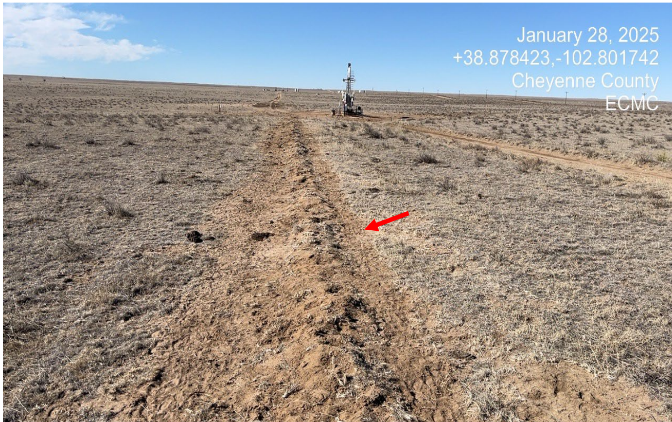
Photo 10. There has been new disturbance from a buried electric line to service the new electric motor at the pumpjack. The disturbed area will need to be reclaimed.