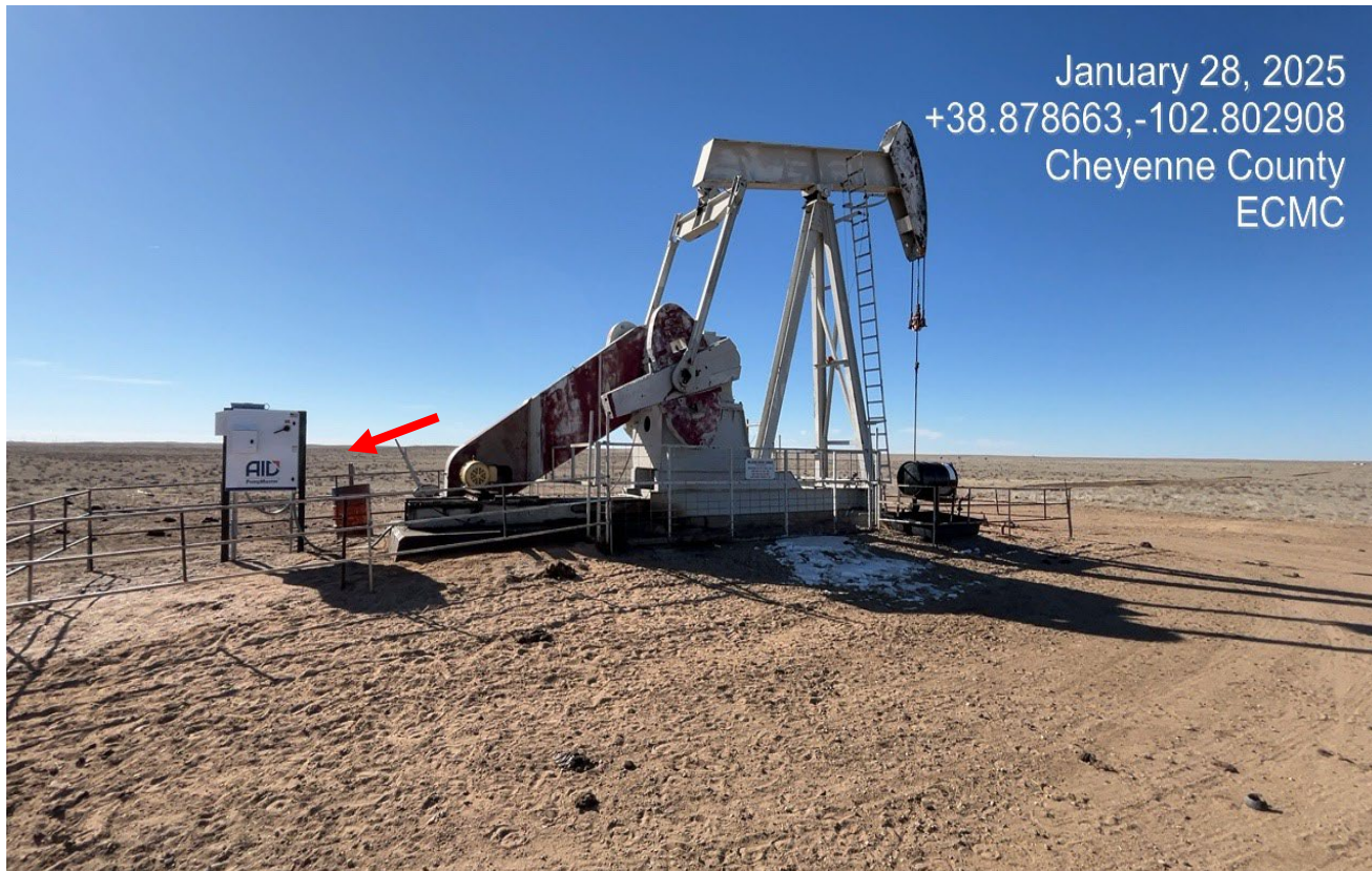
Photo 8. Facing southwest toward the wellsite. A new electric motor has been installed at the pumpjack.