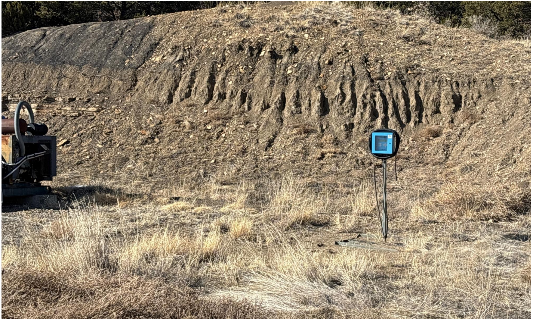
PHOTO 5: UNUSED EQUIPMENT STORED ON LOCATION APPEARS TO BE SOME KIND OF TELEMETRY EQUIPMENT.