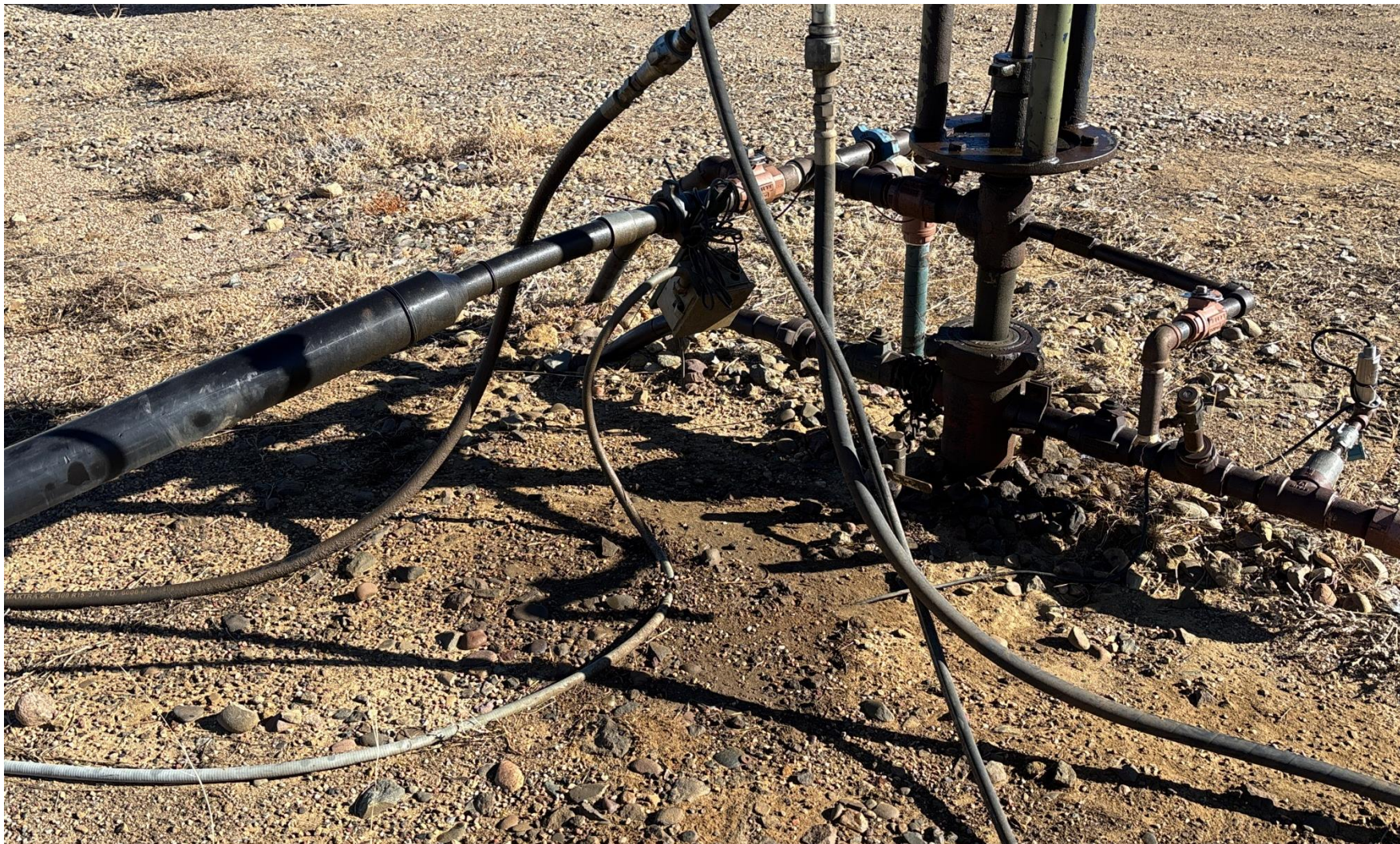
PHOTO 4: AREA OF IMPACTED SOIL AROUND WELLHEAD APPEARS TO BE FROM LEAKING DRIVEHEAD. Conduct maintenance on equipment, cleanup stained material and review self inspection processes. COMPLY WITH RULE 1002,(2).D. CA DATE 1-10-2025.