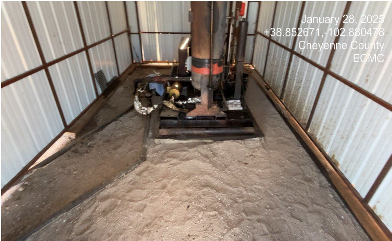
Photo 7. Inside the engine shed. It appears the leak was repaired. There is fresh sand in this area and it is presumed that oily waste was cleaned up.