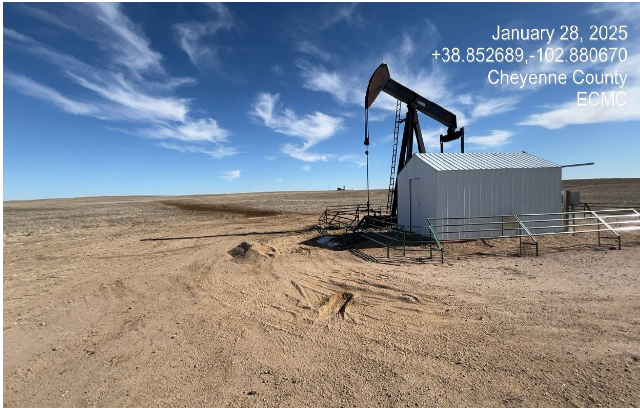
Photo 1. Facing east at the location. There was a leak at the wellhead that had just occurred. The leak misted off the location which will require the spil to be reported and properly cleaned up.