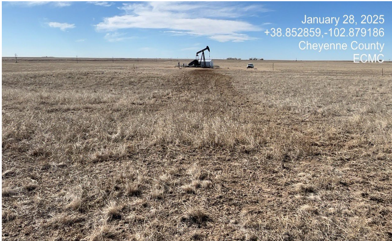
Photo 5. Standing at the approximate end of the stained grass which was 375' from the wellhead.