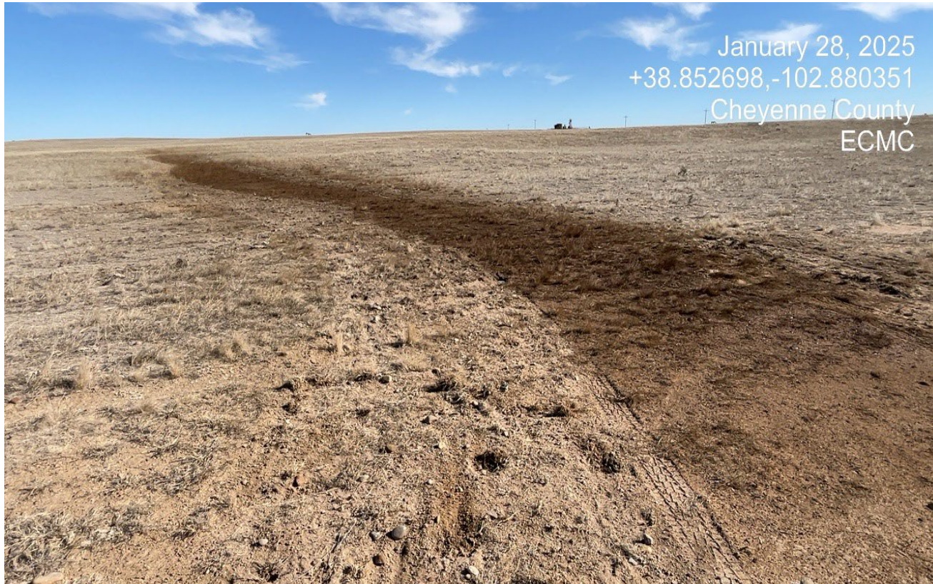
Photo 4. Facing east toward the misted spill that went off location. Part of this area was dragged which covered some of the stained soils.