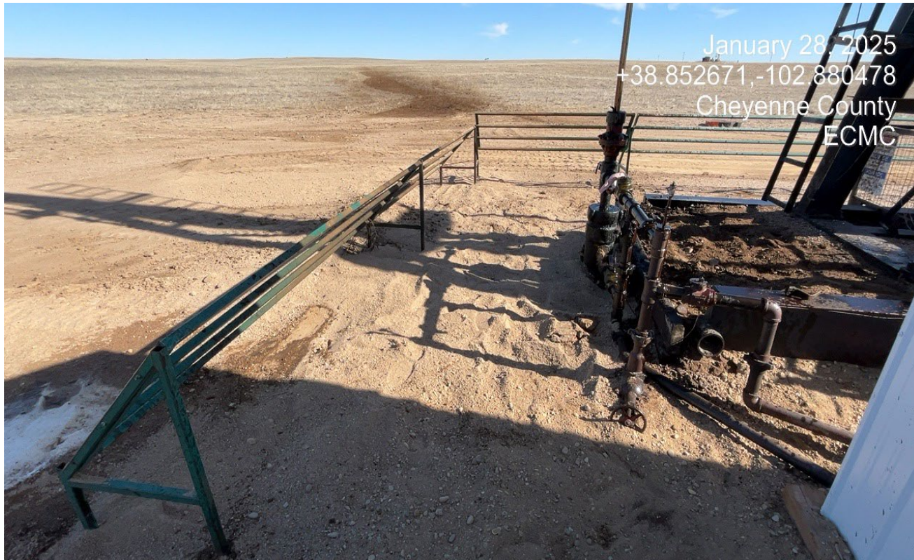
Photo 2. Facing east at the wellhead. There was a leak at the wellhead that had just occurred. Workers that were at the site have spread sand over this area and were dragging out the stained soil.