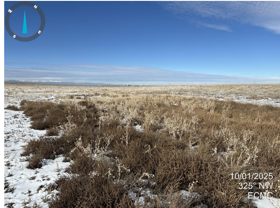
Photo 2. Overview of well location looking northwest across well site. Undesirable annual weedy species Kochia and Russian thistle are dominant throughout the site.