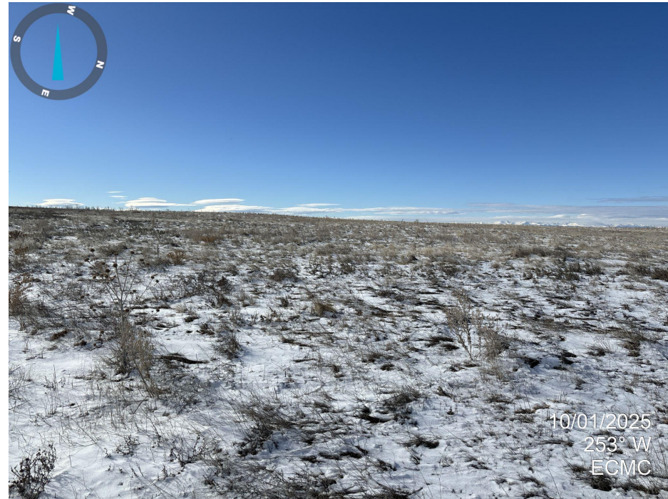
Photo 6. Reference area. taken west of well location.