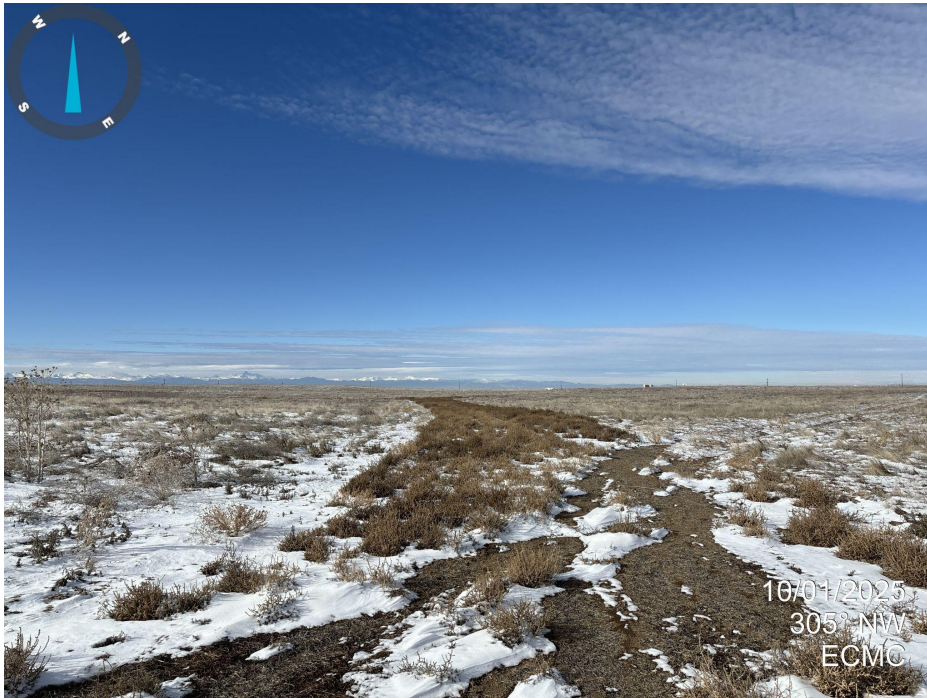
Photo 1. Looking northwest along access road from road junction. Undesirable annual weedy species Kochia and Russian thistle are dominant on the access road.