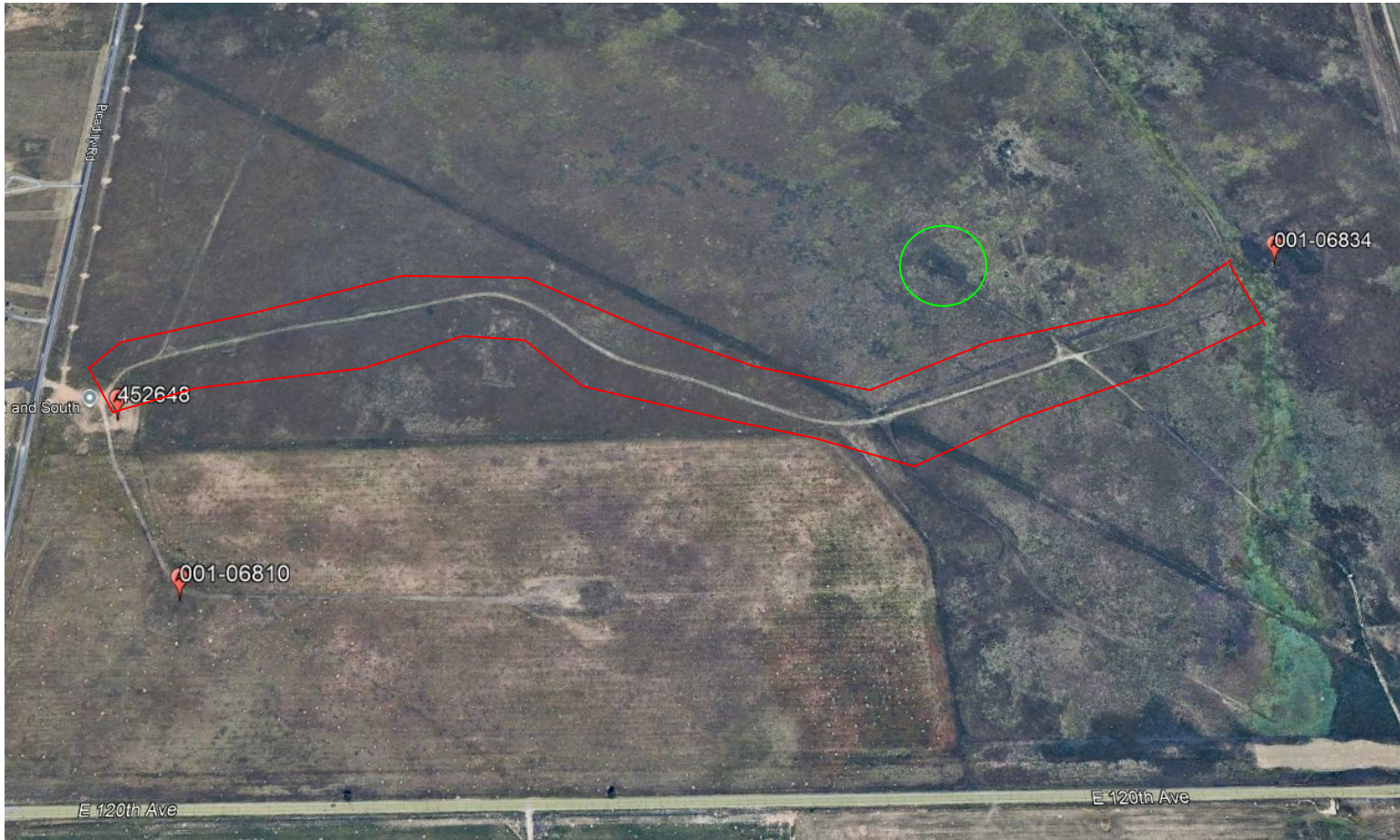
Photo 7. Aerial Photo from google 09/2023. All wells being serviced by main access road are plugged and abandoned. Vegetation has not established on access road. Main access road appears to require further reclamation (red circle). Also pictured is wellsite (green circle).