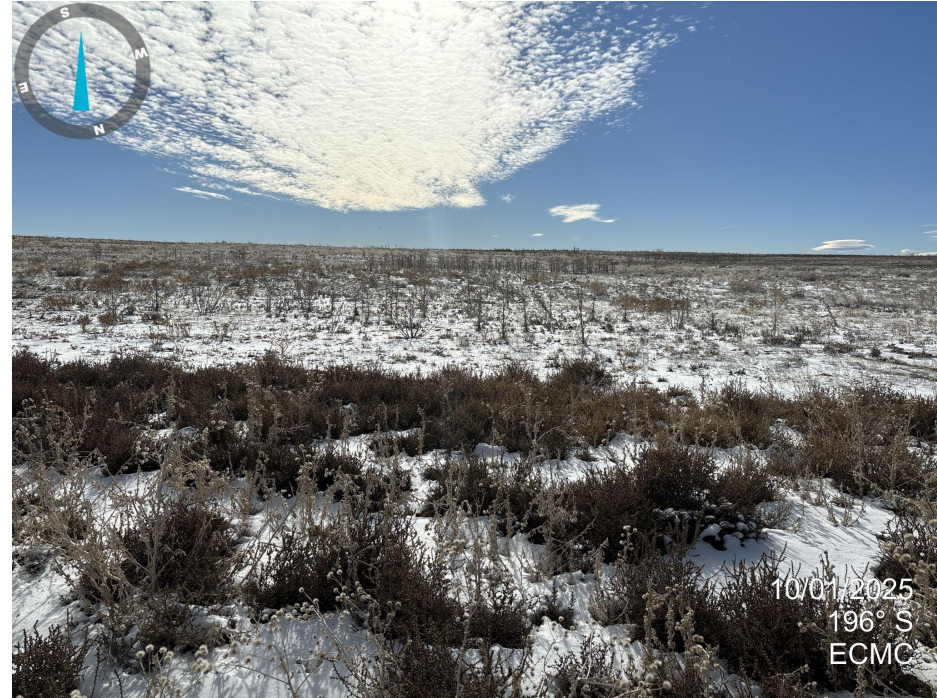
Photo 4. Looking south from well location. See Photo 2 comments.