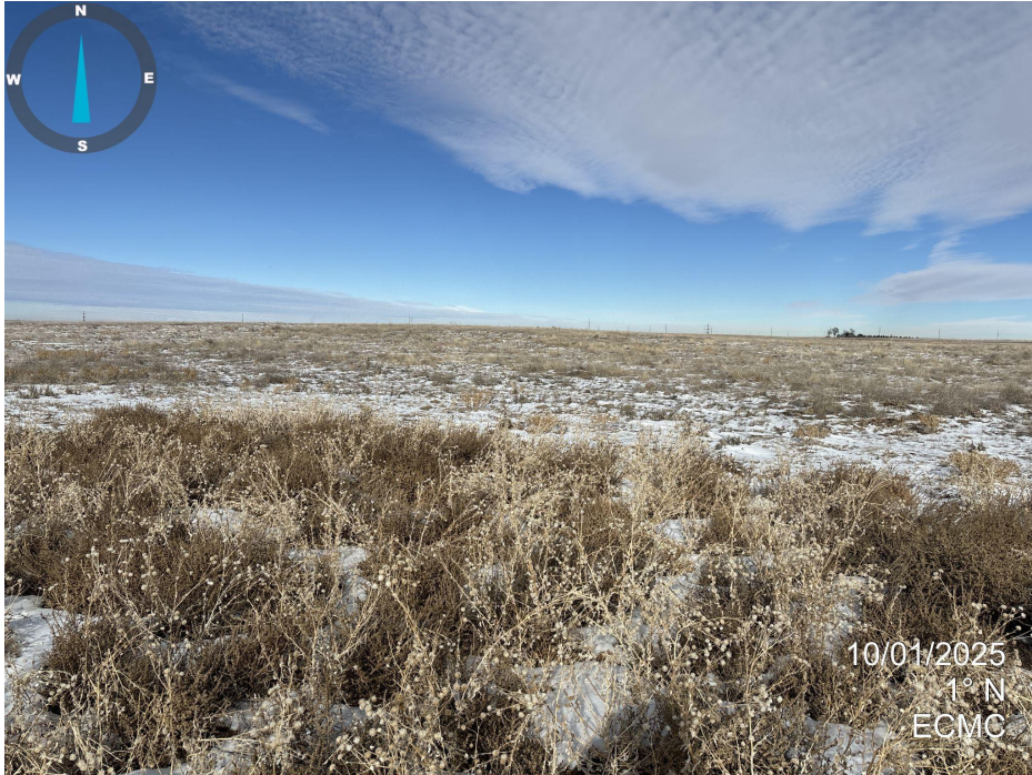
Photo 3. Looking north from well location. See Photo 2 comments.