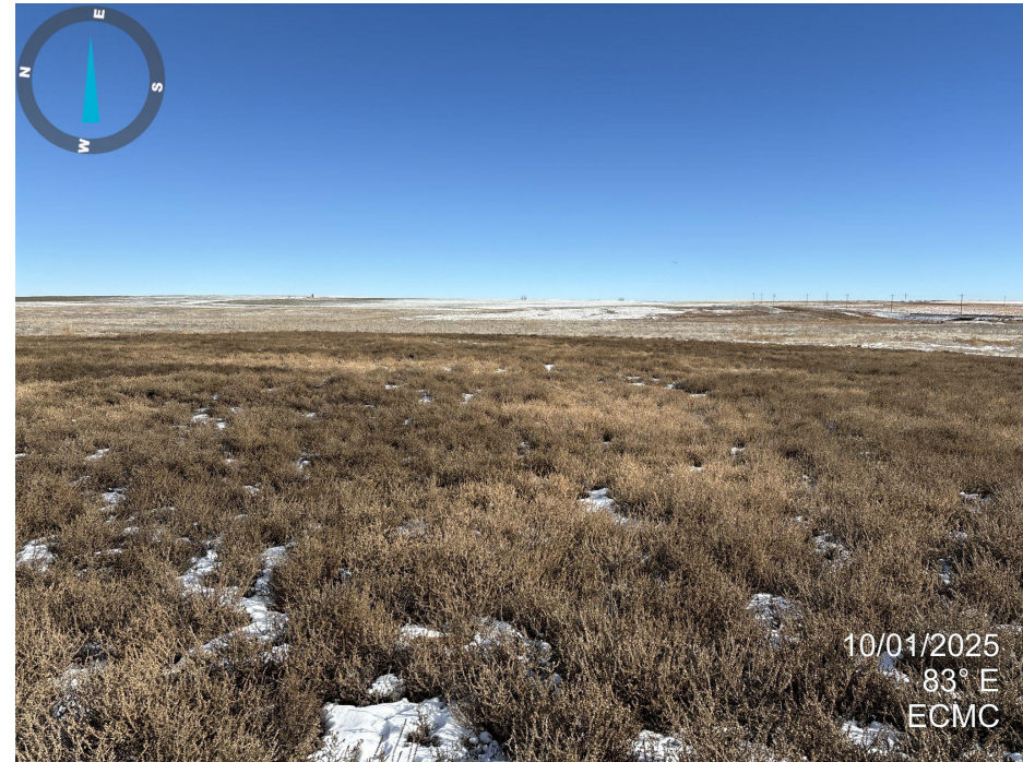
Photo 2. Overview of well location looking east across well site. Undesirable annual weedy species Kochia and Russian thistle dominate location.