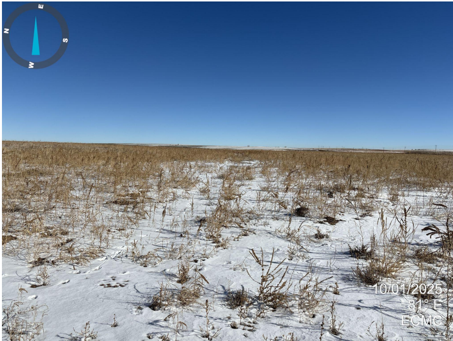
Photo 1. Looking east along access road from well location ID #319795 toward well site. It appears that this section of access road is progressing towards 80% of reference area vegetation.