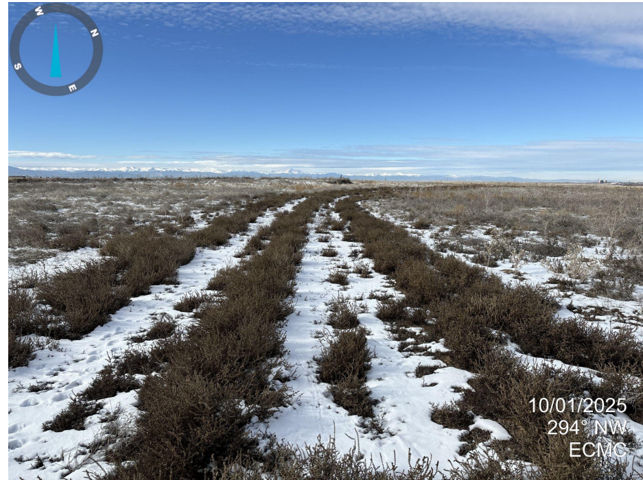
Photo 6. Looking west along north access road from well location. Kochia and Russian thistle are dominant along access road.