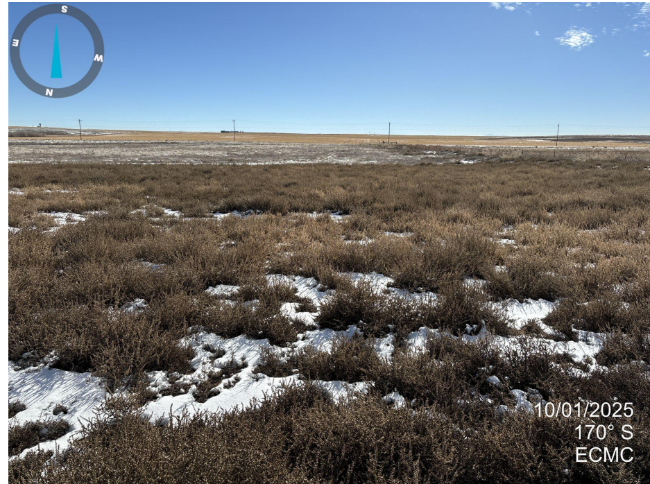
Photo 4. Looking south from well location. See Photo 2 comments.