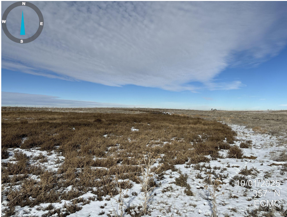
Photo 5. Looking north from east side of location towards northern access road. List B noxious weeds Bull thistle and Scotch thistle are present on location.