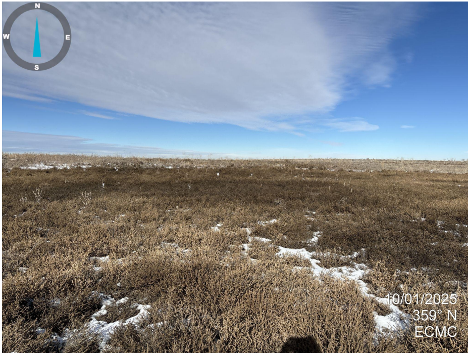
Photo 3. Looking north from well location. See Photo 2 comments.