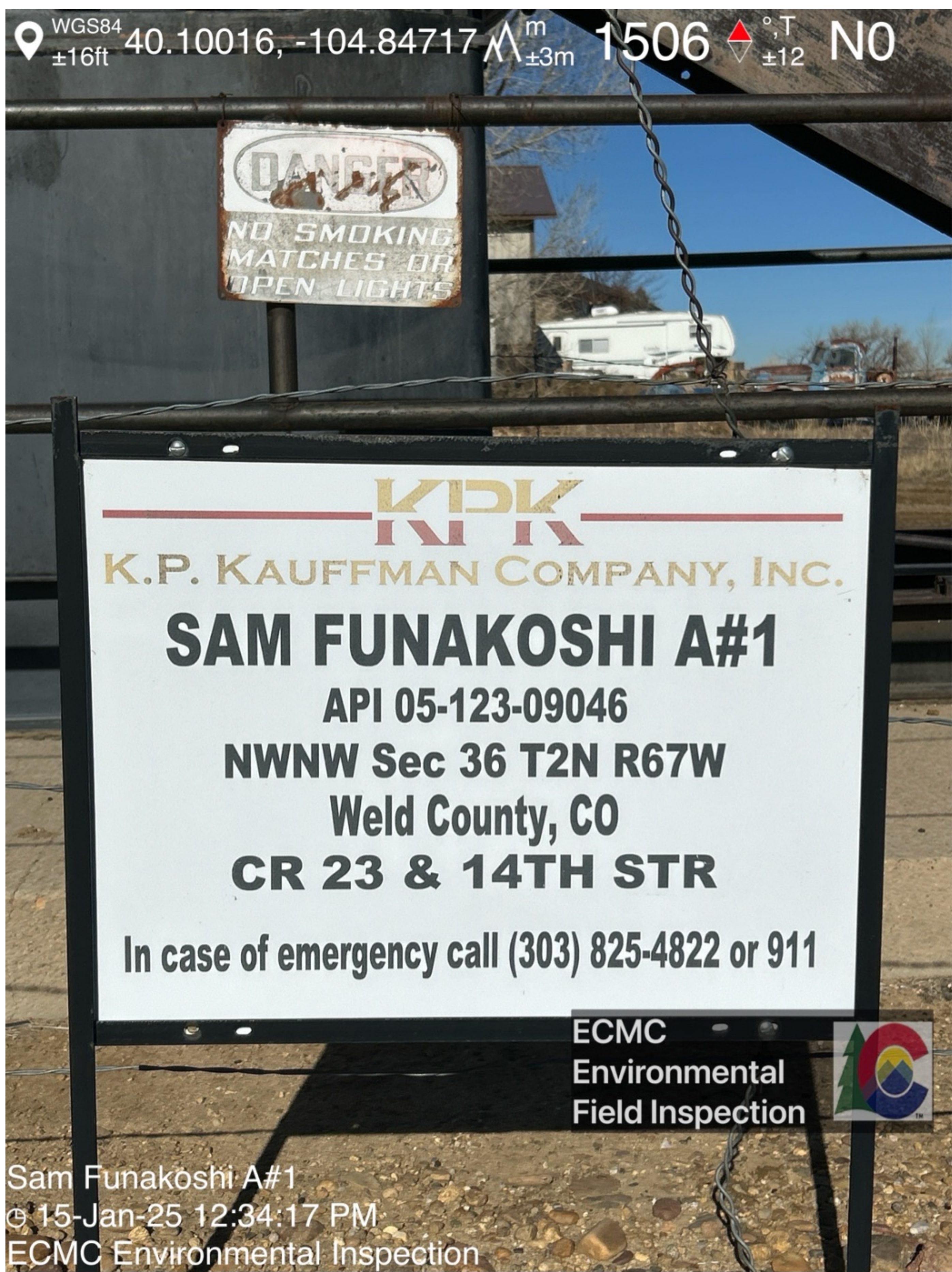
Signage visible at wellhead.